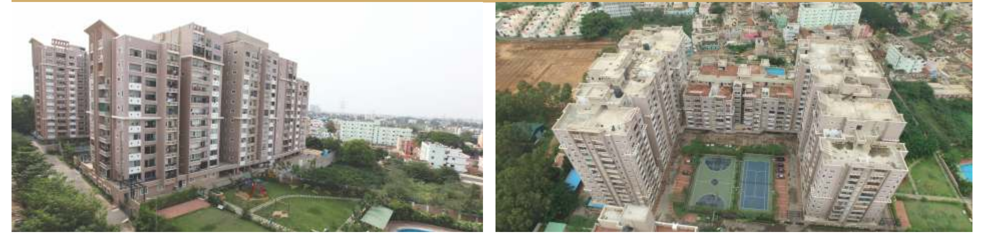
SMR VINAY GALAXY, HOODI JUNCTION, WHITEFIELD