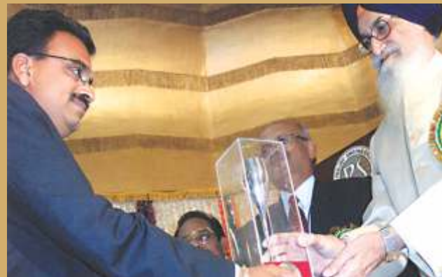
Receiving quality award for excellent & innovative construction from H.E. Shri Surjeet Singh Barnala (Governor of A.P.) in 2003