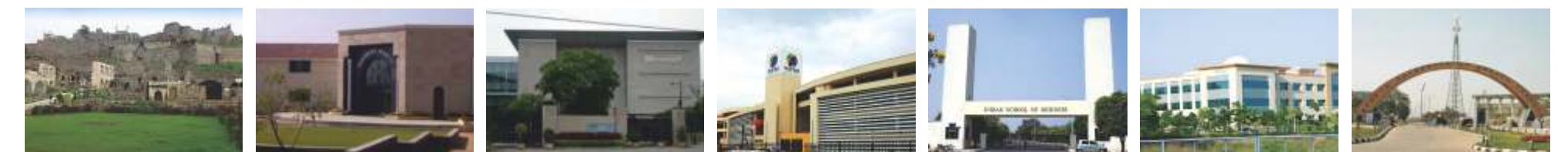
Golkonda Fort Glendale Academy Microsoft Wipro ISB Infosys Gachibowli Stadium

Proximity to work places, reputed schools and healthcare makes Bandlaguda a preferred residential location. A wide spectrum of IT professionals, NRIs and employees in nearby SEZs, as well as the airport and airline staff will love SMR Vinay Casa Carino for its connectivity and eco-friendly environment.