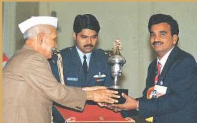
Receiving award for Best Architectural Performance from His Excellency Shri Shankar Dayal Sharma in 1996 at Rashtrapathi Bhavan