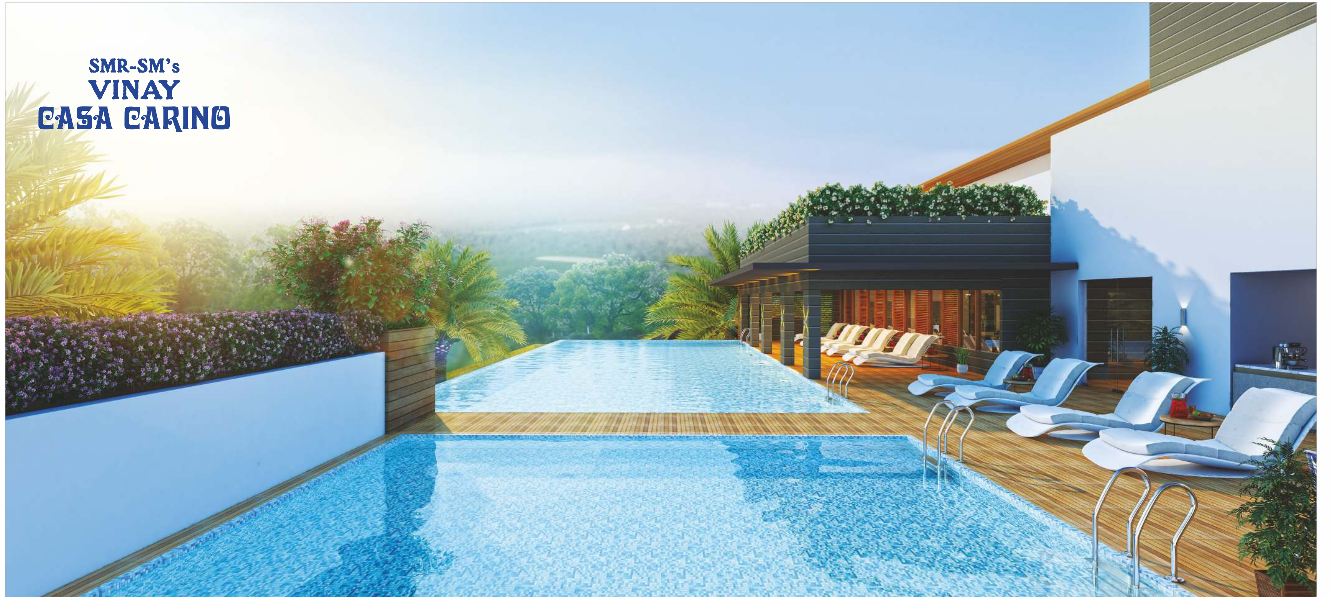
CLUB TERRACE POOL VIEW