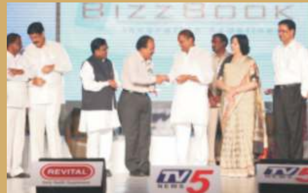
TV 5 Business Leader 2012 Award in Mid-Segment by the Chief Minister of Andhra Pradesh