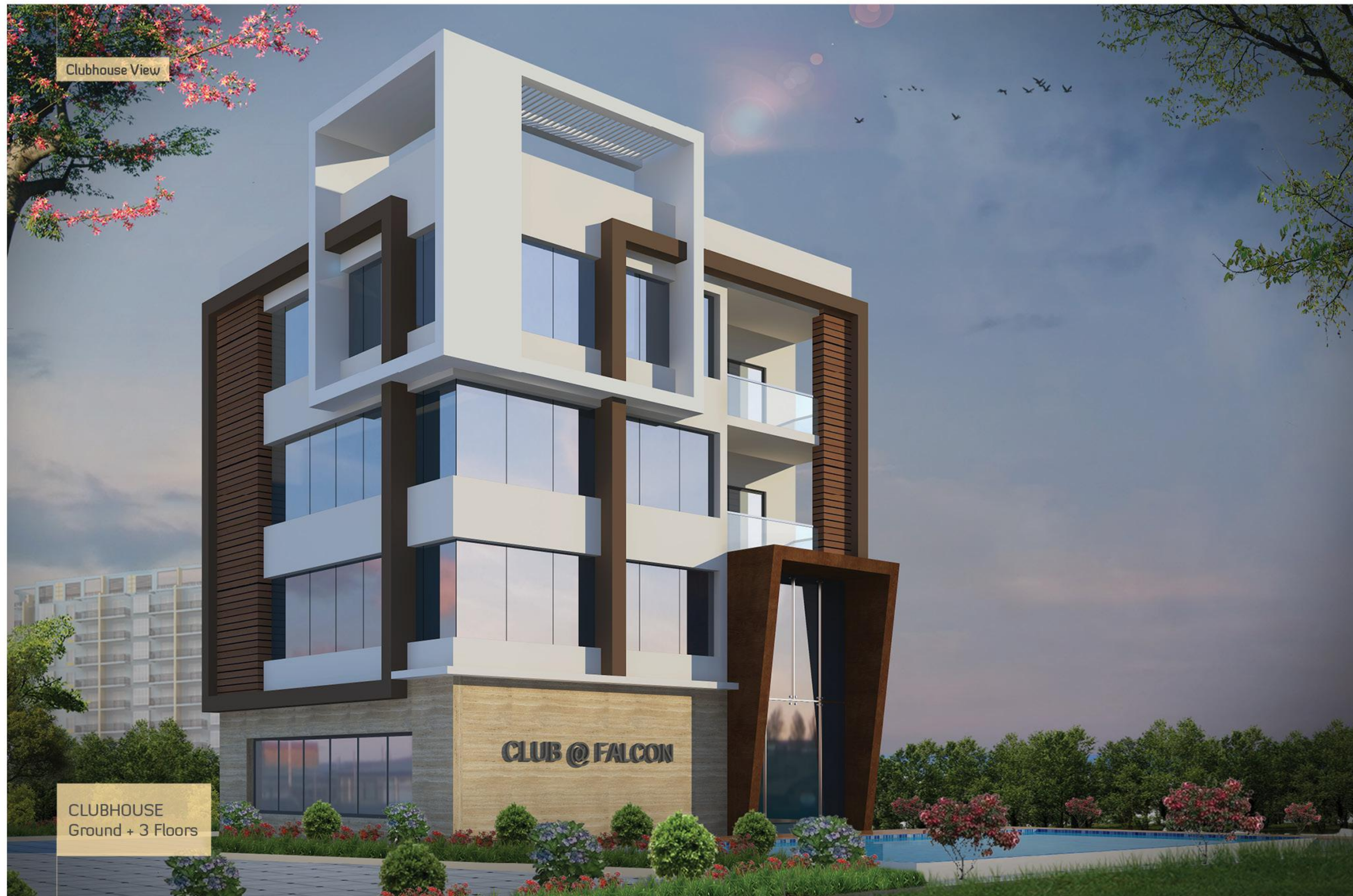
CLUBHOUSE Ground + 3 Floors