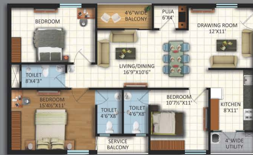
T-3, Flat-8 | 3BHK | 1580sft