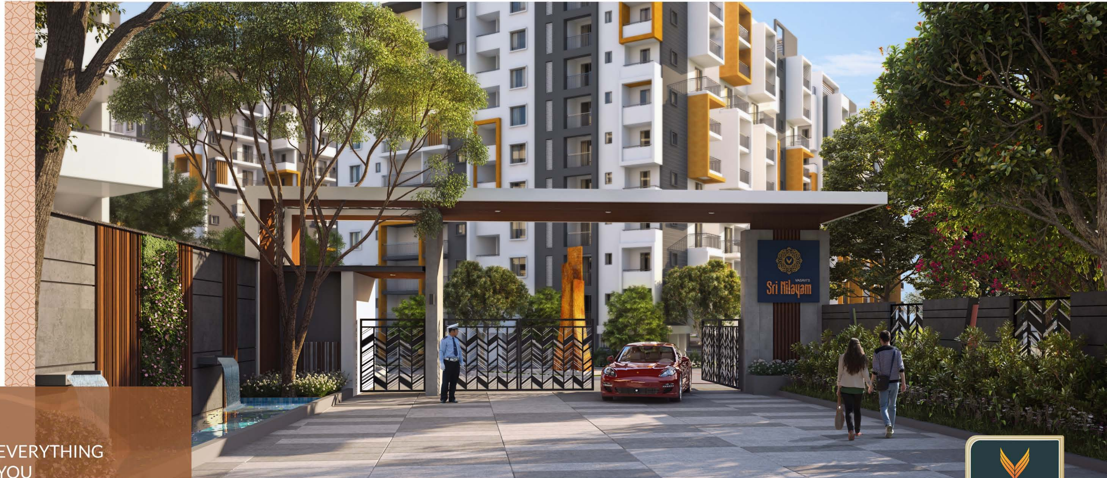
Grand entrance view

EVERYTHING YOU HAVE BEEN WAITING FOR, LIKE NOTHING YOU EXPECTED.