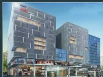
VASAVI MPM GRAND Ameerpet