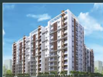
VASAVI SOLITAIRE HEIGHTS Ameerpet