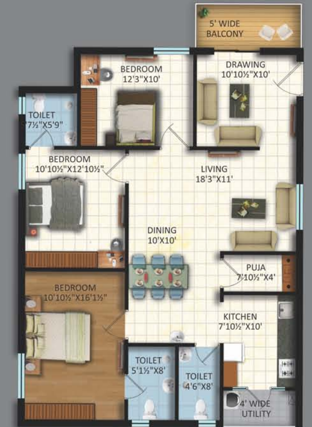
T-11, Flat-14 | 3BHK | 1640sft