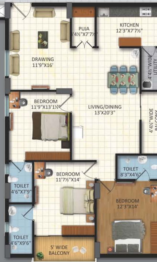
5 | 3BHK | 1895sft