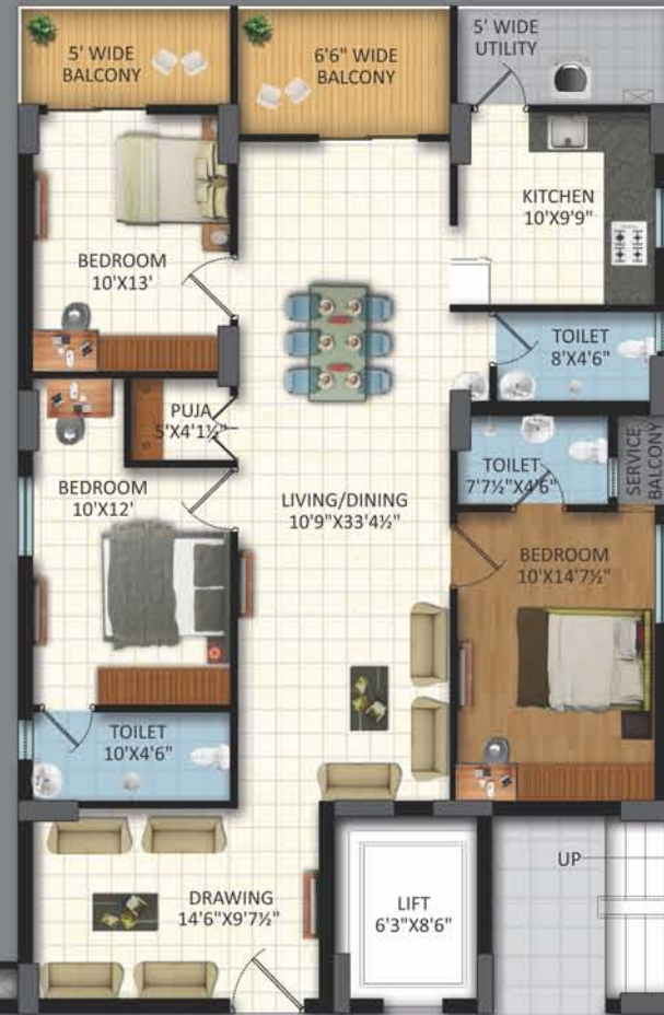
2 | 3BHK | 1890sft