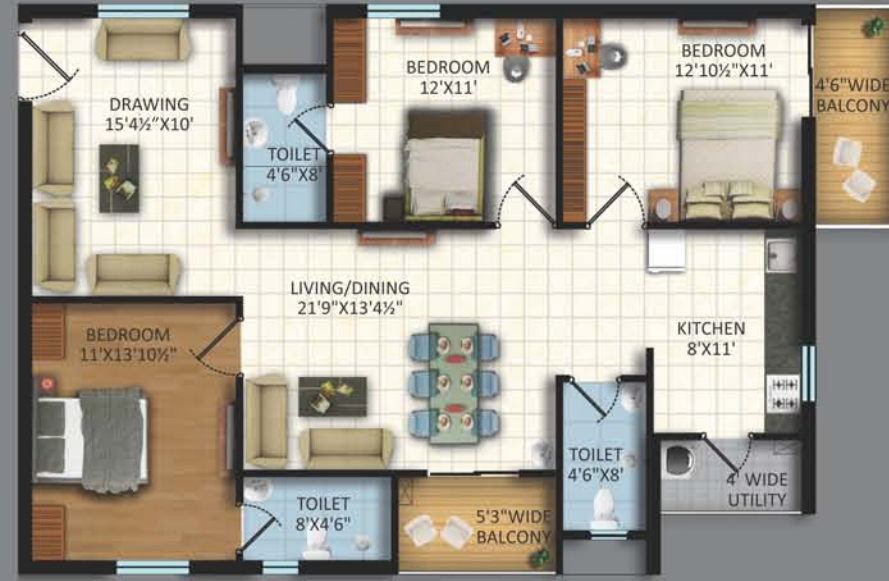
T-6, Flat-2 | 2BHK | 1685sft