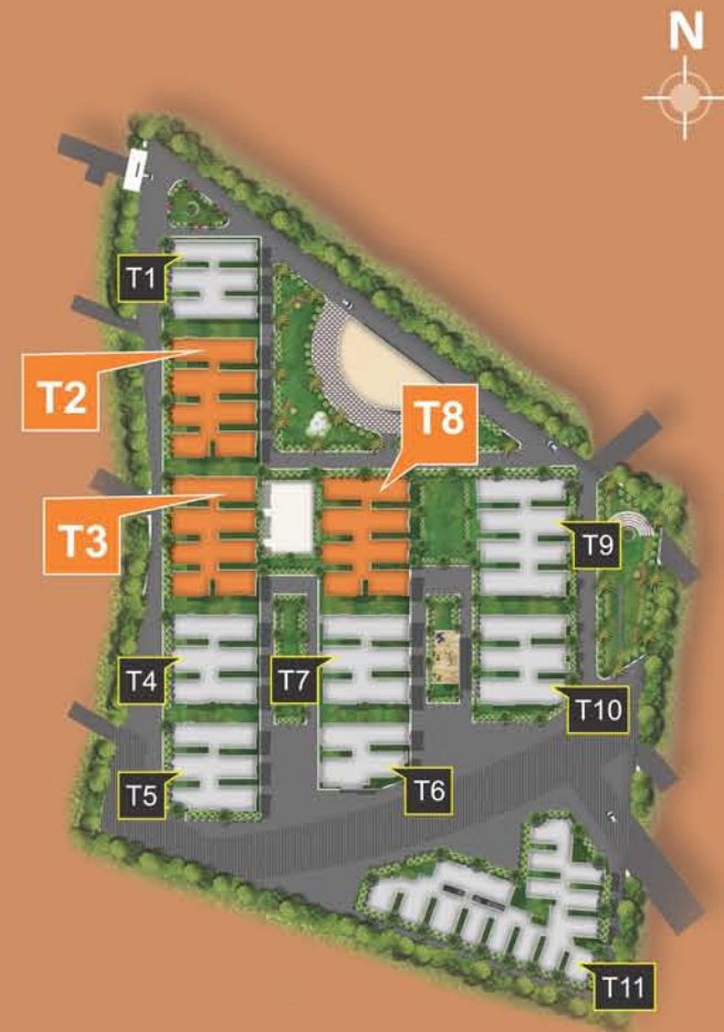
Area Statement in sft.