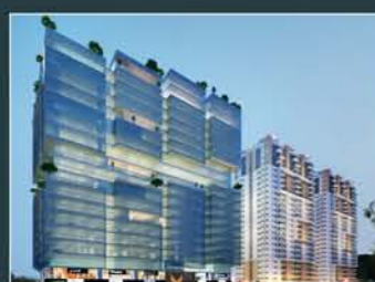
VASAVI CYBER PARK Gachibowli