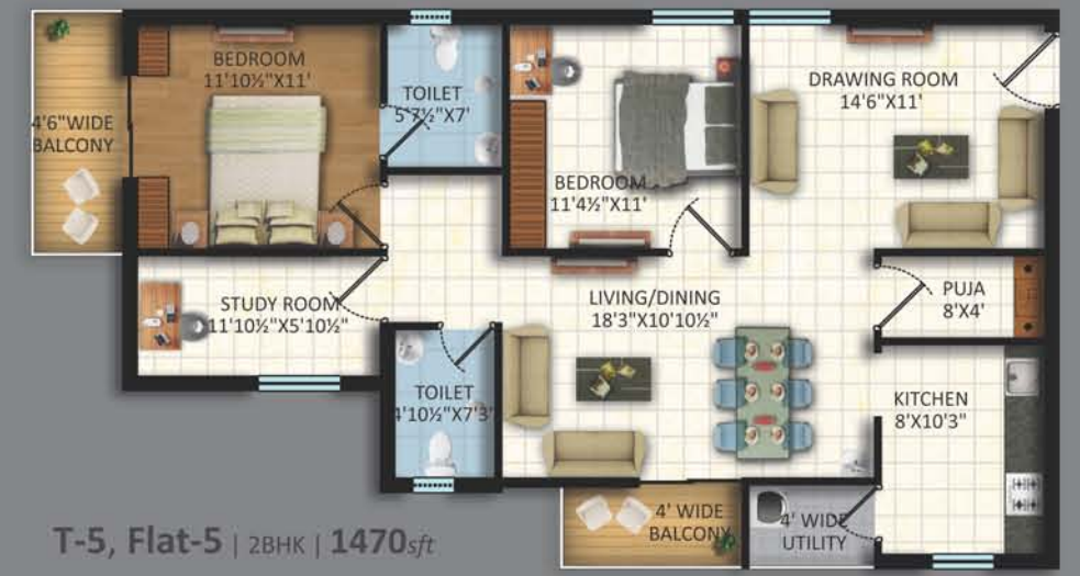
T-5, Flat-5 | 2BHK | 1470sft