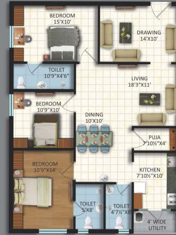
T-11, Flat-13 | 3BHK | 1590sft