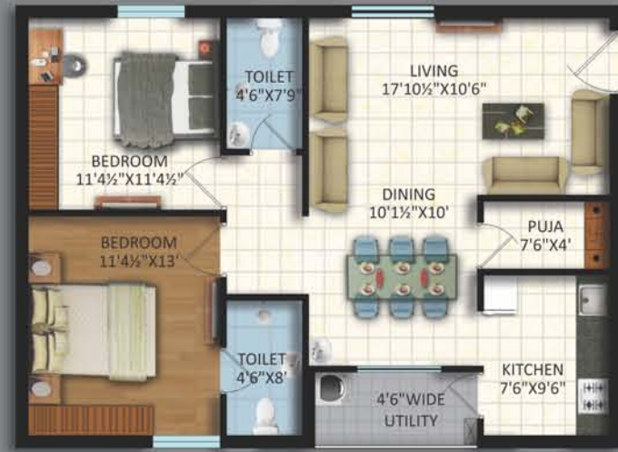
T-3, Flat-6 | 2BHK | 1180sft