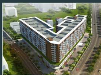
VASAVI SIGNATURE Kukatpally