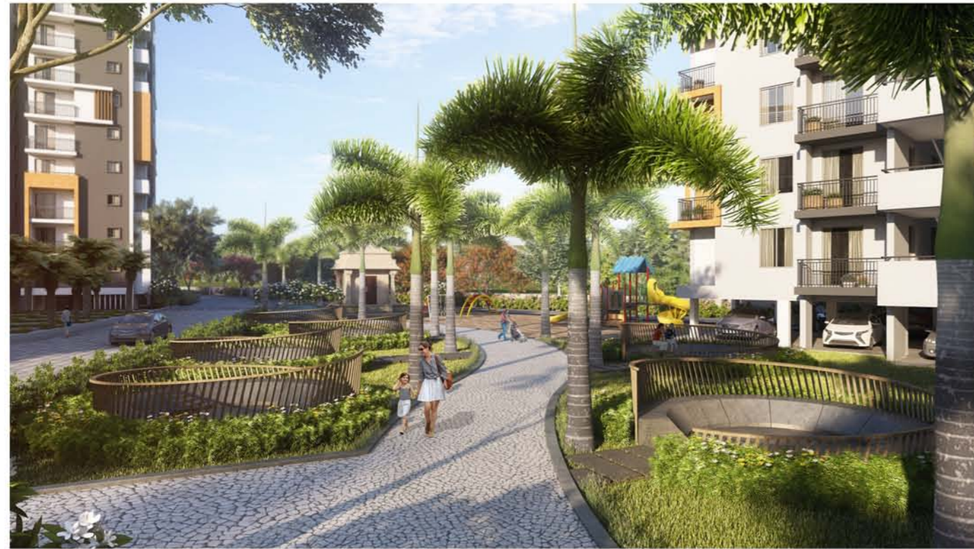
ambient seating within lush landscape