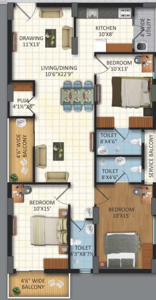
6 | 3BHK | 1650sft