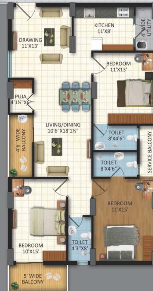
7 | 3BHK | 1710sft