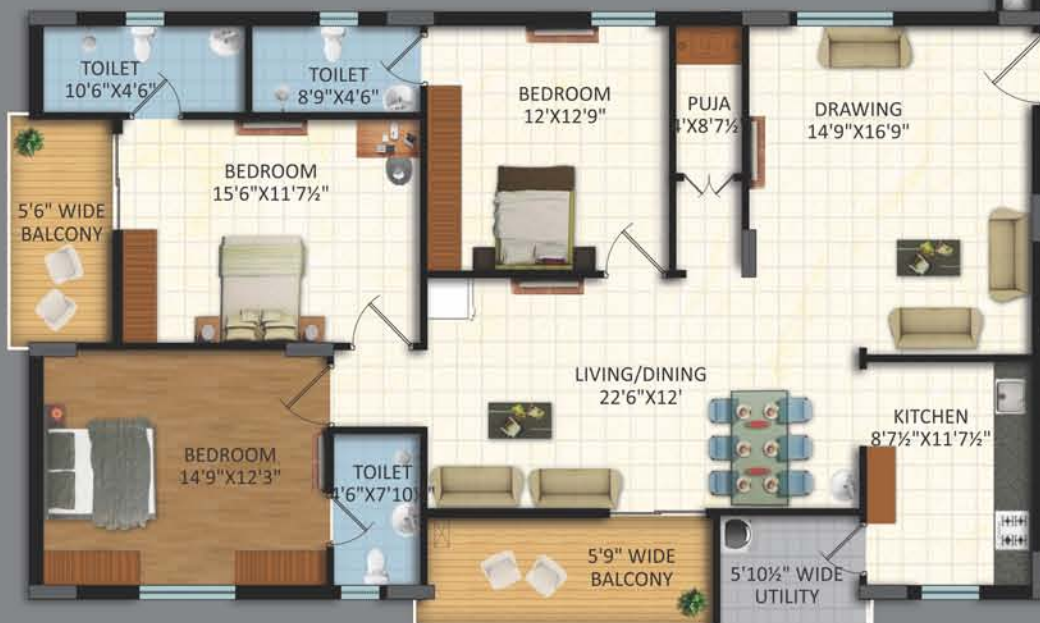
4 | 3BHK | 2080sft