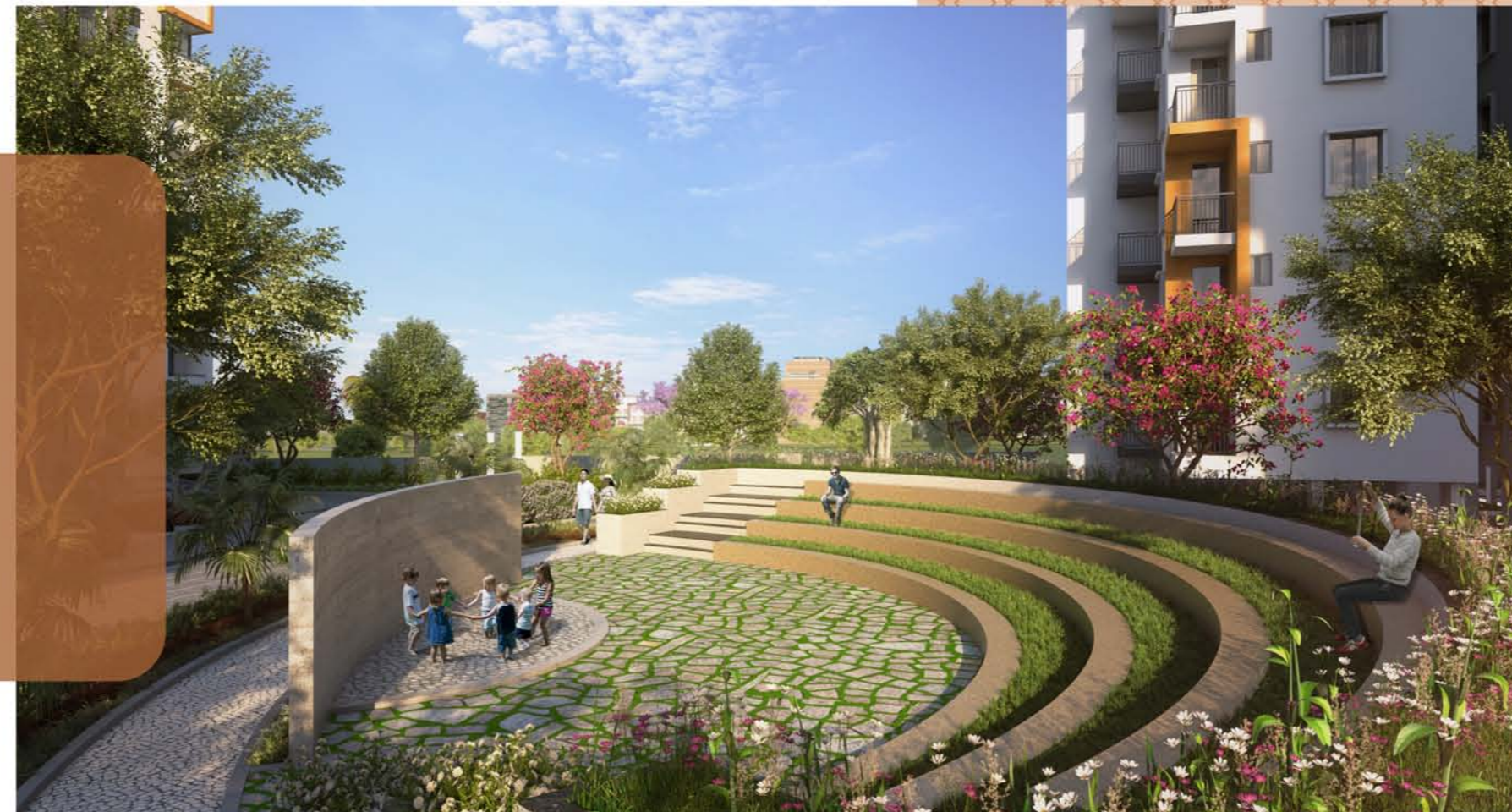
amphitheatre through lush landscapes