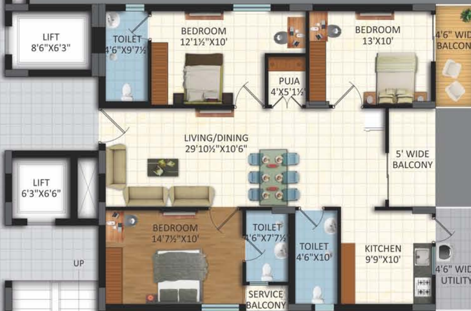
2 | 3BHK | 1600sft