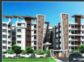
VASAVI BHUVANA Srinagar colony