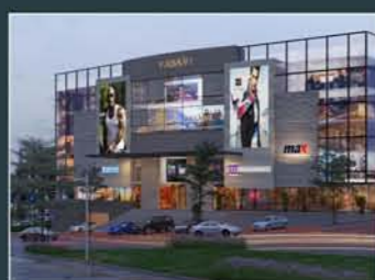
VASAVI CORPORATE Banjara Hills