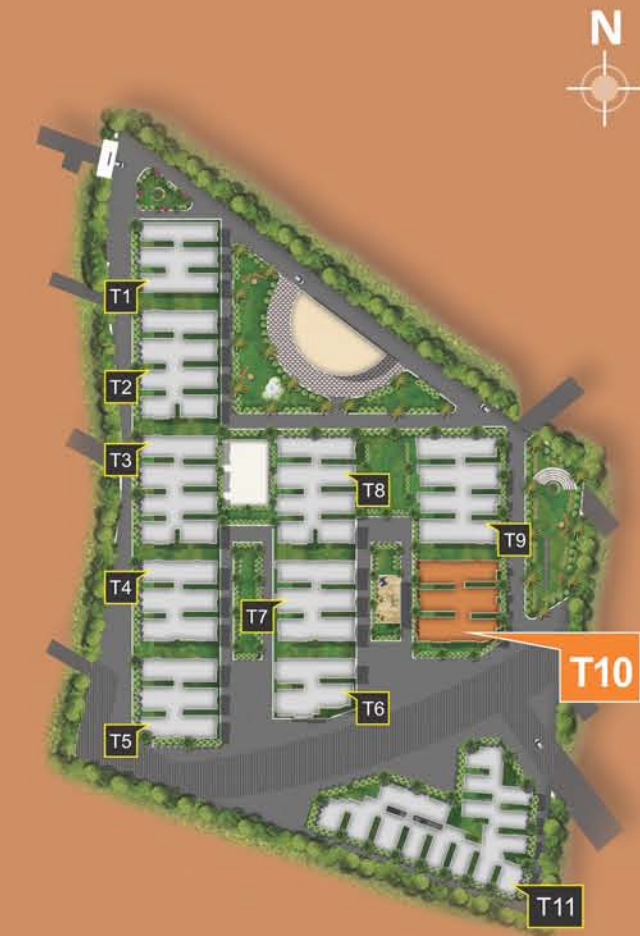
Area Statement in sft.