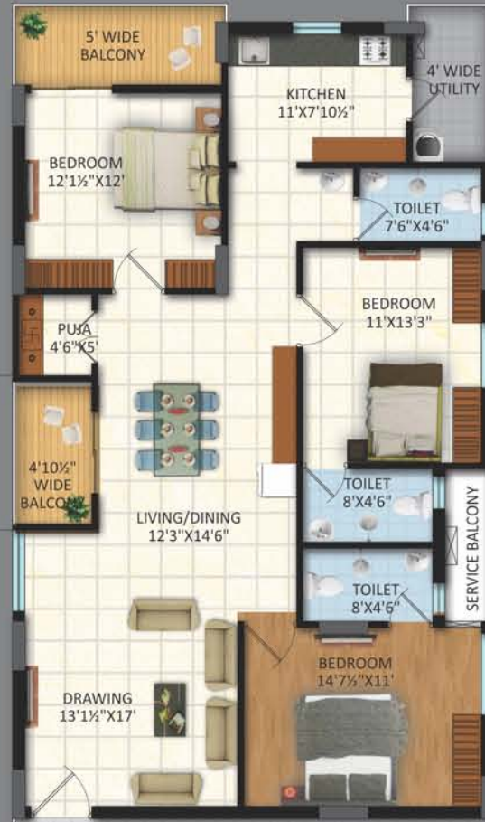
1 | 3BHK | 1840sft