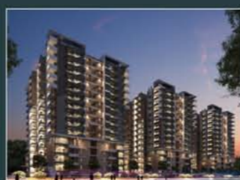
VASAVI LAKE CITY Hafeezpet