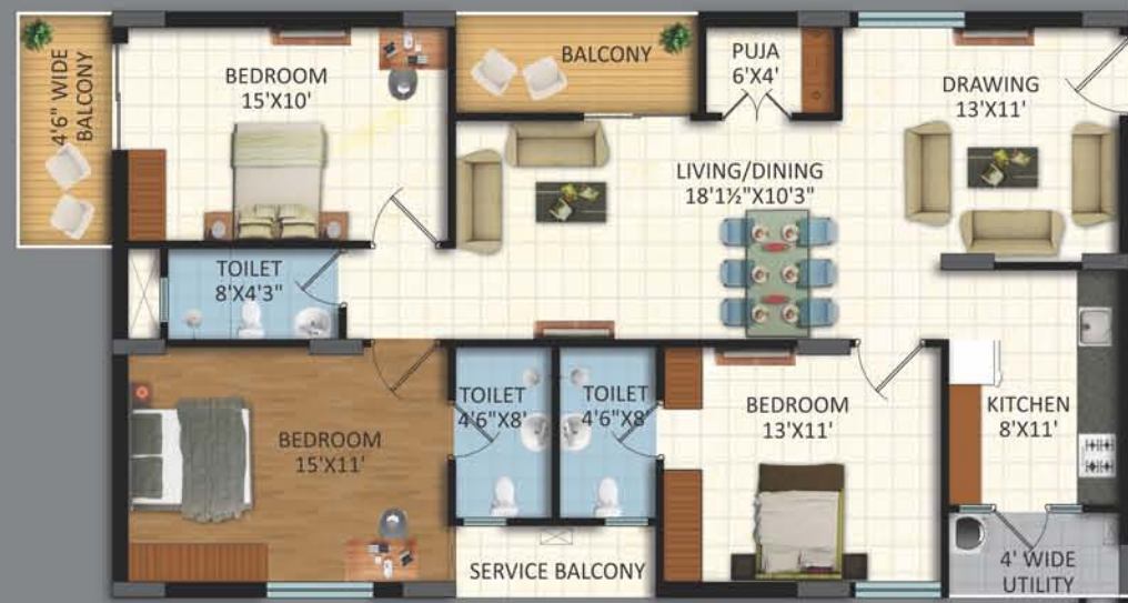
5 | 3BHK | 1710sft