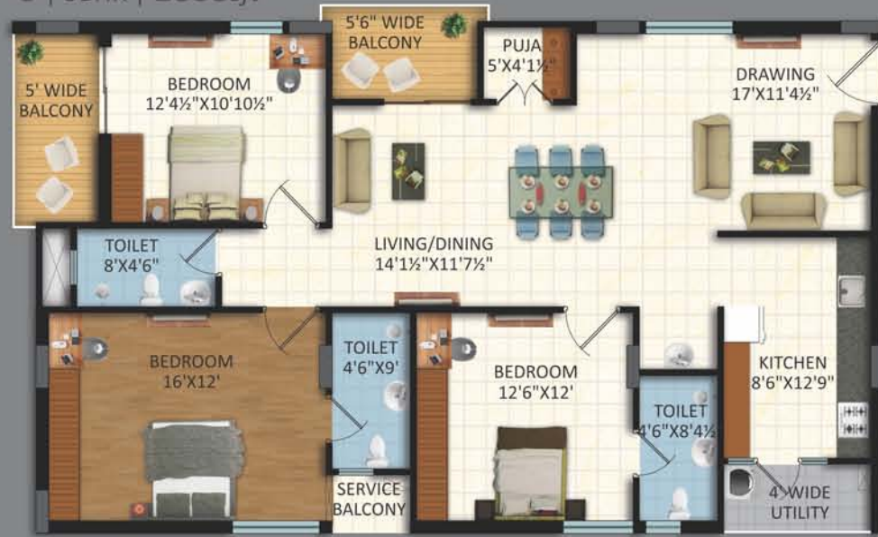
6 | 3BHK | 1835sft