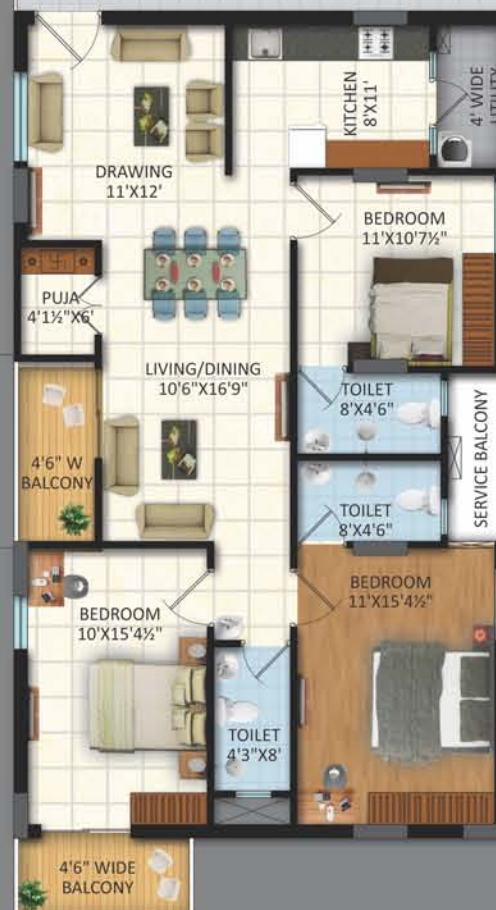
8 | 3BHK | 1635sft