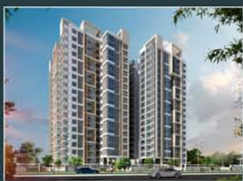
VASAVI SRINIVASAM Kondapur