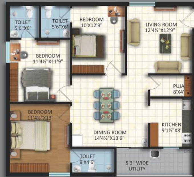
T-3, Flat-7 | 3BHK | 1485sft