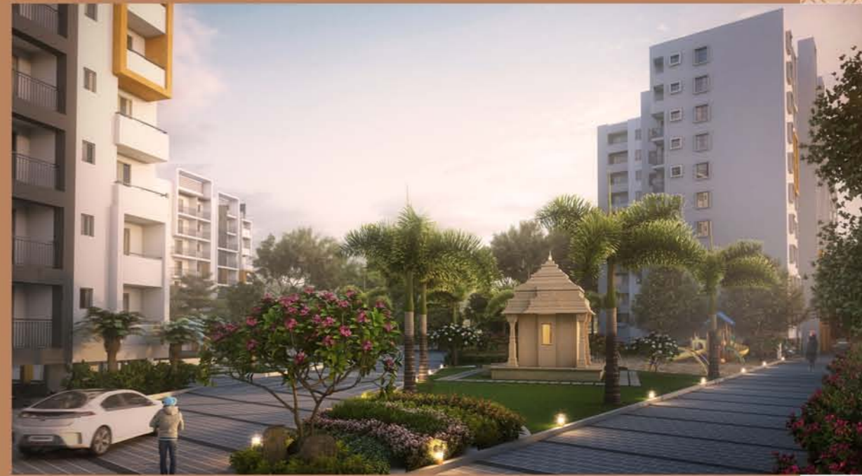
Viwe towards temple landscape