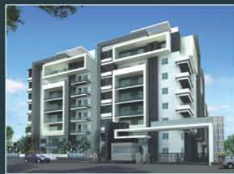
VASAVI SHANTHINIKETHAN Whitefields, Kondapur