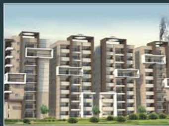
VASAVI BRINDAVANAM Motinagar