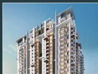
VASAVI GP TRENDS Nankramguda