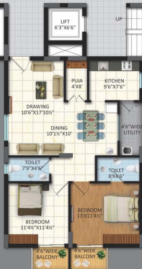
6 | 2BHK | 1265sft