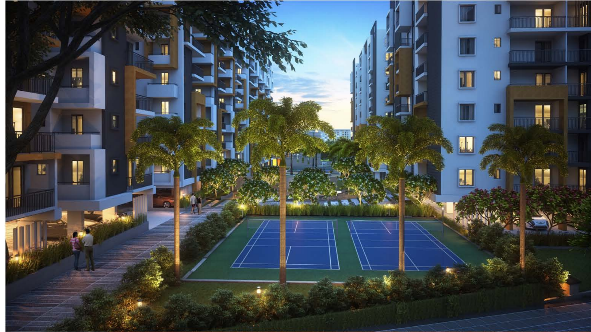
Multi purpose court

A walk through the greens You would agree that there isn't a better note to end the day on, even when you're already looking forward to the promise of the next one, which would be nothing like expected.