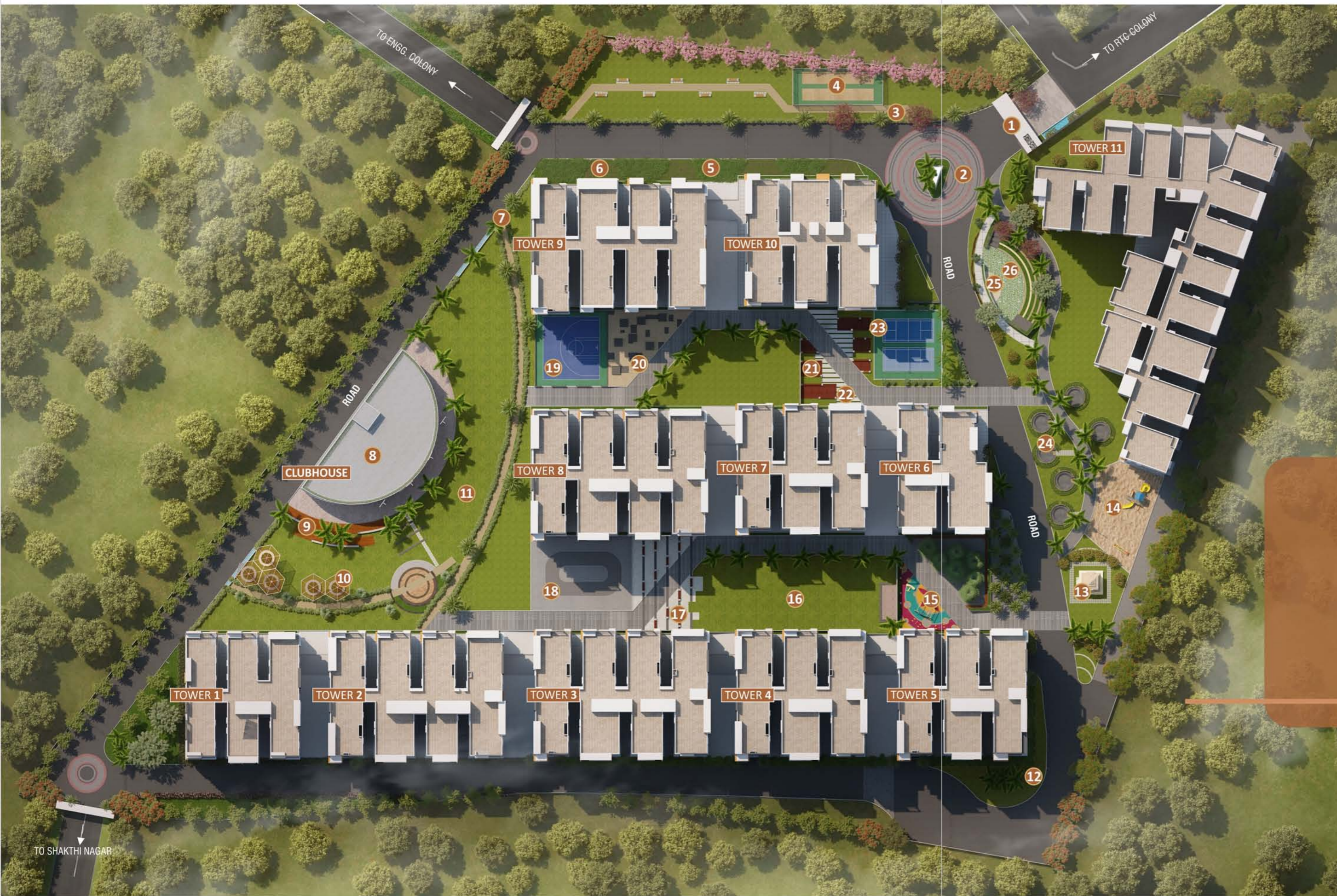
Master Plan view