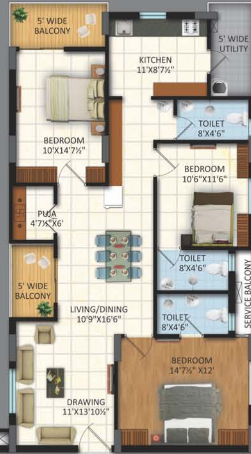
2 | 3BHK | 1705sft