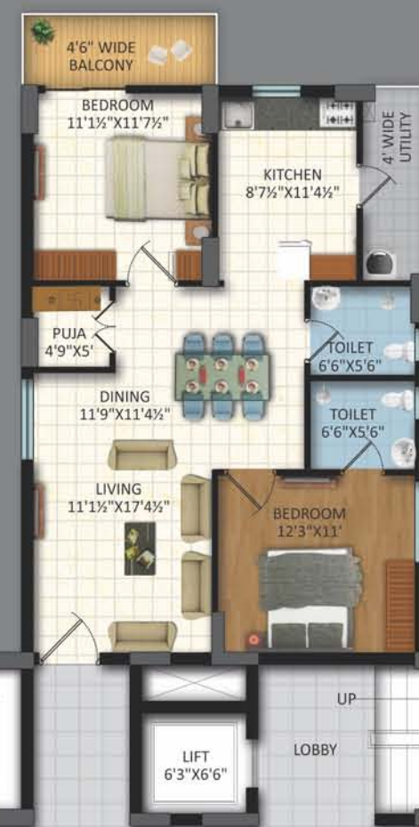
3 | 3BHK | 1205sft