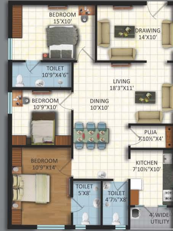
T-11, Flat-12 | 3BHK | 1590sft