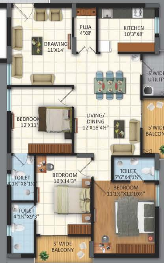
5 | 3BHK | 1660sft