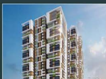
VASAVI LIFE Madhapur