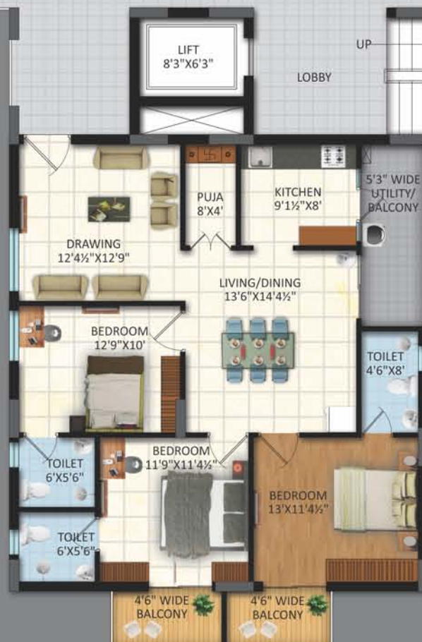
7 | 3BHK | 1600sft