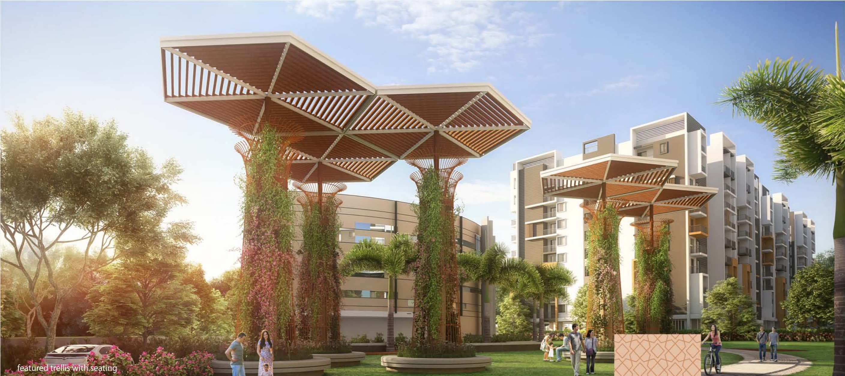
featured trellis with seating