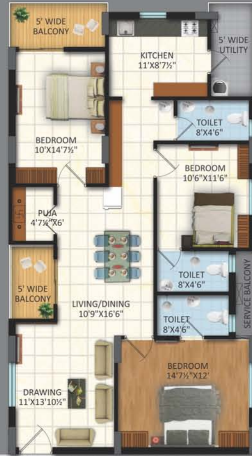
3 | 3BHK | 1705sft