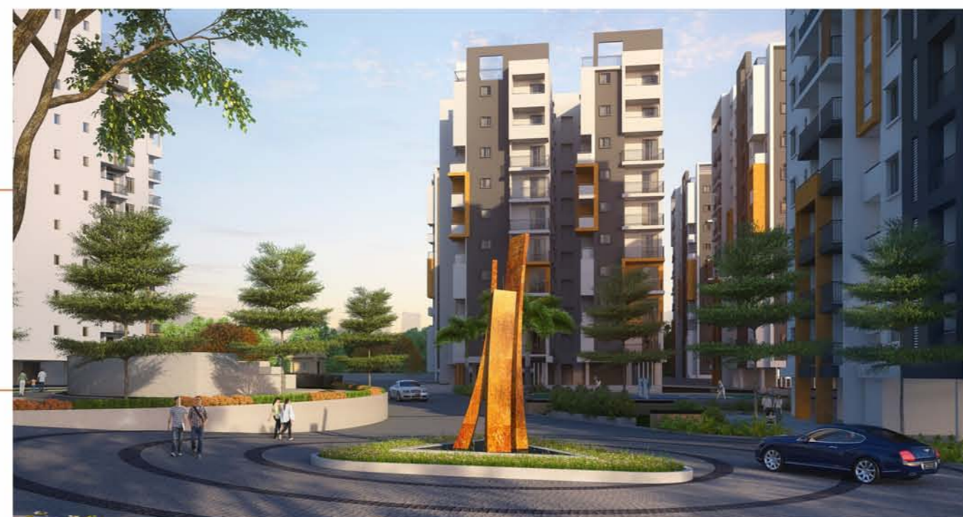
sculptured feature at arrival for warm welcome

REVEL IN THE SPLENDOUR OF YOUR SURROUNDINGS