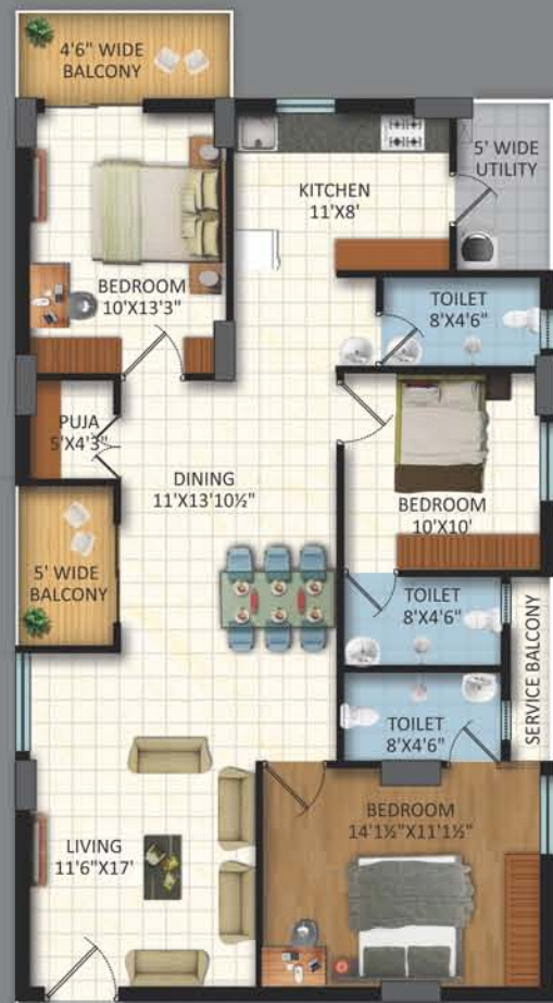
1 | 3BHK | 1655sft