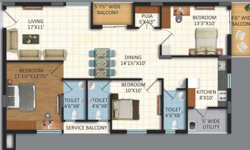
1 | 3BHK | 1580sft