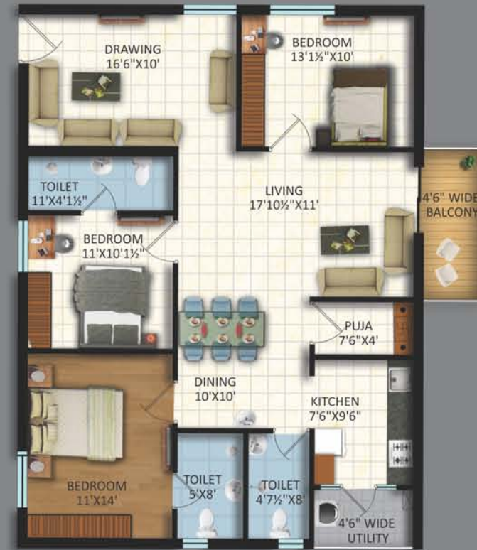
T-11, Flat-7 | 3BHK | 1650sft