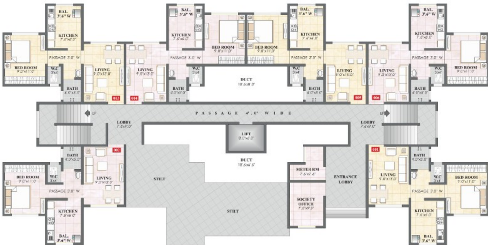
GROUND FLOOR PLAN WING-E