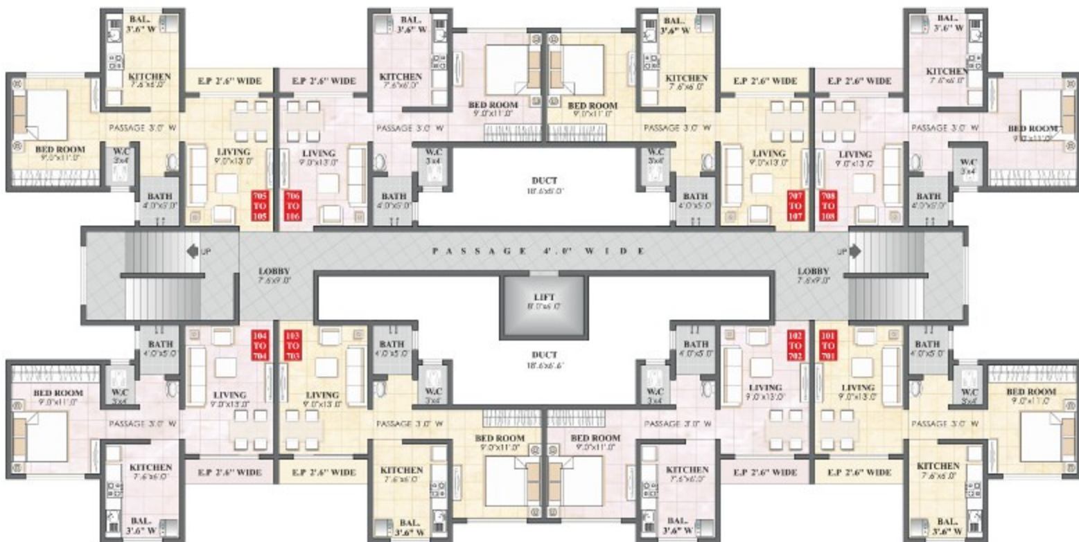
TYPICAL FLOOR PLAN (1ST TO 7TH. FL.) WING-8