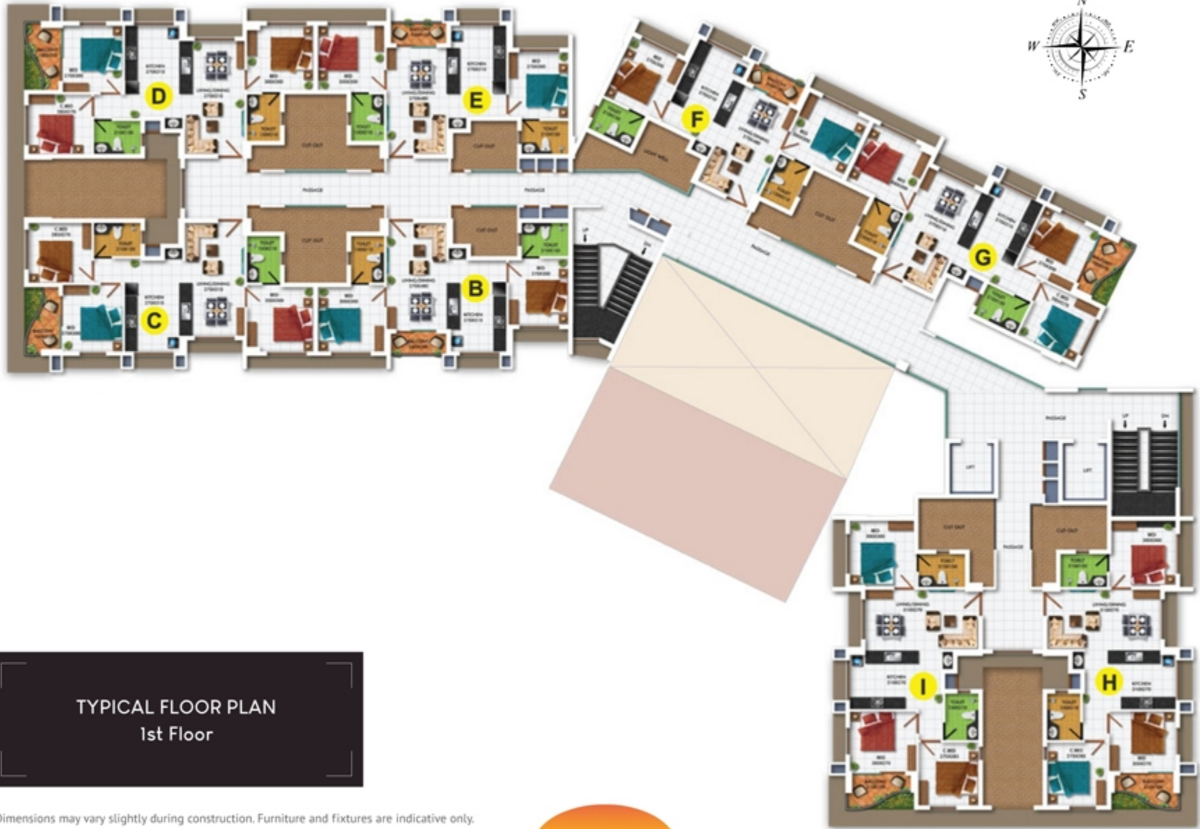
TYPICAL FLOOR PLAN 1st Floor

Dimensions may vary slightly during construction. Furniture and fixtures are indicative only. All dimensions are in centimetres. Plans and areas are subject to minor changes.