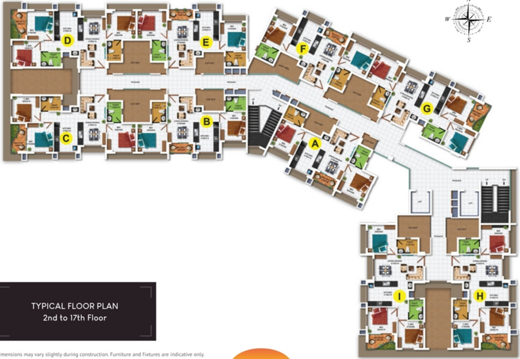
TYPICAL FLOOR PLAN 2nd to 17th Floor

Dimensions may vary slightly during construction. Furniture and fixtures are indicative only. All dimensions are in centimetres. Plans and areas are subject to minor changes.