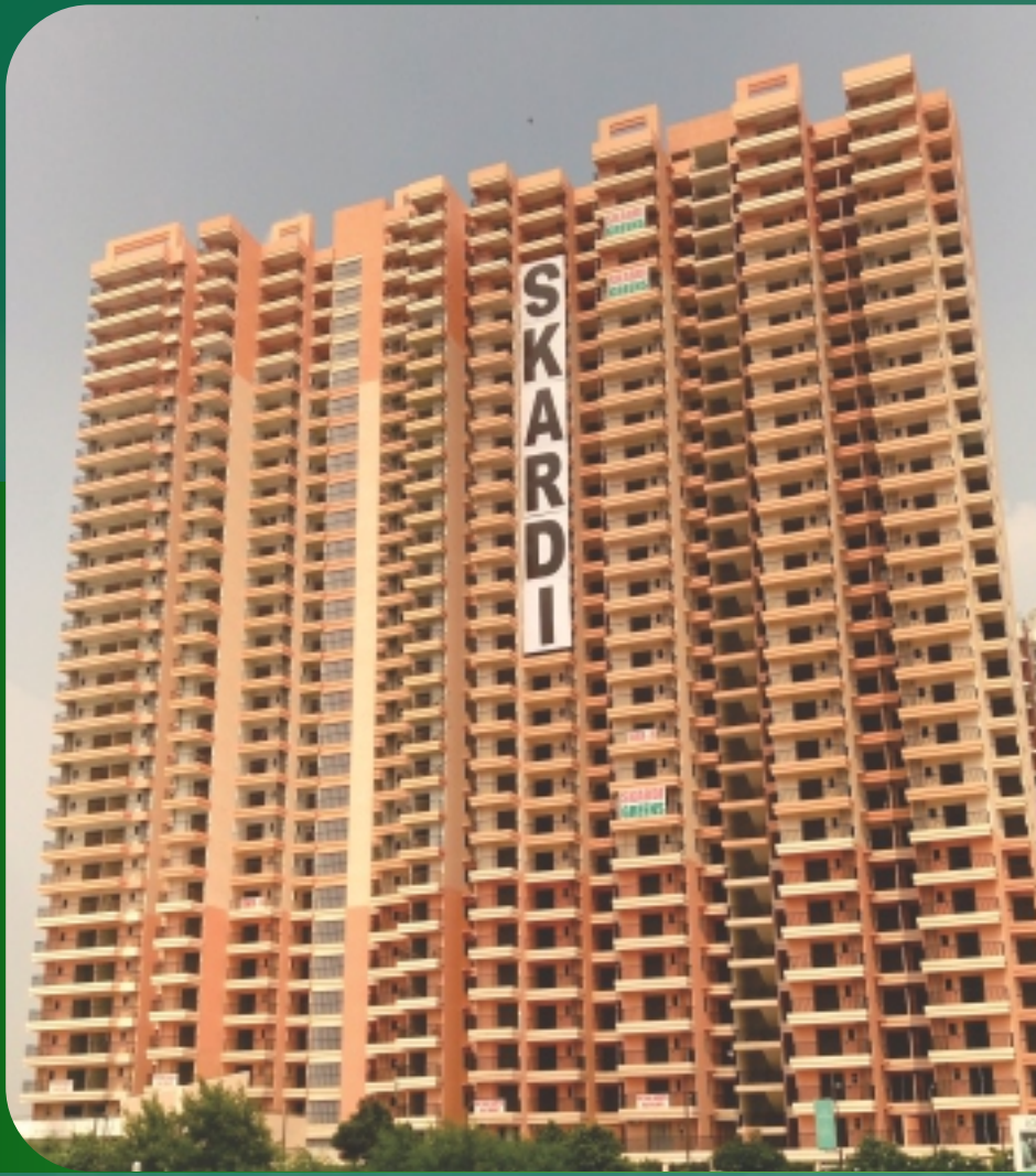
Actual photographs of our completed project