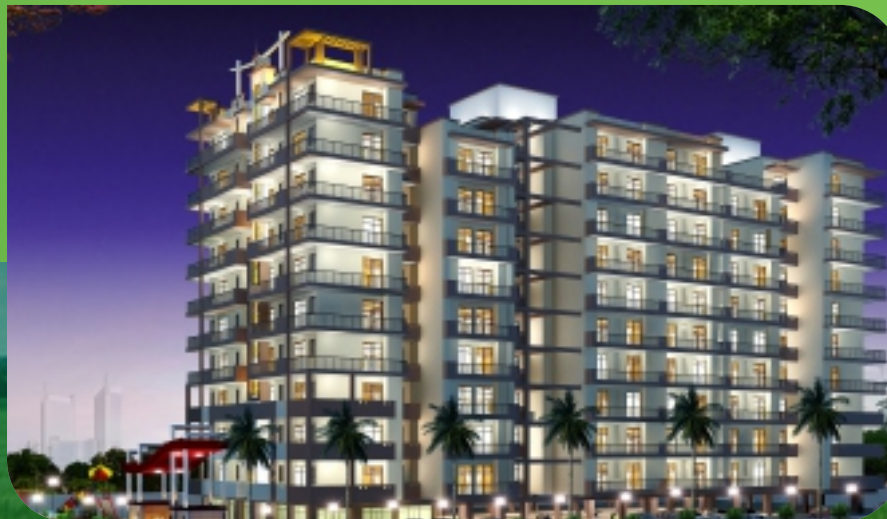
Photograph of Desire Residency Indirapuram