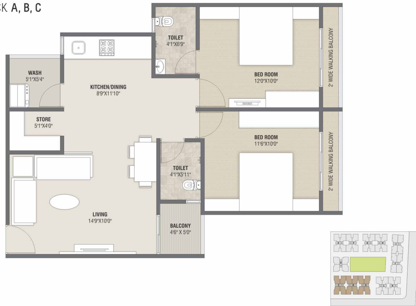
BLOCK A, B, C