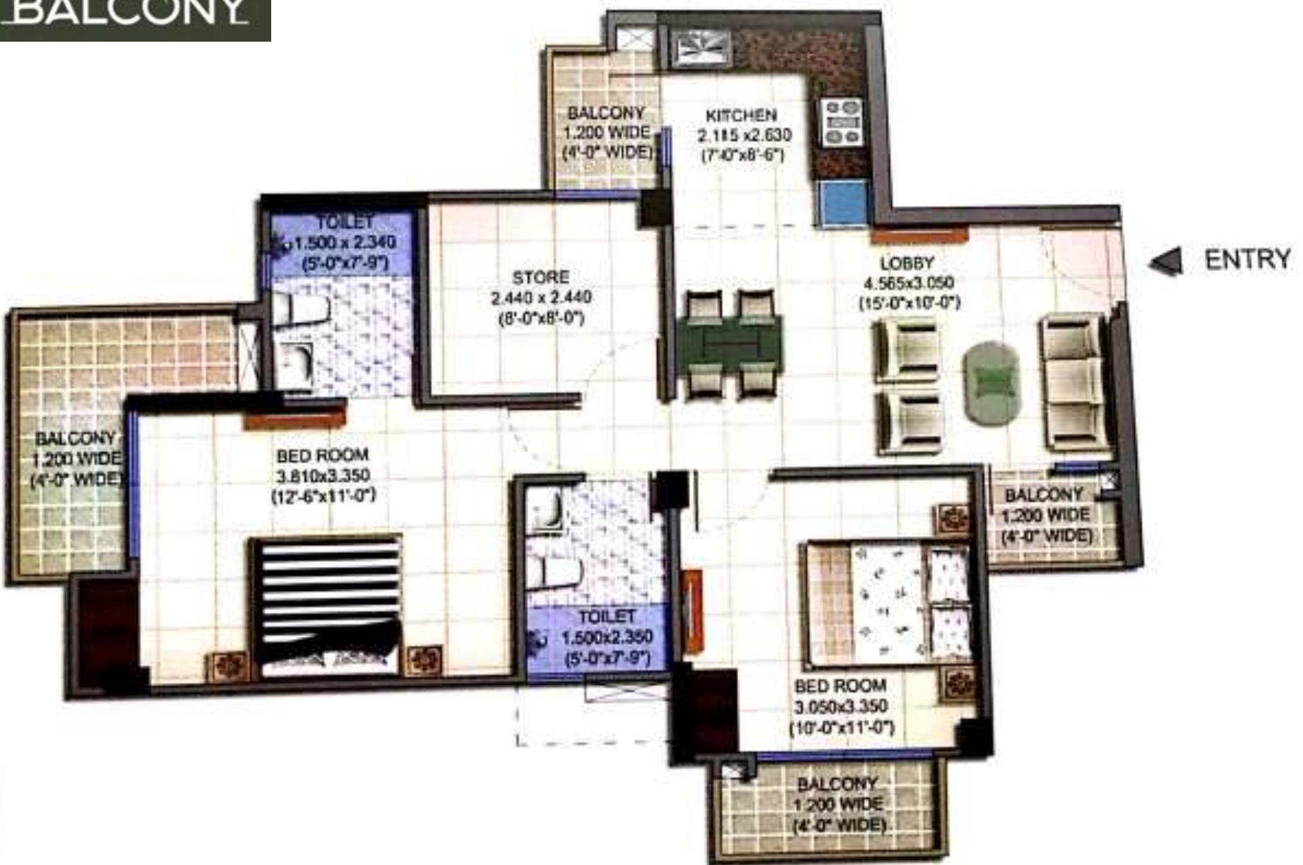
2BHK + 2T + SR (645 + 127 Sq.ft)