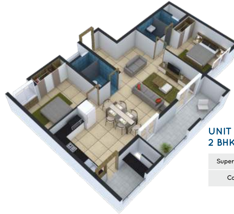
UNIT - A301 2 BHK - EAST FACING