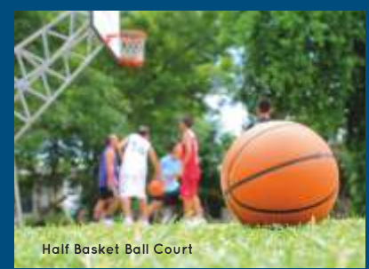
Half Basket Ball Court