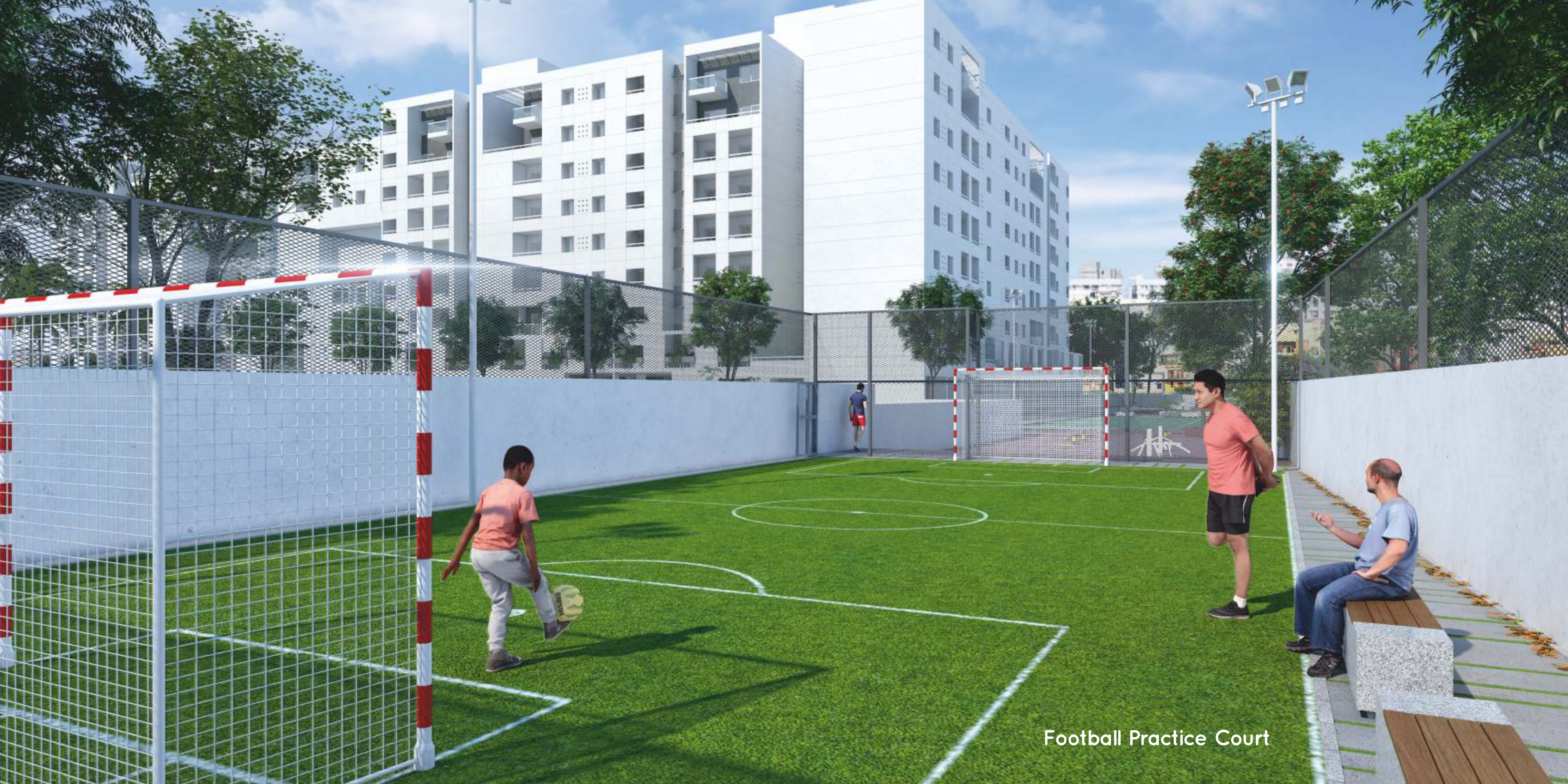
Football Practice Court