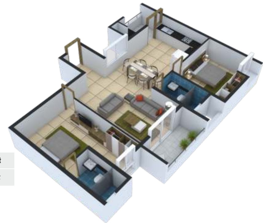
UNIT - A302 2 BHK - WEST FACING