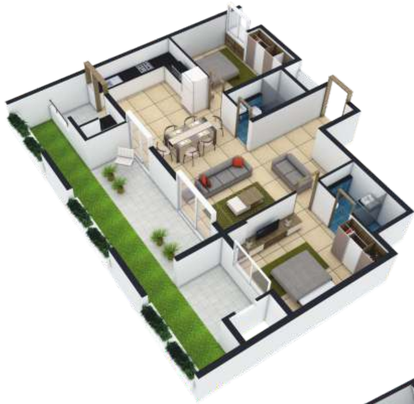
UNIT - A101 2 BHK - EAST FACING