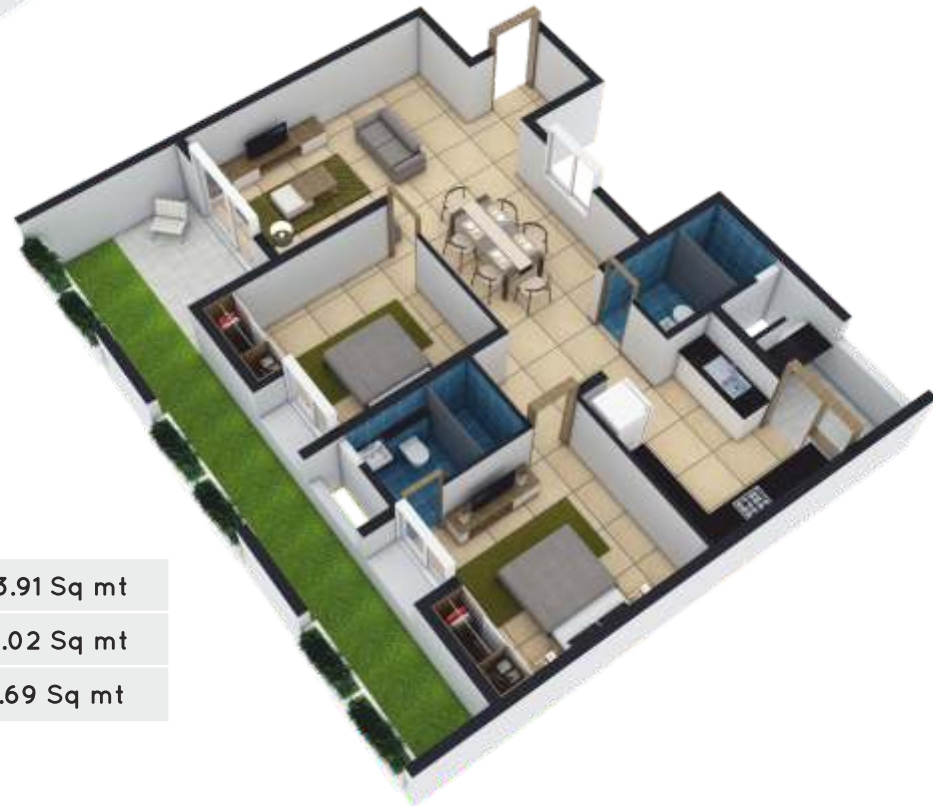
UNIT - A104 2 BHK - NORTH FACING