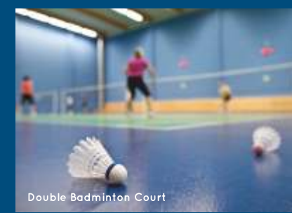
Double Badminton Court