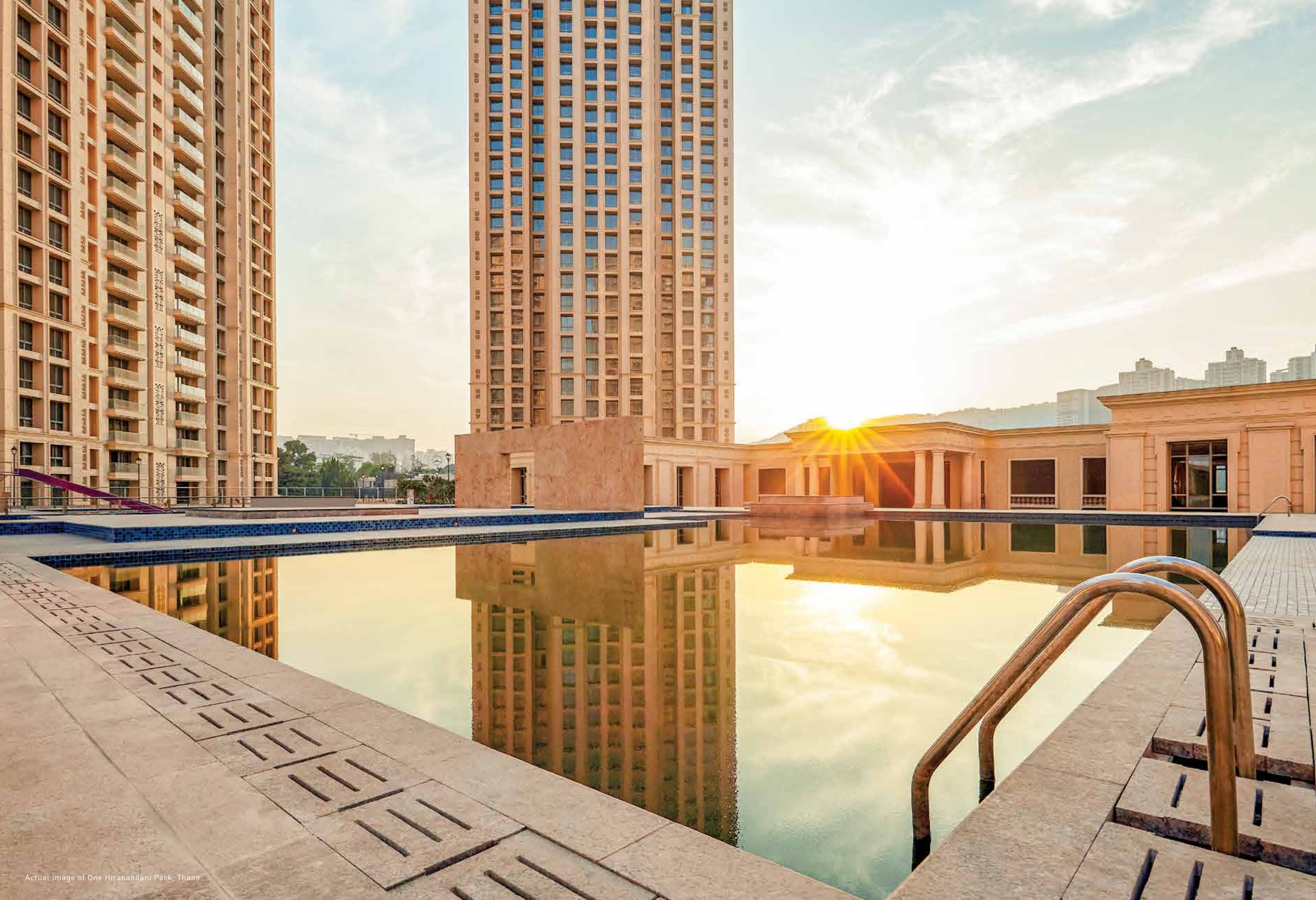
Actual image of One Hiranandani Park, Thane