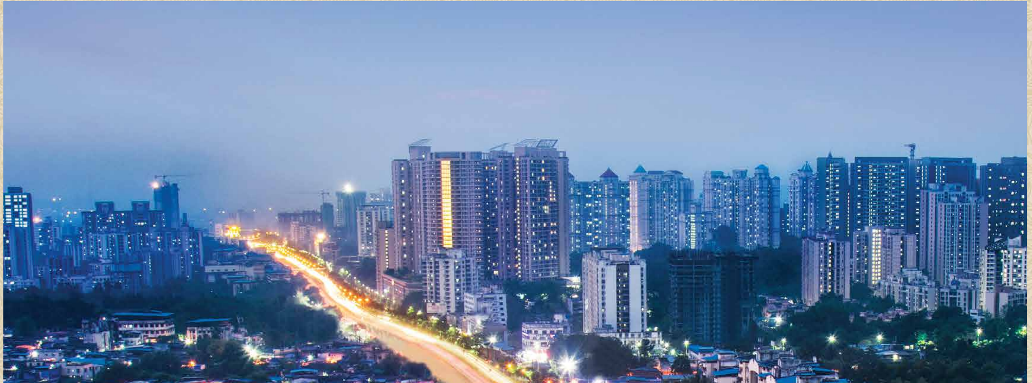
Actual image of Ghodbunder Road, Thane