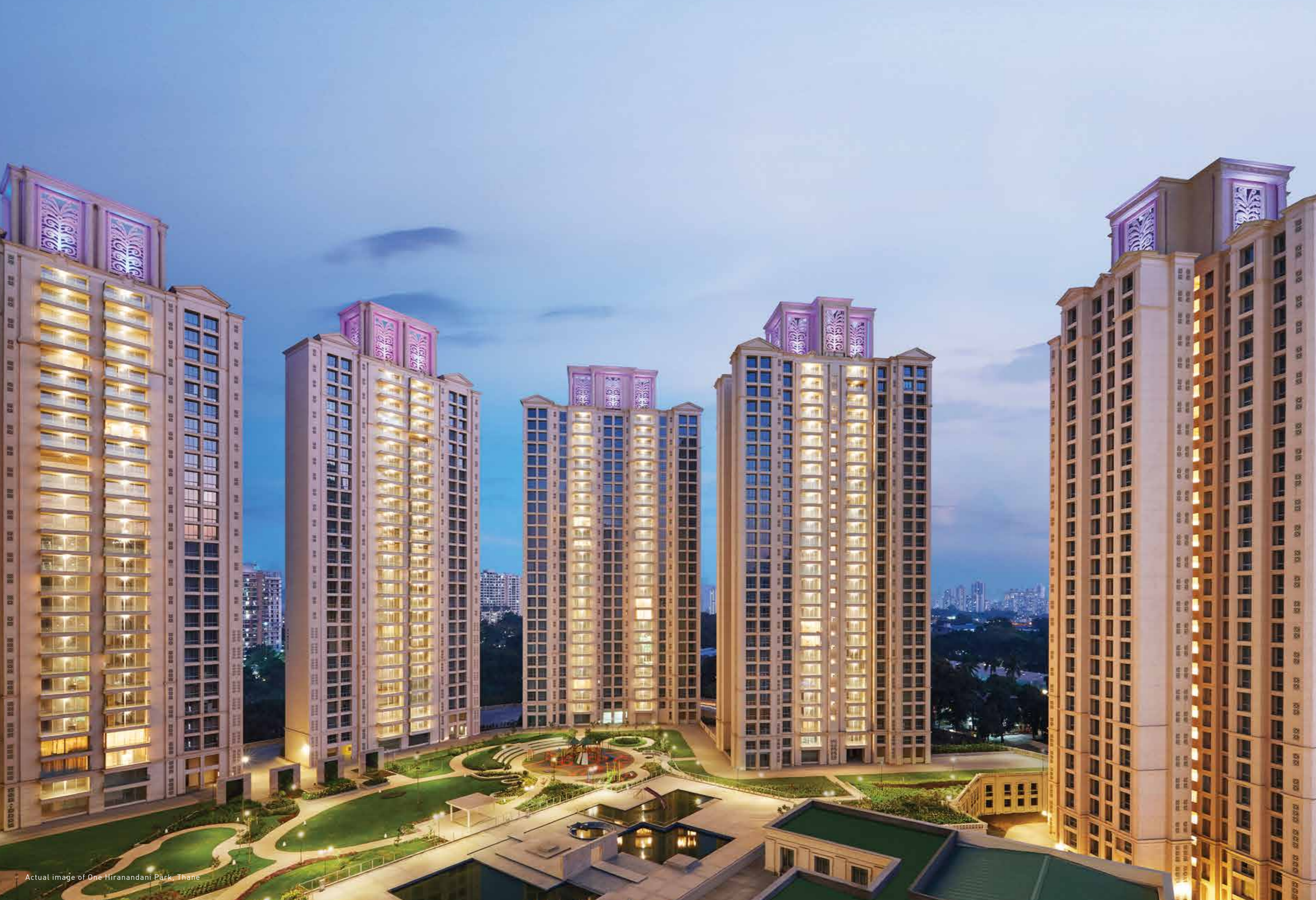
Actual image of One Hiranandani Park, Thane