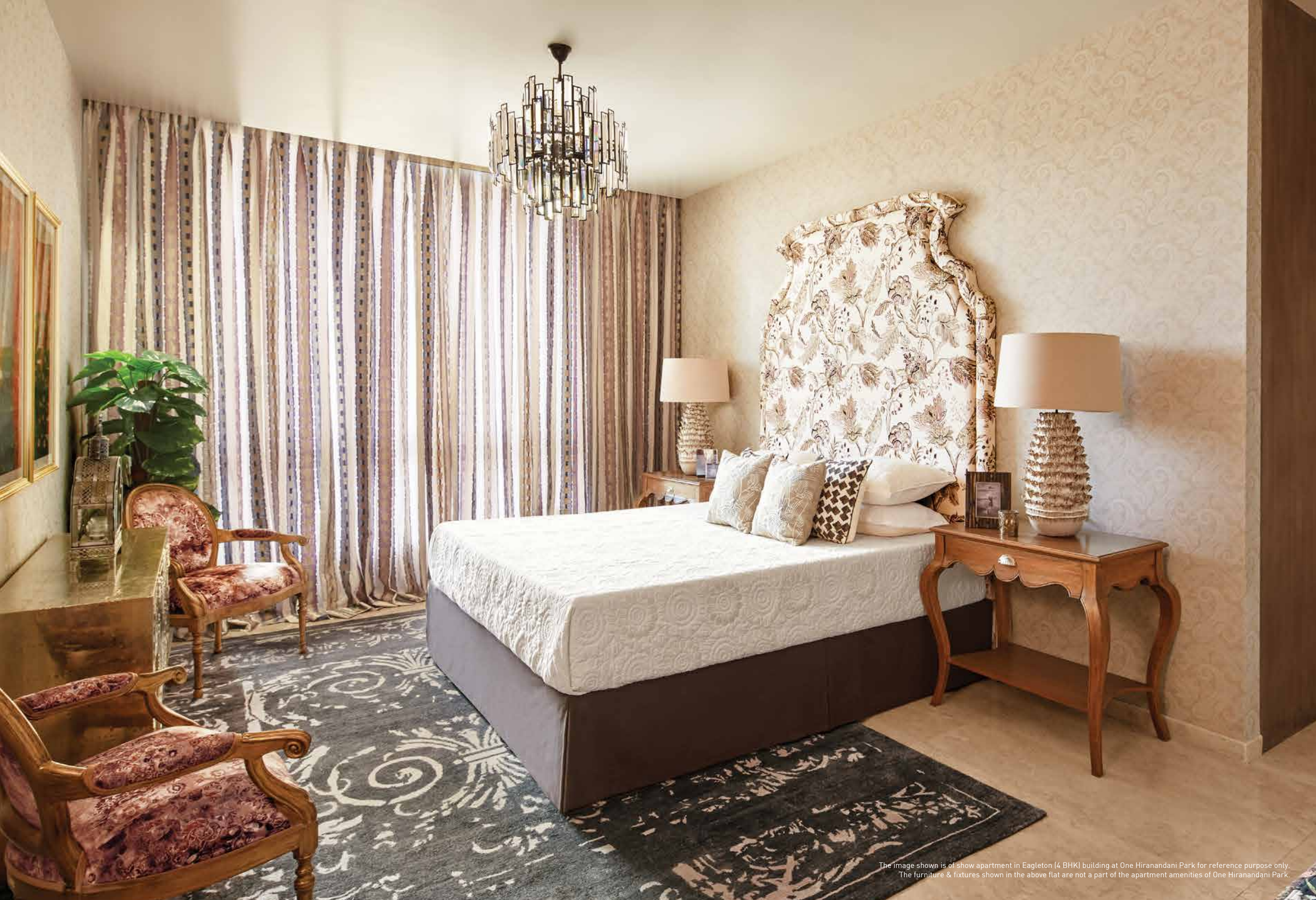
The image shown is of show apartment in Eagleton (4 BHK) building at One Hiranandani Park for reference purpose only. The furniture & fixtures shown in the above flat are not a part of the apartment amenities of One Hiranandani Park.