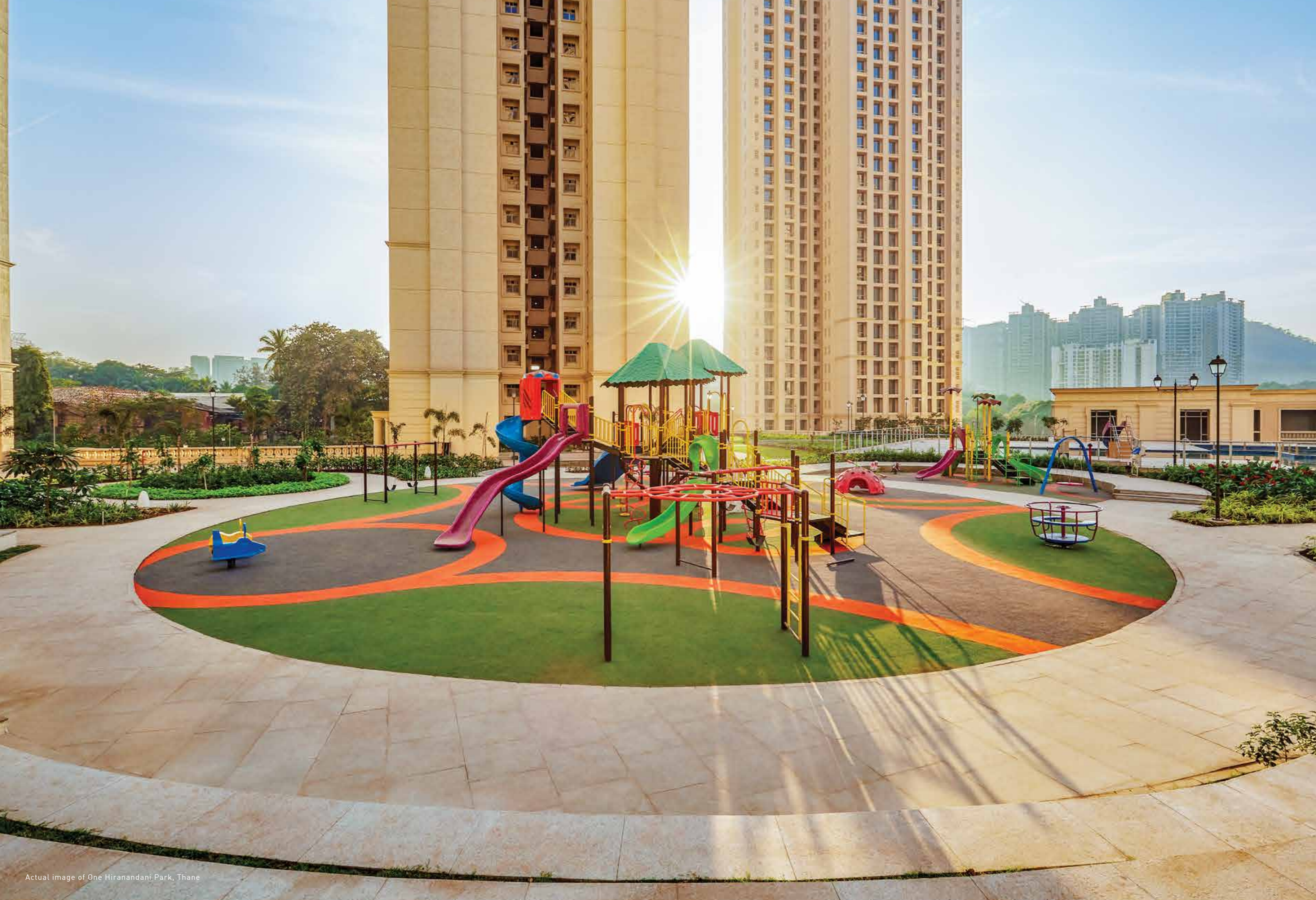
Actual image of One Hiranandani Park, Thane