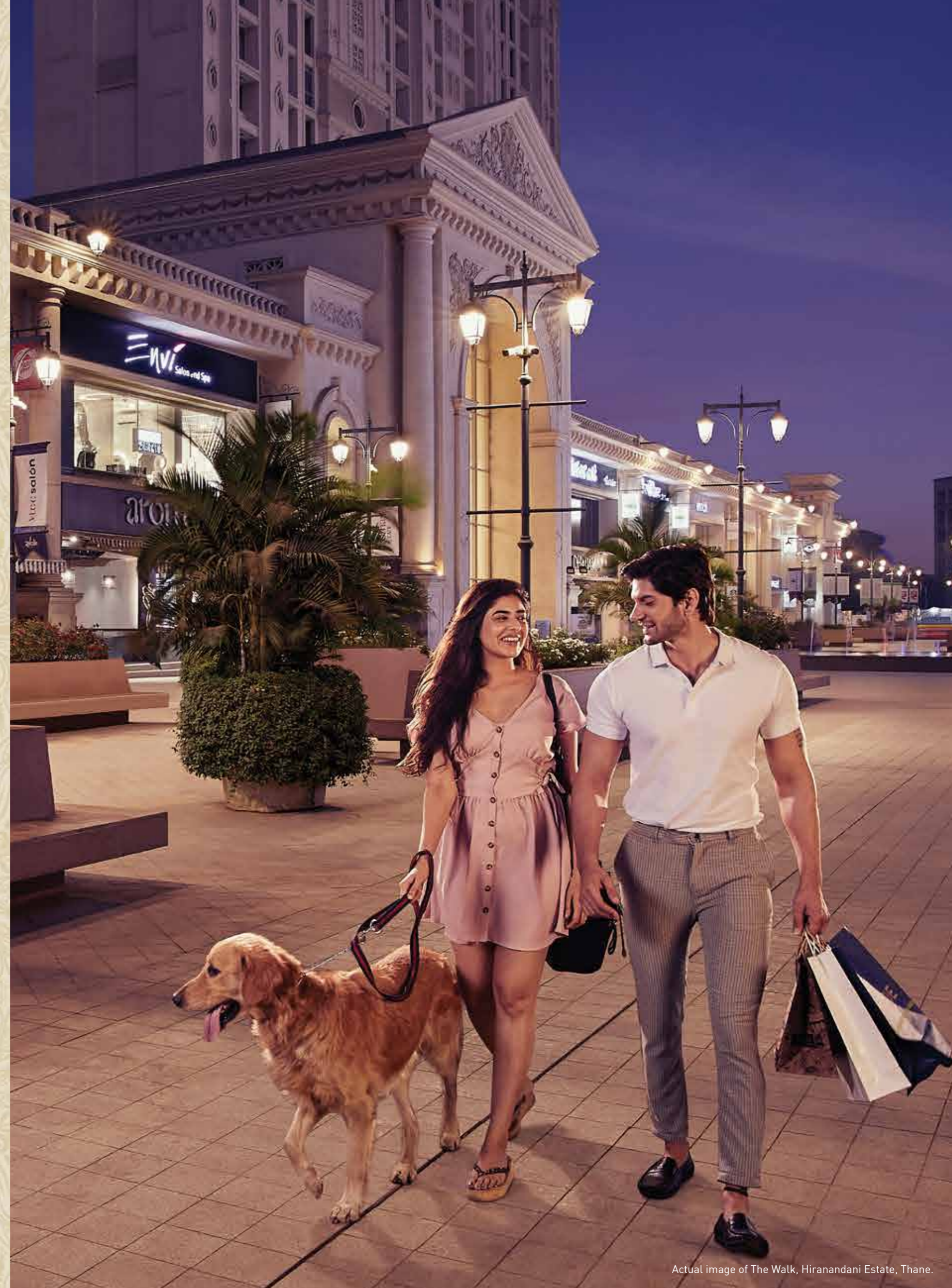
Actual image of The Walk, Hiranandani Estate, Thane.

A NEIGHBOURHOOD THAT LETS YOU SPLURGE AND INDULGE TO YOUR HEART'S CONTENT.