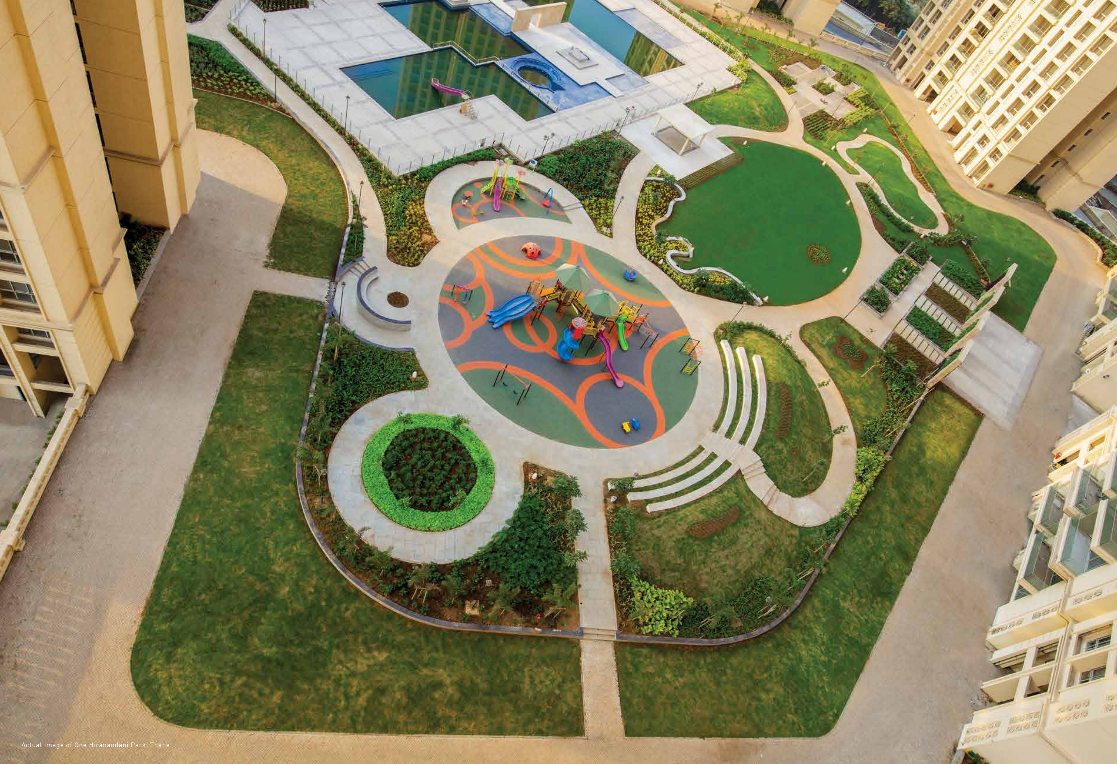
Actual image of One Hiranandani Park, Thane