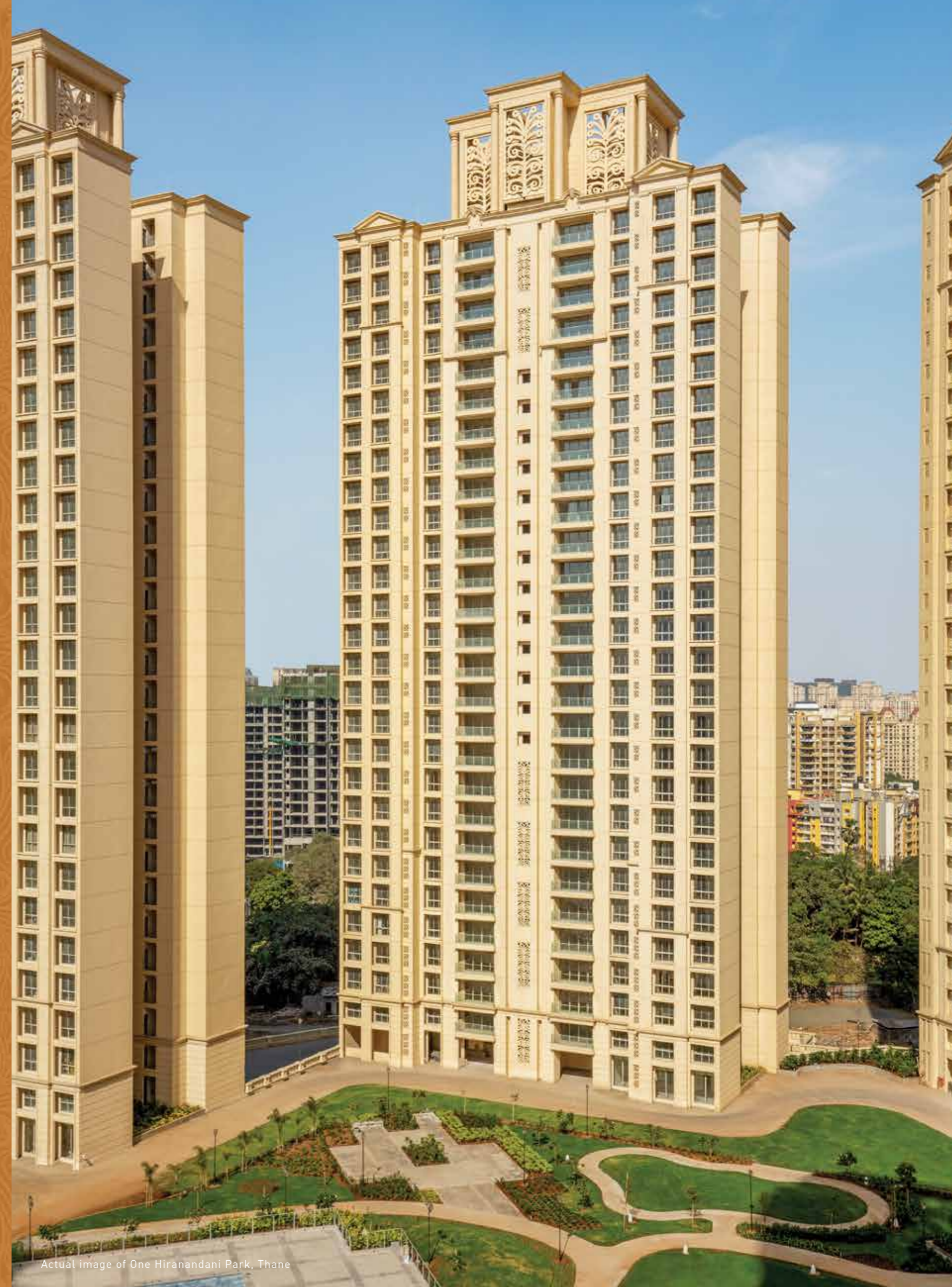
Actual image of One Hiranandani Park, Thane