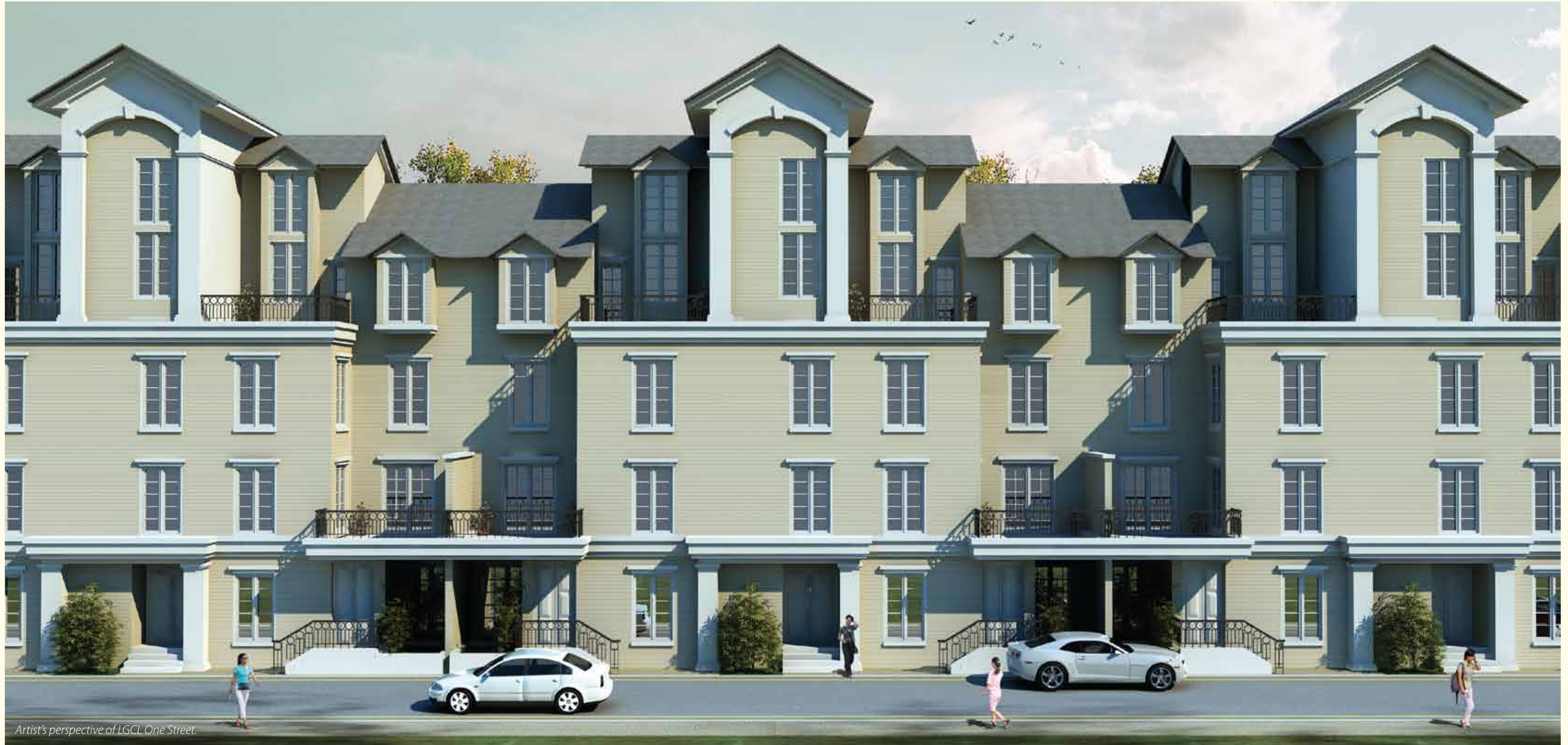
Artist's perspective of LGCL One Street.