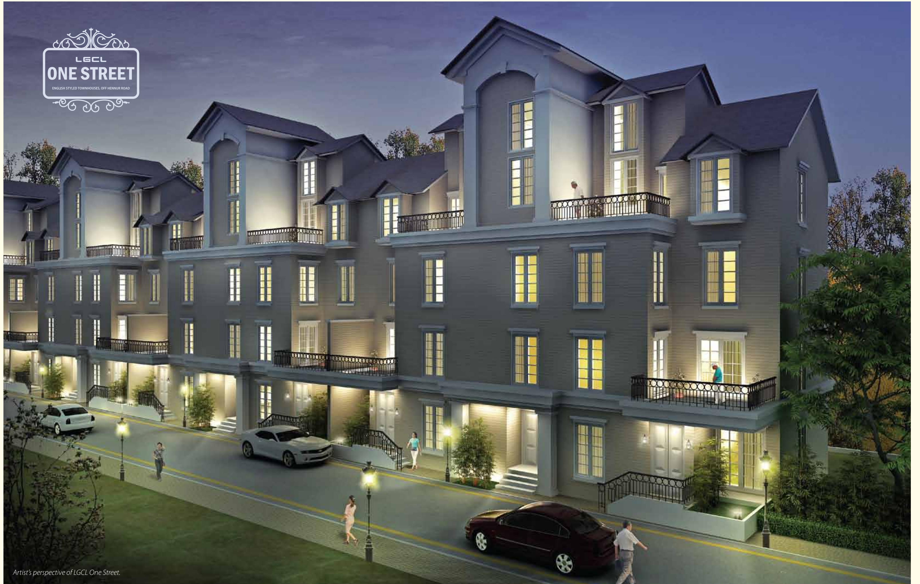
Artist's perspective of LGCL One Street.