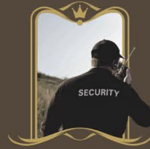
24 Hours security personnel