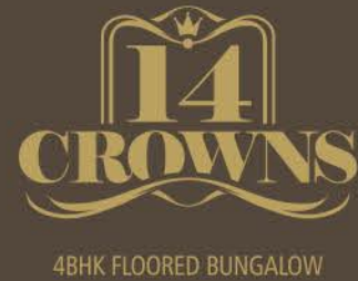
4BHK FLOORED BUNGALOW