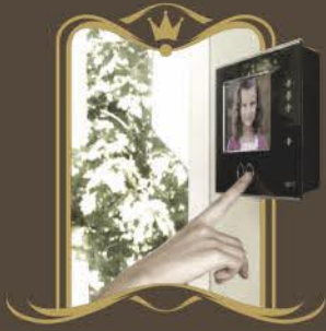
Digitally Enabled Video phone