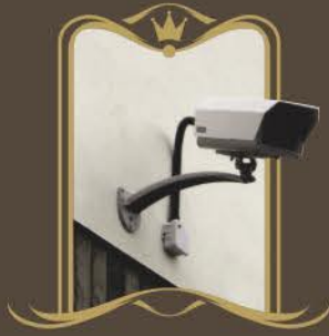
CCTV cameras in premises