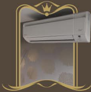
Centrally Air Conditioning VRV System