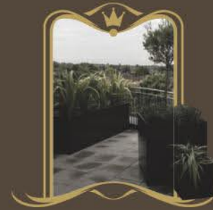
Planters in Periphery