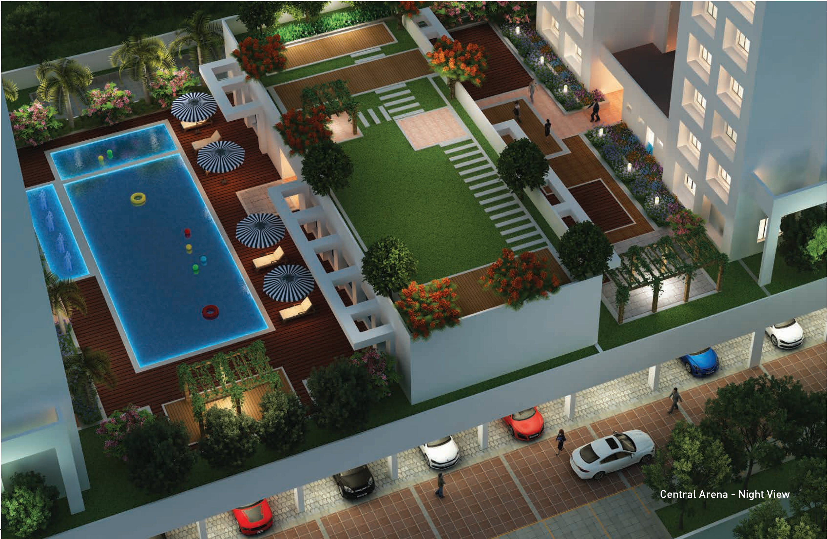
Central Arena - Night View