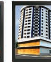
PLATINUM Rajaji Road