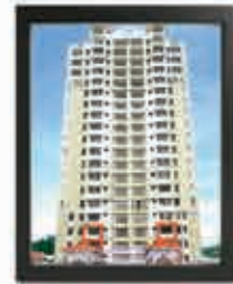
AMITY PARK Edappally