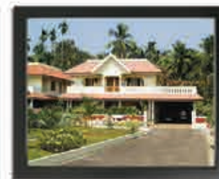
MEADOWS VILLAS Pavamani