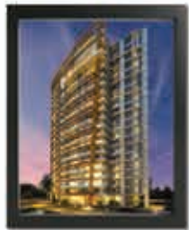
THE LEGEND Kaloor