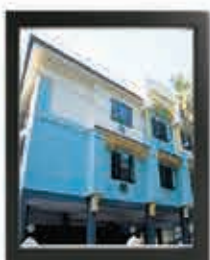
BLUE BELLS Joseph Road