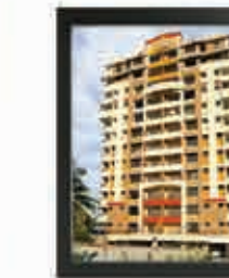
ZIRCON Panampilly Nagar