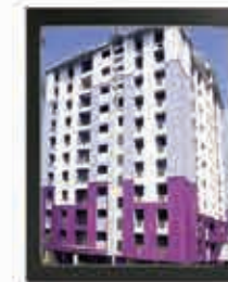
PALACE HEIGHTS Kottaram Road