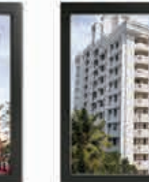
LEGACY Off Kacheripady