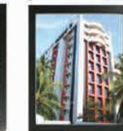
CANOPY Nadakkavu, Kannur Road