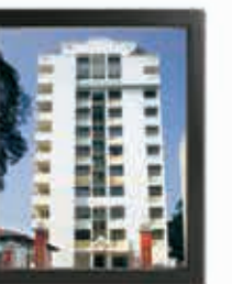
ELEGENZA Good Shepherd Rd