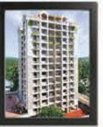
WILLOW HEIGHTS-2 Gosaikunnu