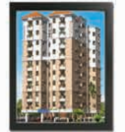
AVENUE CREST Avenue Road