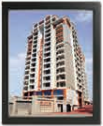
WILLOW HEIGHTS-1 Gosaikunnu