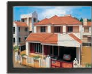
PALM SPRING VILLAS II Kanjikuzhy