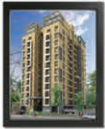
INFINITY Mundupalam Jn.