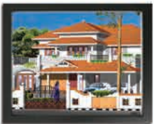
ORION VILLAS NH-17, Edappally