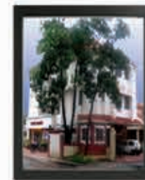
IVORY COUNTY APARTMENTS Mundupalam