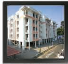
ORCHID II Kanjikuzhy