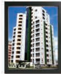
EMERALD Panampilly Nagar