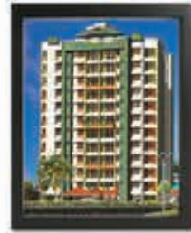
GLENWOODS Near Metropolitan Hospital