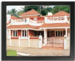
GREEN WOODS Kakkanad