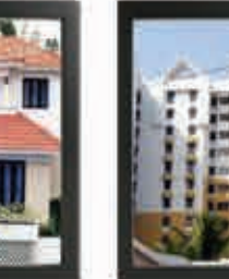
SILVER OAK Kadavanthra