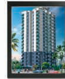
GARLAND Near Bishop's Palace