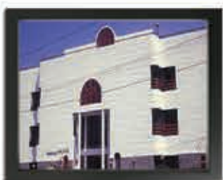
MANSION Gandhi Nagar