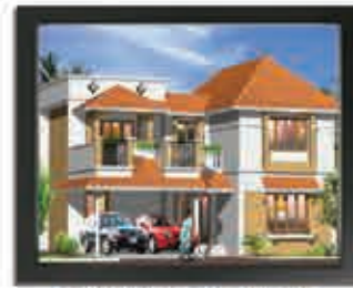
PALM MEADOWS VILLAS Kanjikuzhy