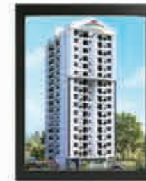
TOWNSCAPE Nr. Cross Jn.