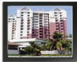
OAKWOOD Jawahar Nagar