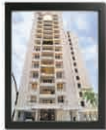
OPAL ARCH Kaloor