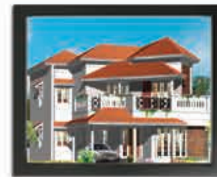
RIVER VALLEY VILLAS Erayil Kadavu