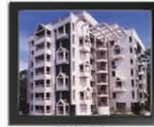
PARK DALE Sasthri Road