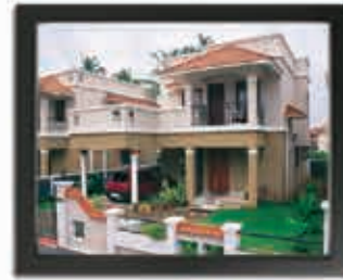
HERITAGE EXTENSION-VILLAS Mundupalam