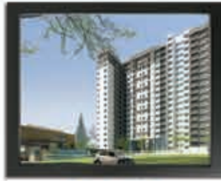
THE EDGE Thiruvalla