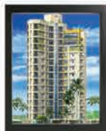
ONYX Near English Church, Nedakkavu