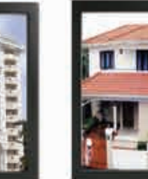
CRYSTAL WATERS-II Vaduthala