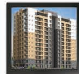
GARNET Off Mavoor Road