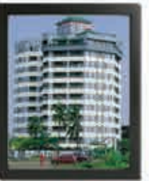
BELAIR Panampilly Nagar