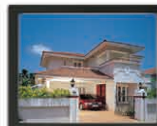
AUTUMN WOODS Kadavanthra