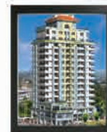
BAYWATERS Beach Road