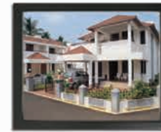
EBONY WOODS Vyttila