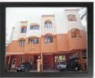
SONATA Off Mavoor Road