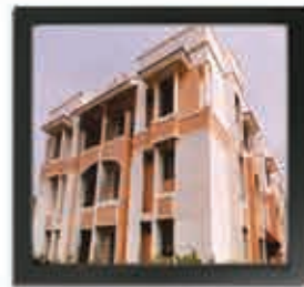
ORCHID-1 APARTMENTS Kanjikuzhy