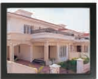
ELYSIUM GARDEN Kaloor