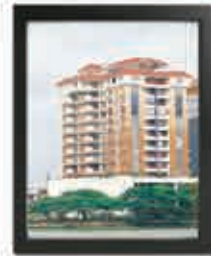
TRITON Marine Drive