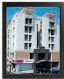
CITADEL K.K. Road