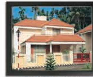
PALM SPRING VILLAS-1 Kanjikuzhy