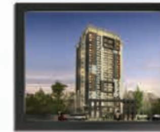
CEDAR PARK Vattiyookavu