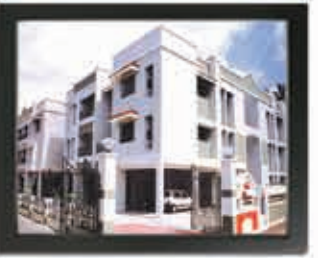
BLOSSOM APARTMENTS Sakthan Thampuran Nagar