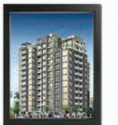
ALTON HEIGHTS Kottayam