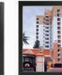
TEMPLETON Ernakulam South