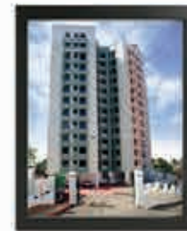
TOWN SQUARE Near Malayala Manorama