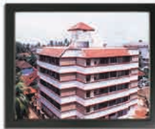
MARINE GATE Near Corporation Office