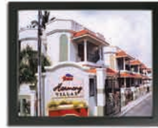
HARMONY - VILLAS Sakthan Thampuran Nagar