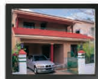
SPRING FIELD Palarivattom