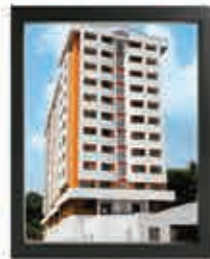
MONTECARLO K.K. Road