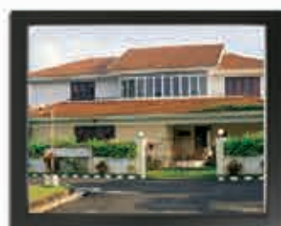
CRYSTAL WATERS-1 Vaduthala