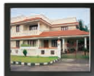
QUEEN'S PARK Keerthi Nagar