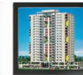
HILLVIEW K K Road