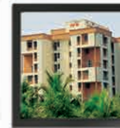
HILLS DALE Rajiv Nagar