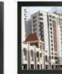
ORION-II NH-17, Edappally