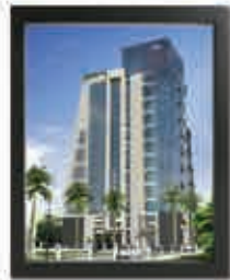
SKYLINE TOWER Palarivattom