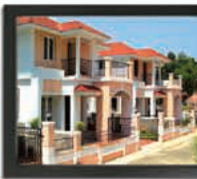
ORCHID VILLAS Kanjikuzhy