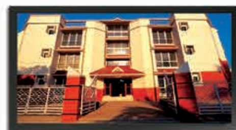
ROSE MOUNT APARTMENTS Kadavanthra