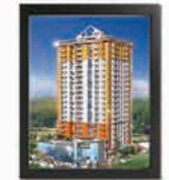
DOMAIN Near Technopark