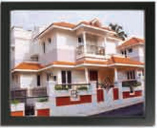
IRIS-GARDEN VILLAS Avenue Road