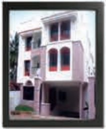
BLOOMDALE Mission Quarters