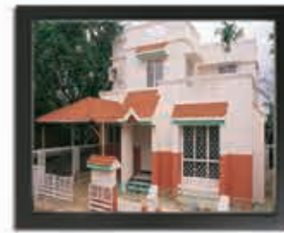
ROSE MOUNT VILLAS Cochin