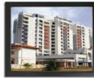
ORION-I NH-17, Edappally