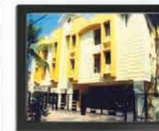
LITTLE HEARTS Off Mavoor Road