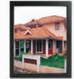
IVORY COUNTY VILLAS Mundupalam