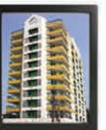
SEAWIND Beach Road