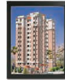
GRAND-COURT Nr St Thomas College