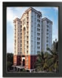
MARBLE ARCH Kaloor