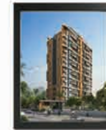
CAMPUS HEIGHTS Trivandrum