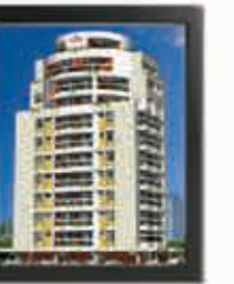
ROYALE Panampilly Nagar