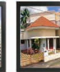
GREEN VALLEY Kakkanad