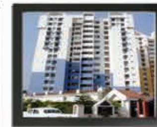
PINEWOOD Jawahar Nagar