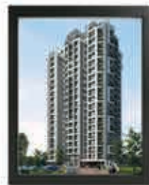
CRESCENDO Off NH Bypass, Calicut