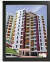
BRENTWOODS Near Metropolitan Hospital