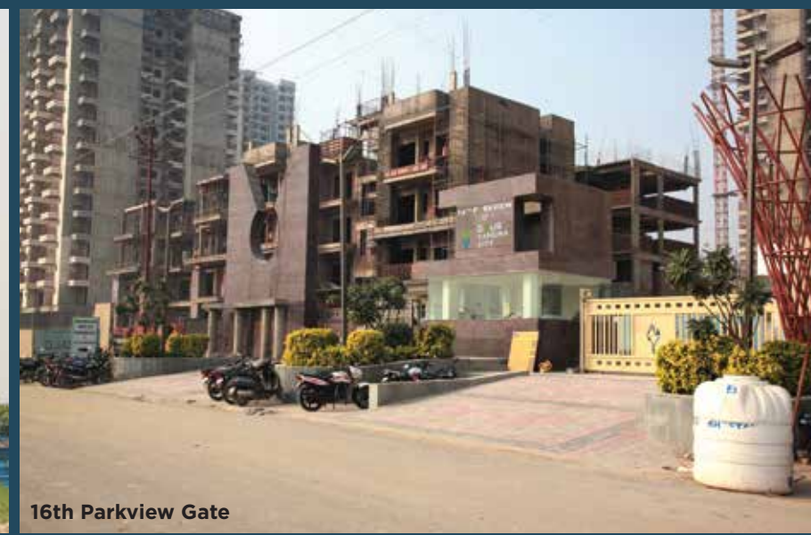
16th Parkview Gate