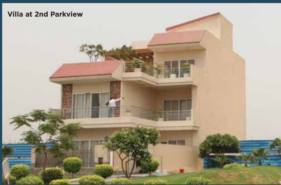
Villa at 2nd Parkview