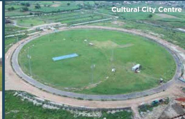
Cultural City Centre