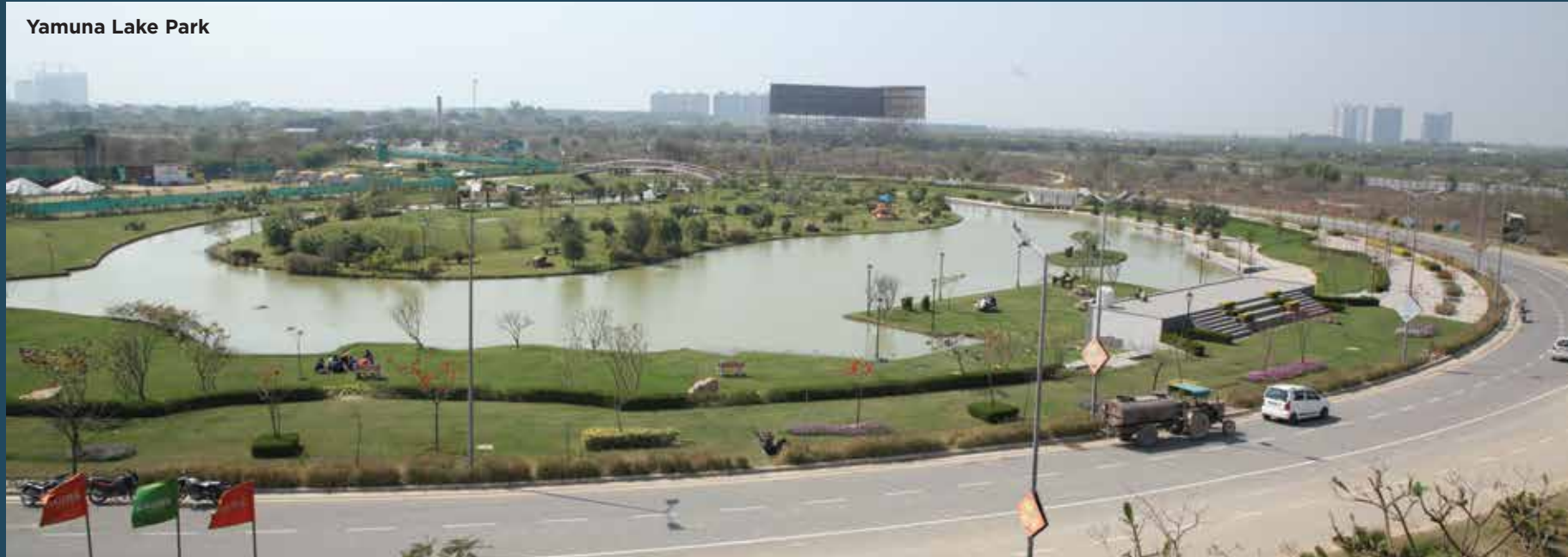
Yamuna Lake Park