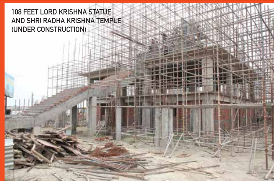
108 FEET LORD KRISHNA STATUE AND SHRI RADHA KRISHNA TEMPLE (UNDER CONSTRUCTION)

Gaur Yamuna City offers Plots, Apartments, Retail Shops, Studio Apartments, Themed Villas, Sports and a lot more.