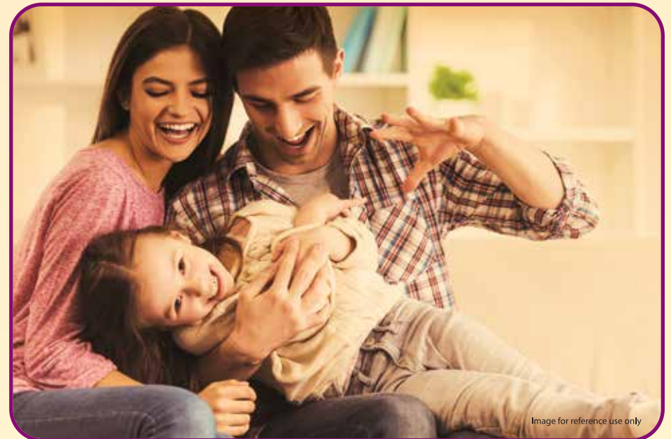
Image for reference use only

Kalyan is an upcoming smart city, developing at an aggressive pace. Once known as an industrial hub, it is fast proving to be a conducive environment for premium residential projects. A lot of it can be attributed to its proximity to Mumbai (via highway and railroads), Nashik and Pune. Kalyan encompasses major industrial units including Century Rayon, various fast-food and fine-dining avenues, retail and entertainment options like PVR and Metro Junction Mall, and is home to leading hospitals like Fortis, Kalyan Metro and Century Rayon Hospital. Several prestigious educational institutes such as B.K. Birla College of Arts, Science & Commerce, B. K. Birla Public School, Podar International School and Cambridge International School make it an ideal location for families.