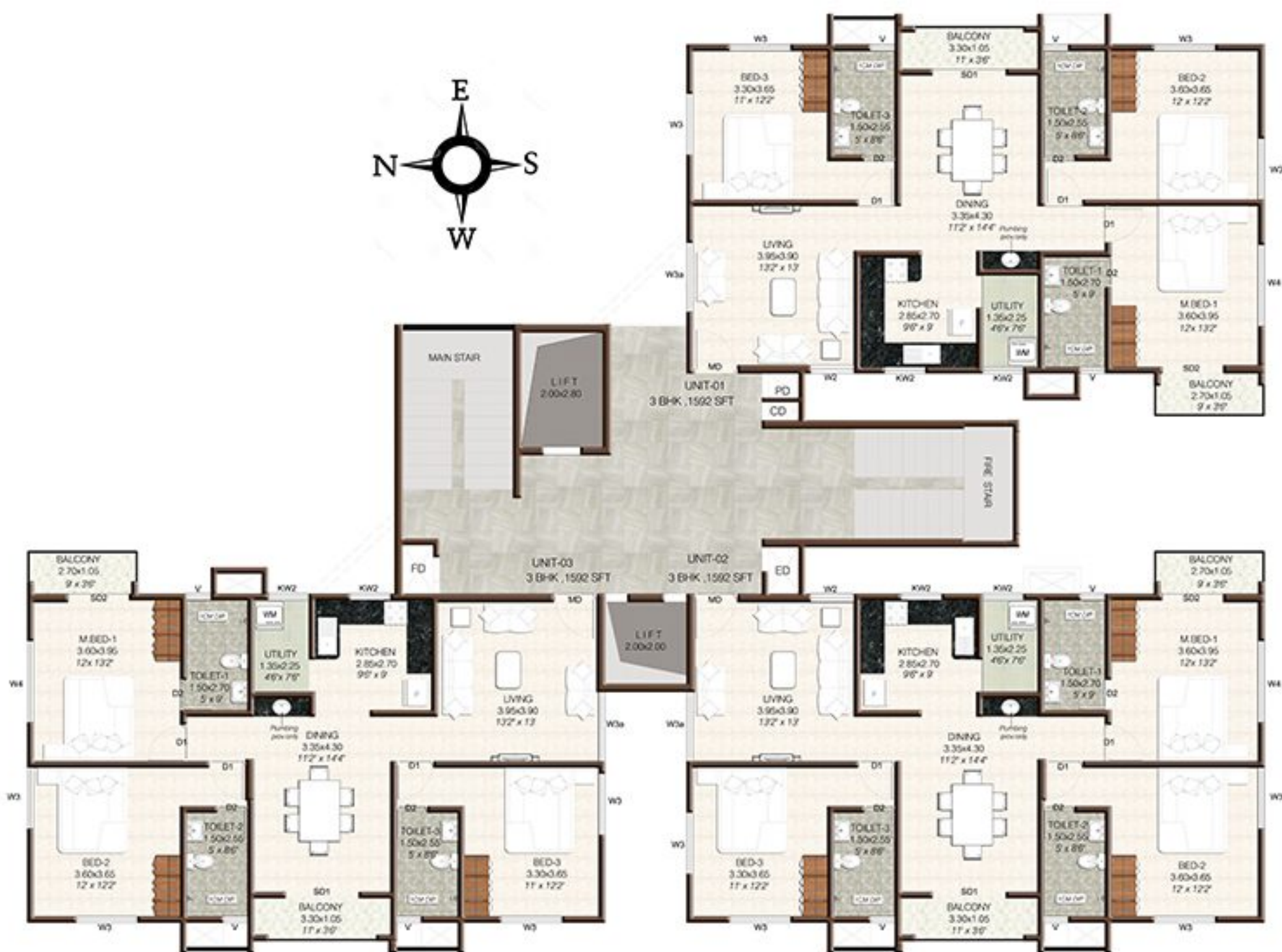
TYPICAL FLOOR PLAN (1ST TO 13 TH)