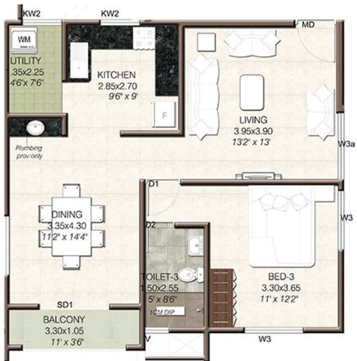
1 BHK , SBA- 969 SFT