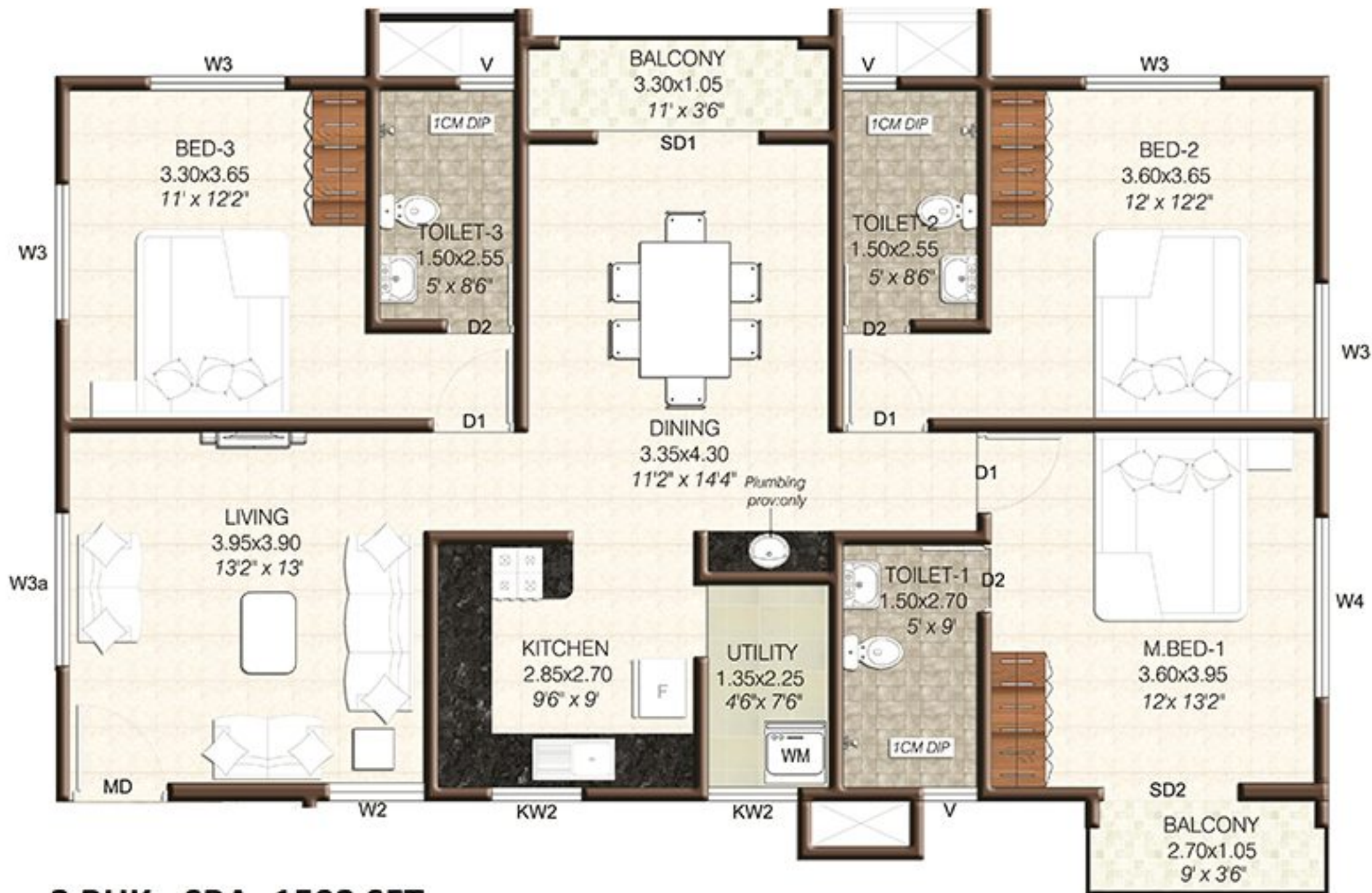
3 BHK - SBA- 1592 SFT