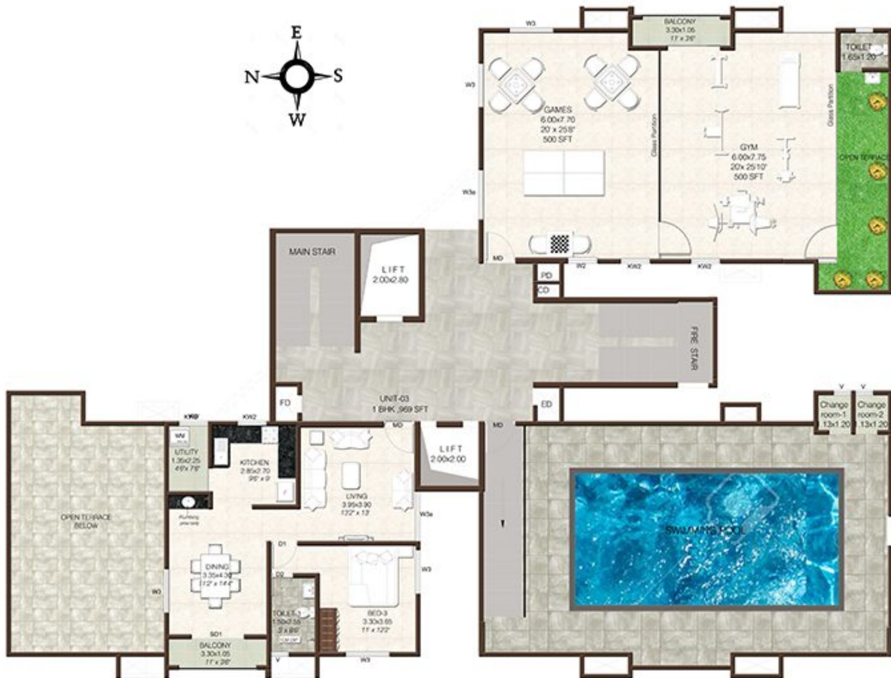
15 th FLOOR PLAN