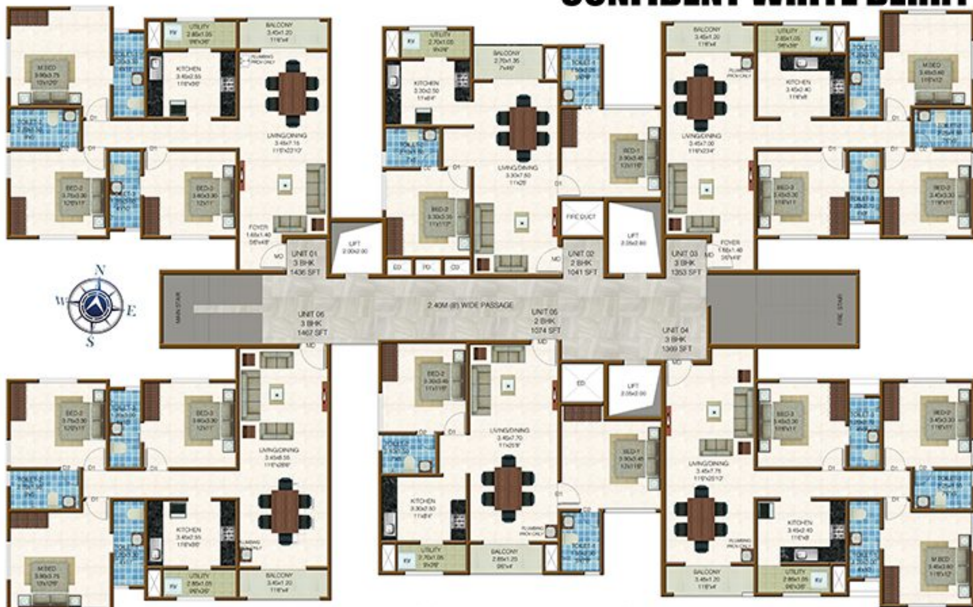
TYPICAL FLOOR PLAN (1 st TO 14th)