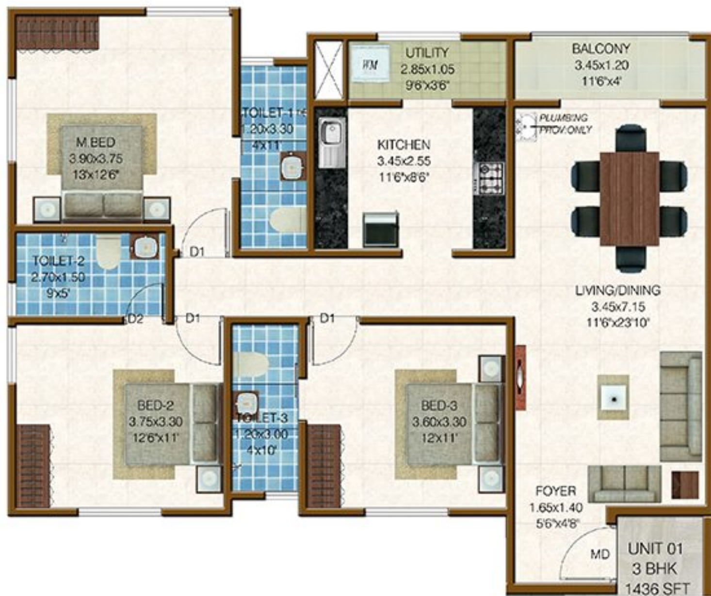
3 BHK , UNIT 01,03,04,06 SBA - 1436 ST