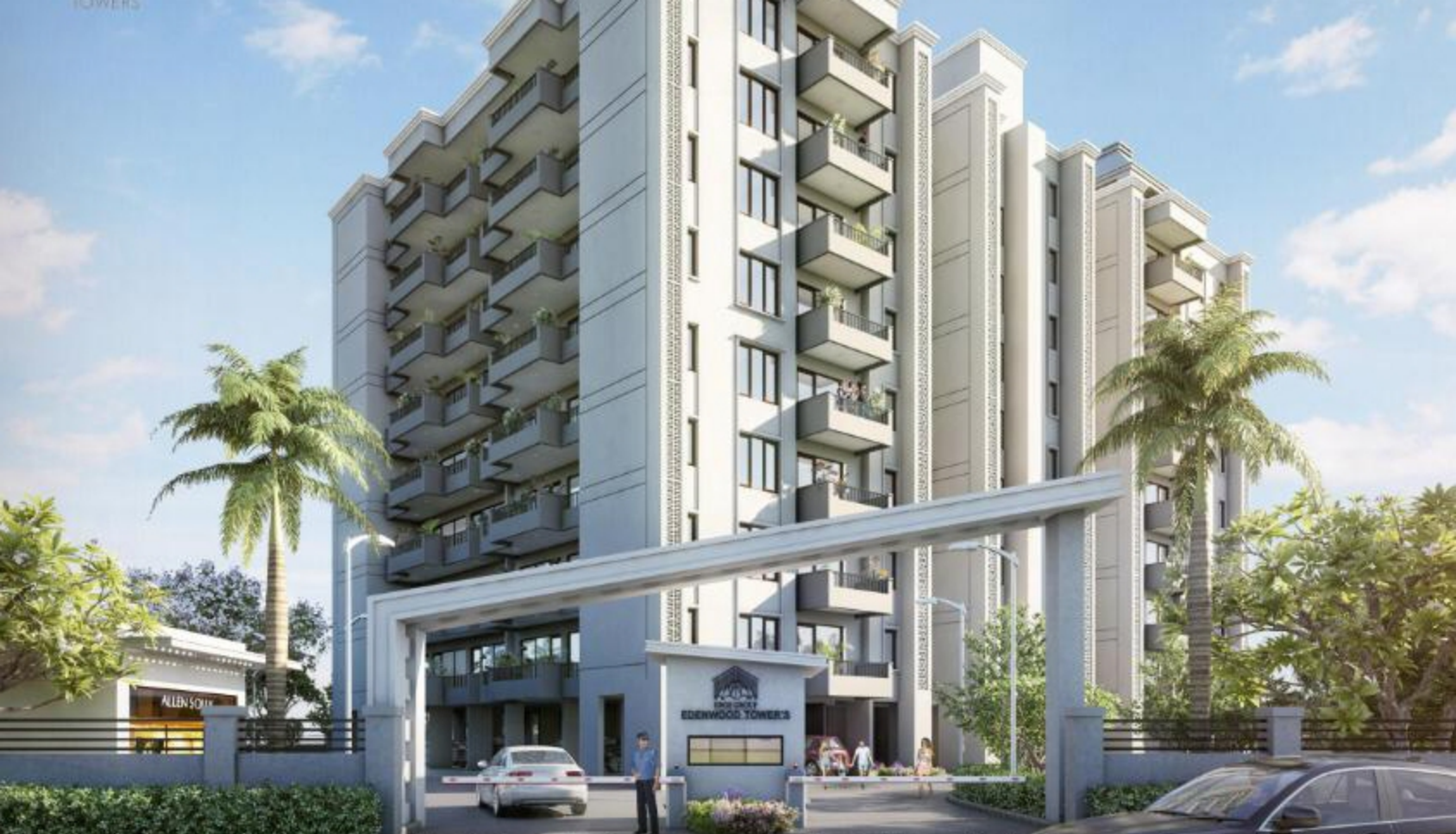
Rendered/Artistic impression of under construction Edenwood towers. Kindly refer specifications sheet for the deliverables.