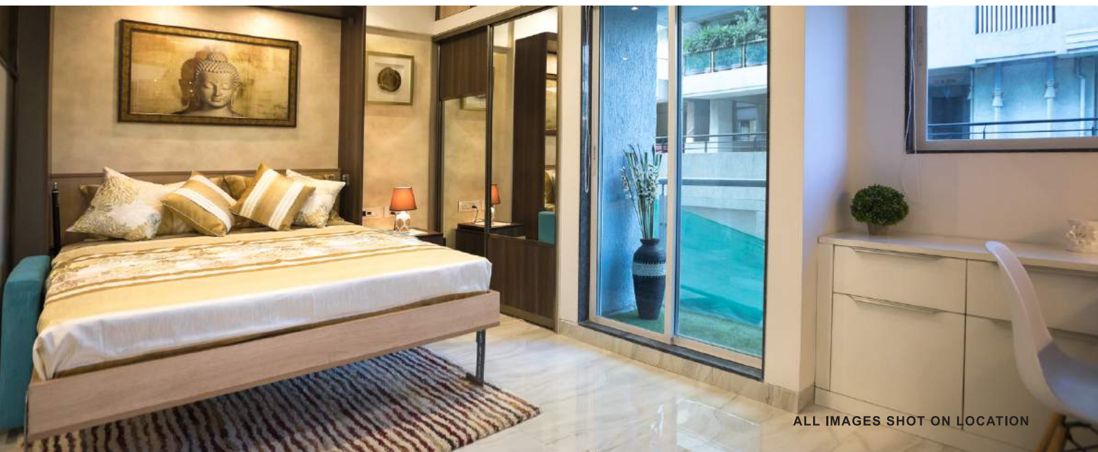
ALL IMAGES SHOT ON LOCATION