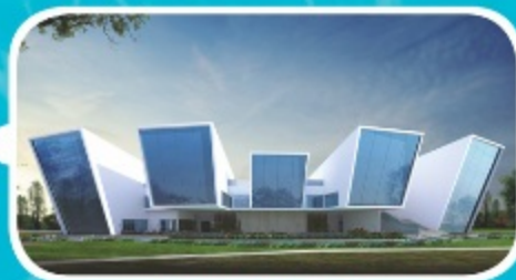
Club House - Lake Facing View