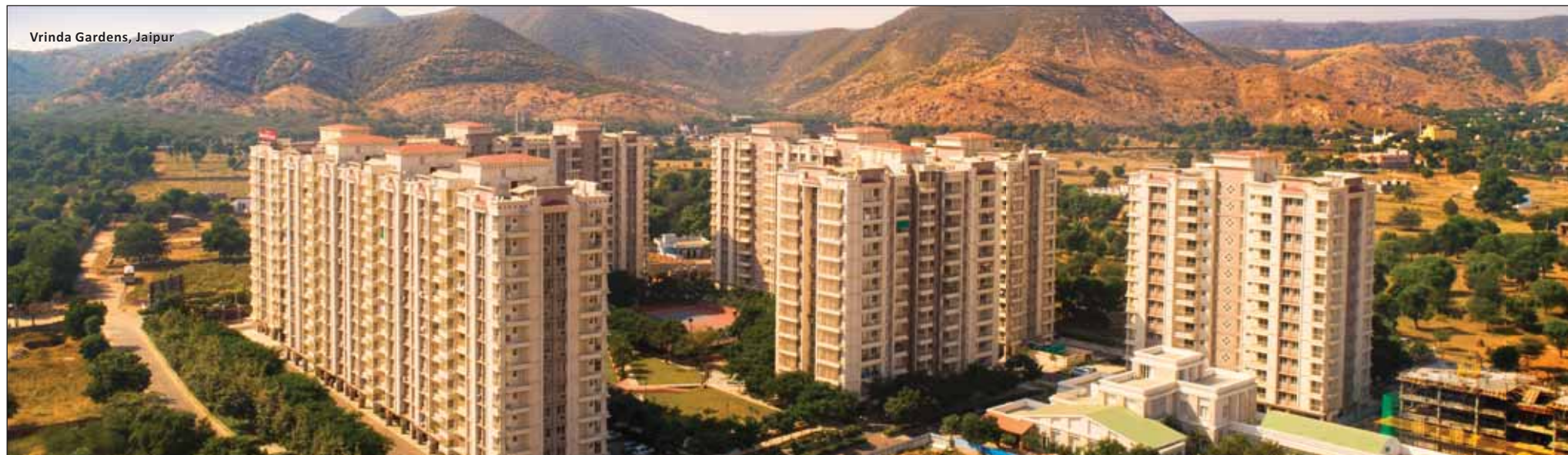
Vrinda Gardens, Jaipur