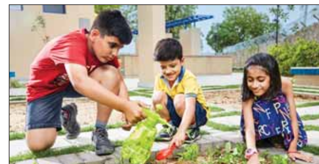
Kid Centric Homes