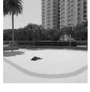
Kid's play area