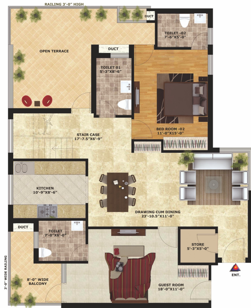
PENT HOUSE SUPER AREA -2924 SQ.FT