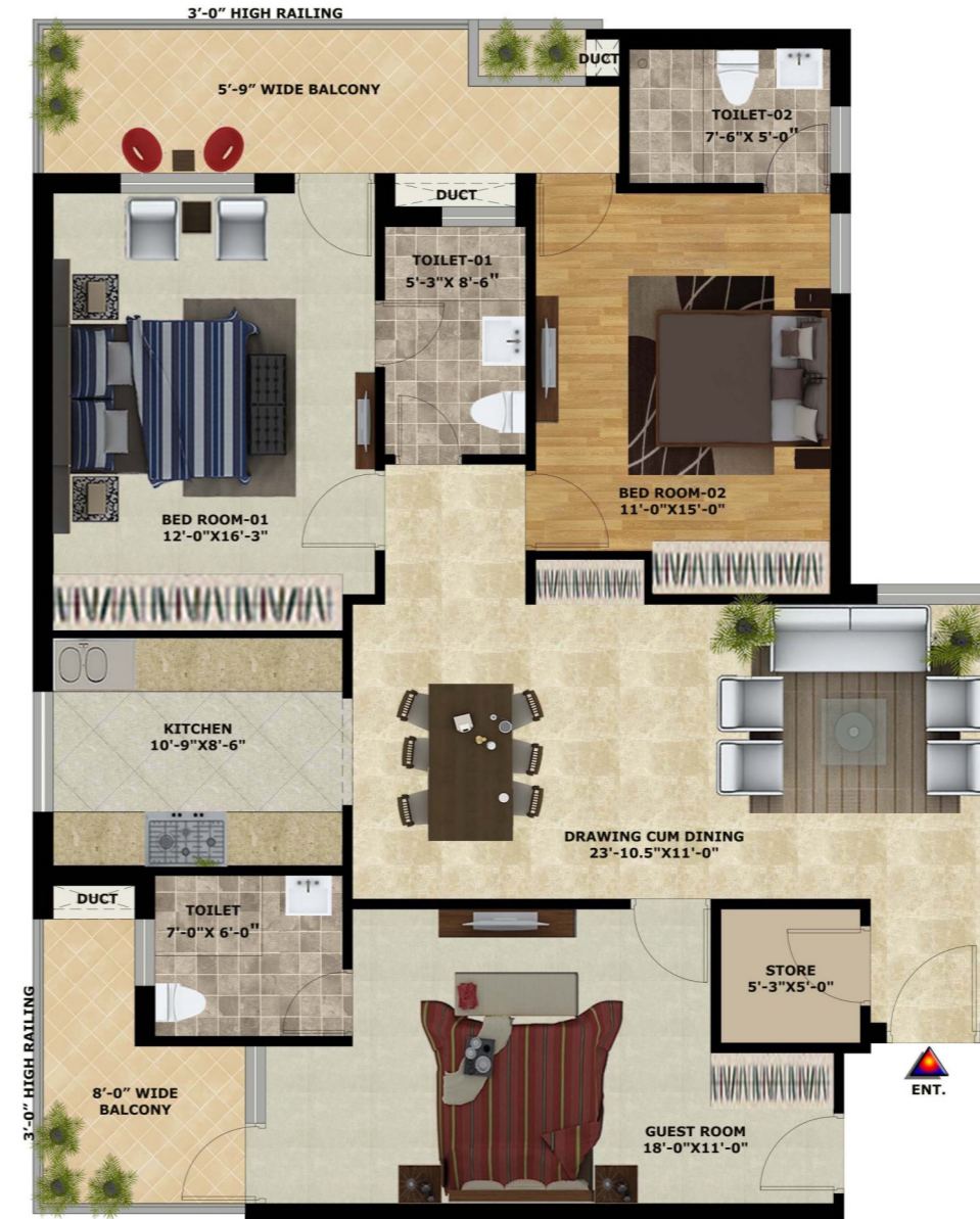
3 BHK SUPER AREA = 1683.44 SQ.FTS.