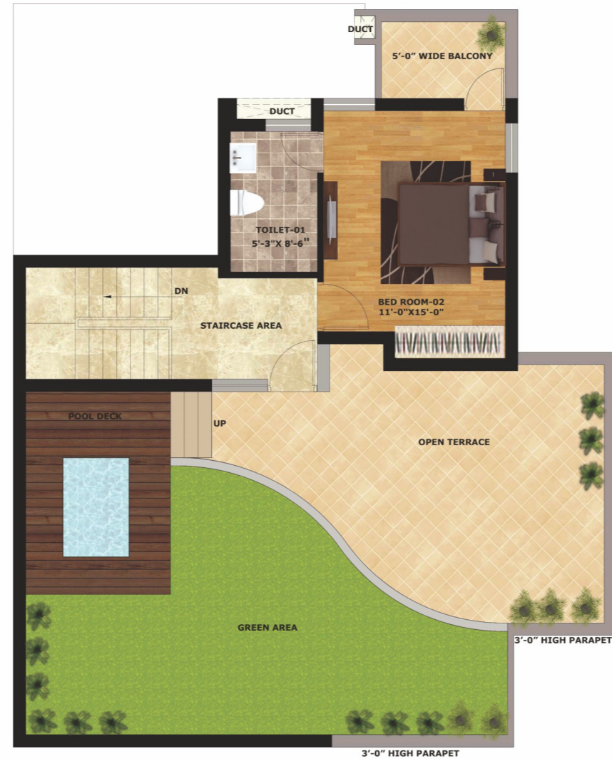
PENT HOUSE TERRACE SUPER AREA = 2924.00 SQ.FTS.