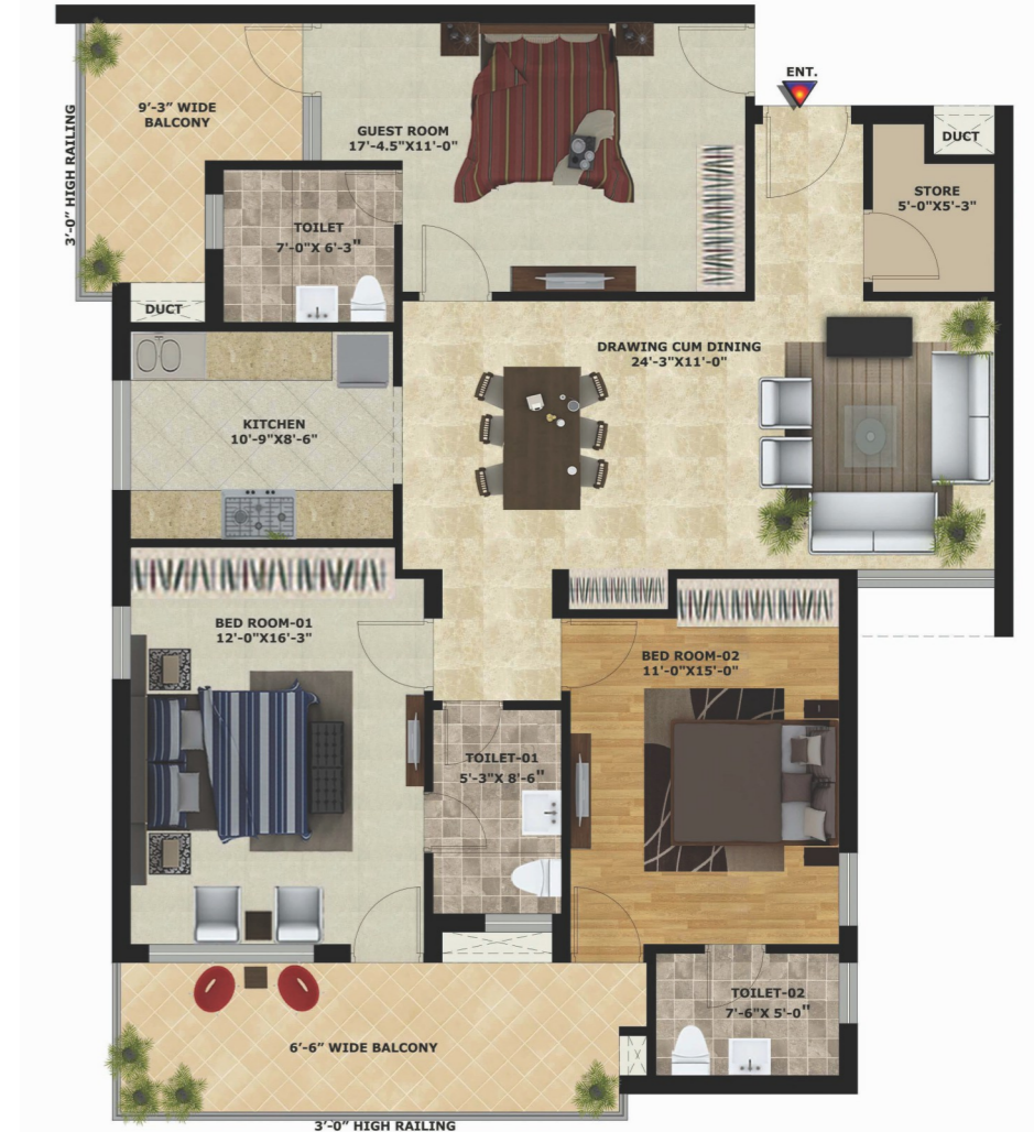
3 BHK SUPER AREA = 1683.44 SQ.FTS.