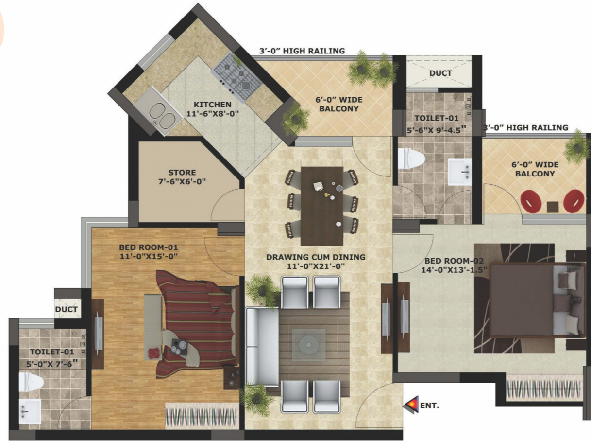
2 BHK SUPER AREA = 1260.00 SQ.FTS.

“The western towers, newest and most exciting destination”