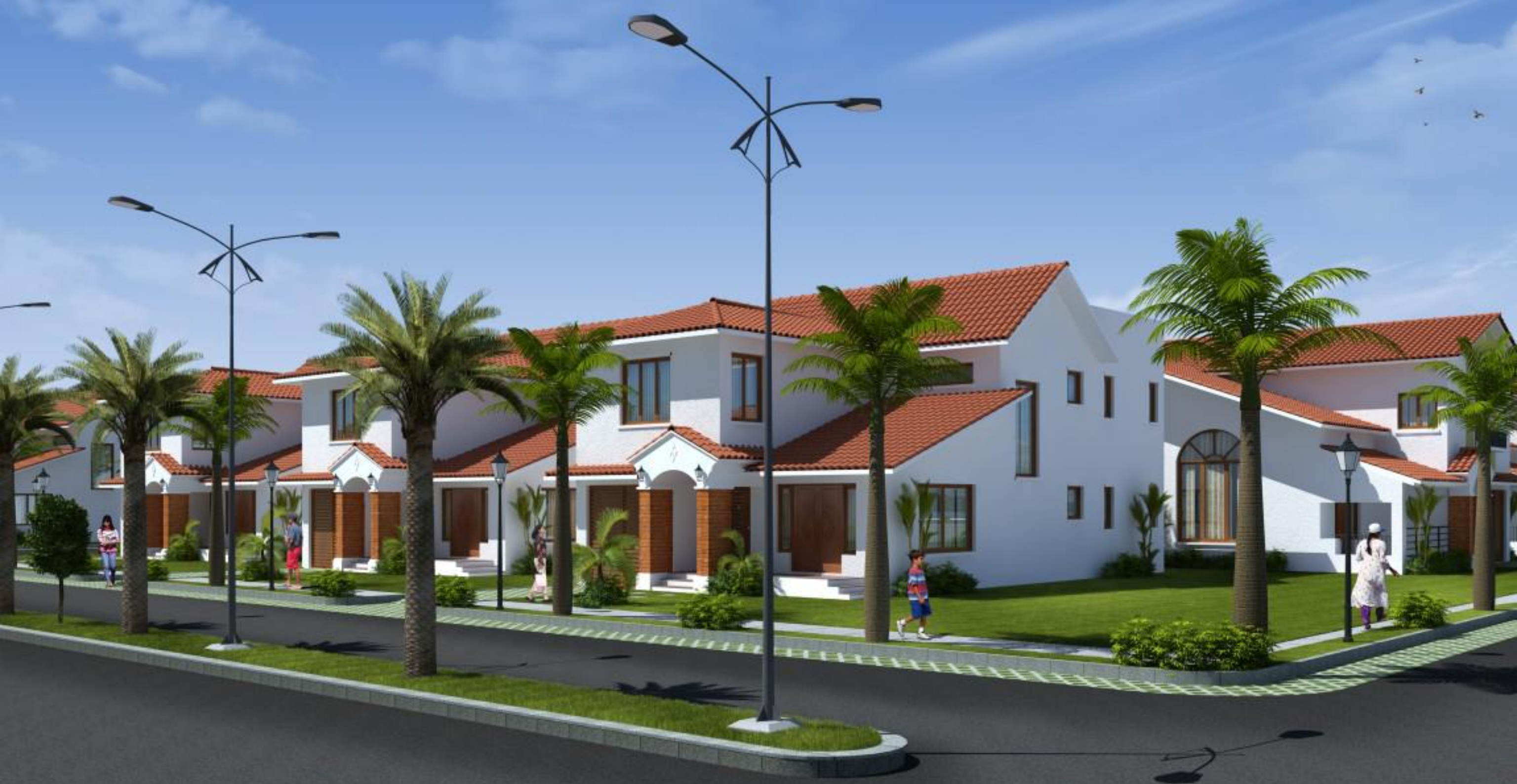
Architect's Impression of the Centre Medians