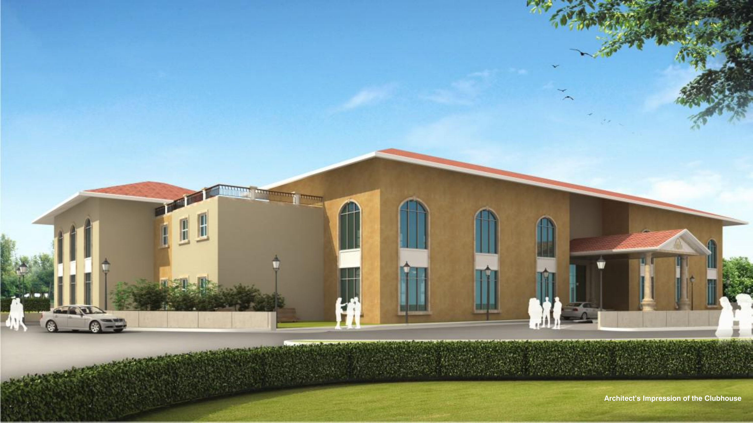
Architect's Impression of the Clubhouse