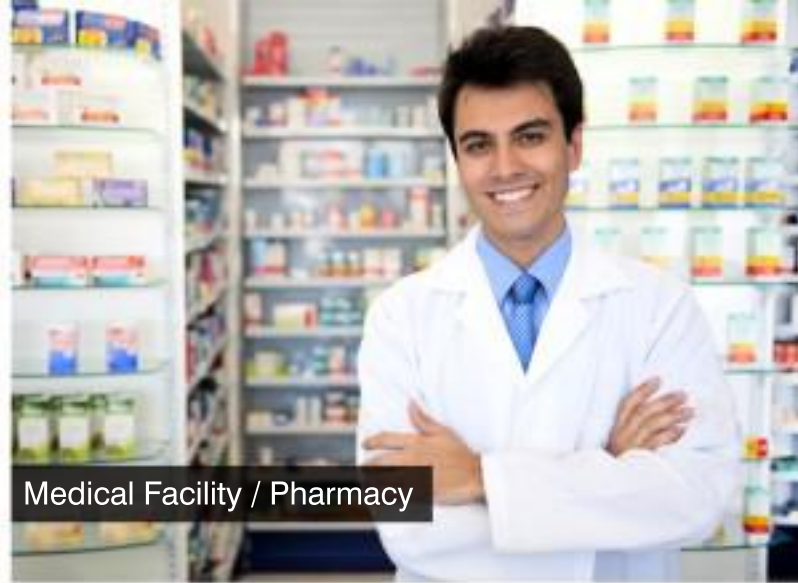
Medical Facility / Pharmacy