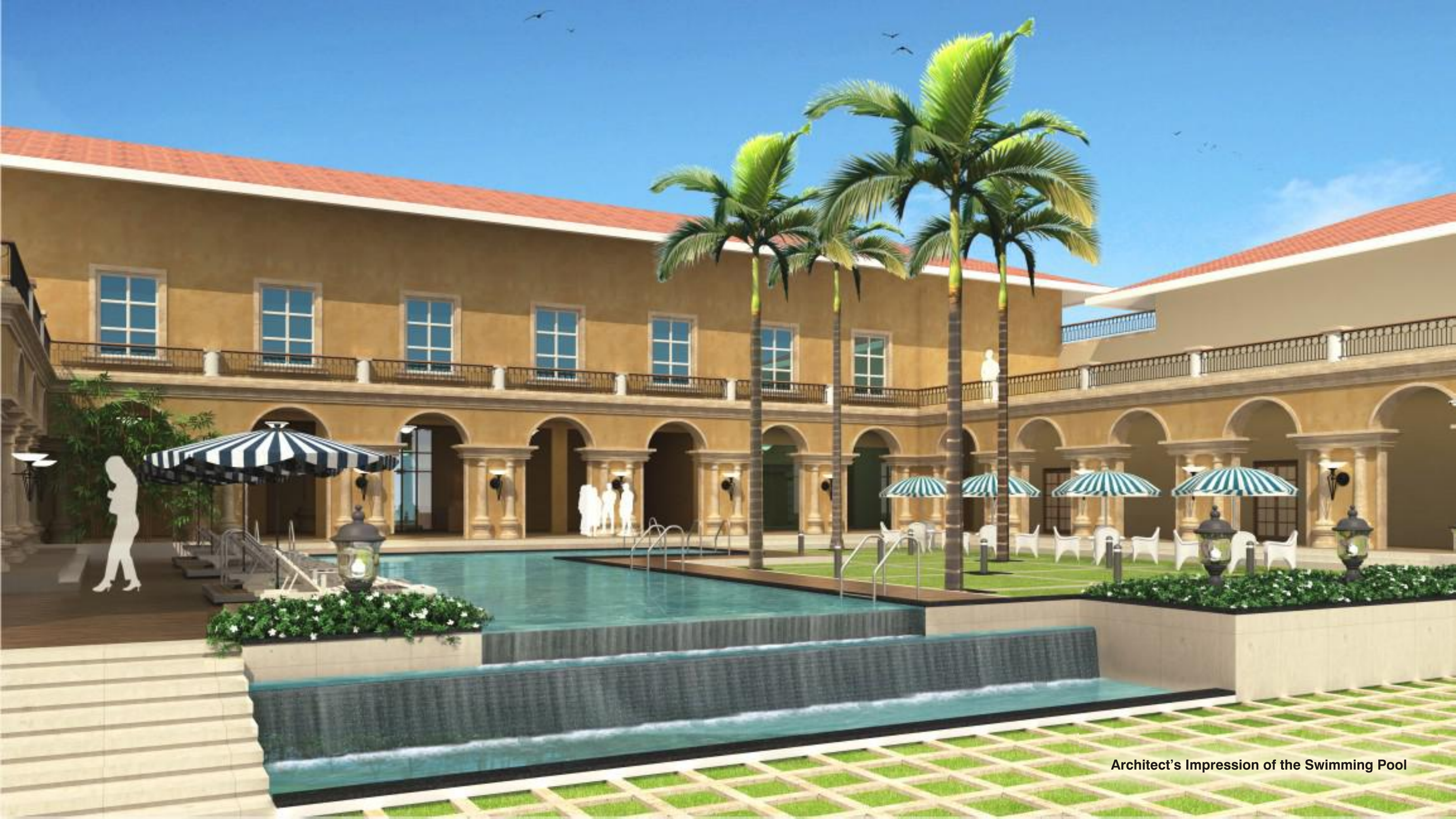
Architect's Impression of the Swimming Pool