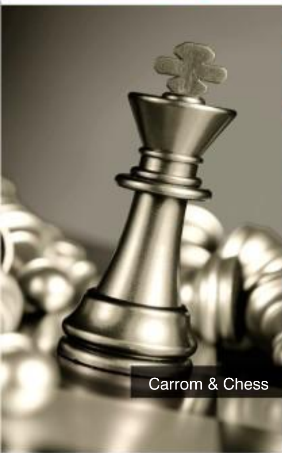
Carrom & Chess