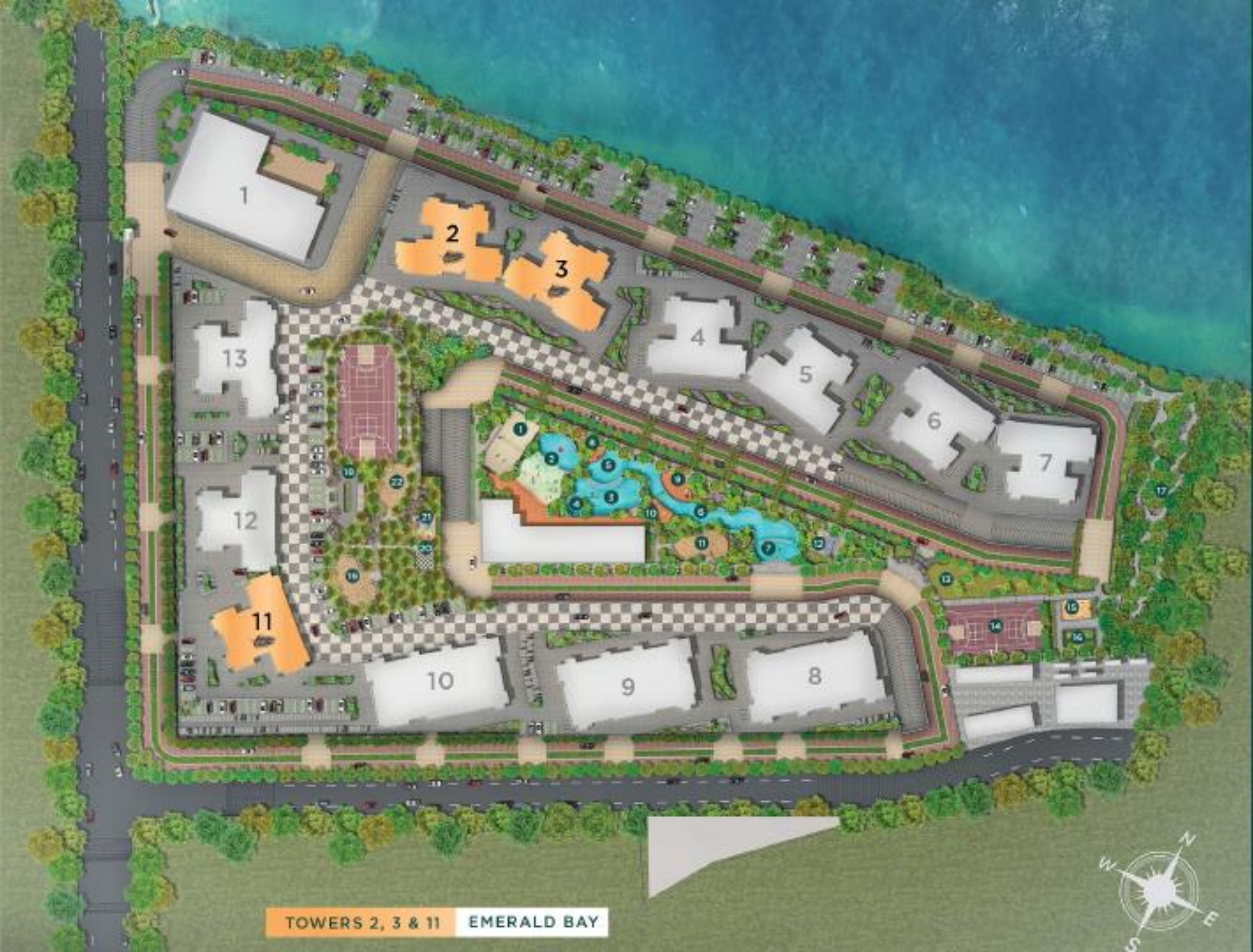
TOWERS 2, 3 & 11 EMERALD BAY