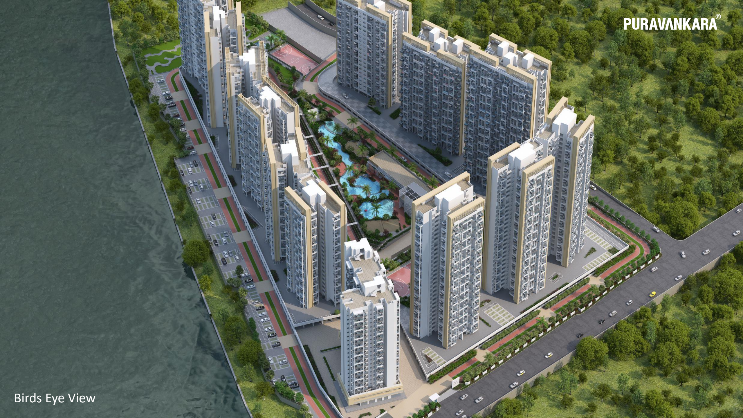
Birds Eye View