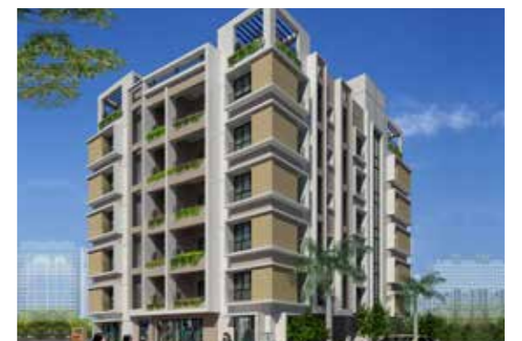
Orbit Shubham, BT Road