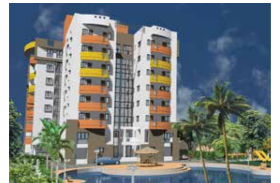
Orbit North View, BT Road