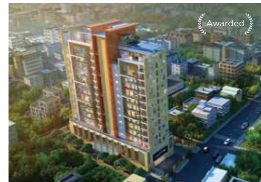
Orbit Victoria, Shakespeare Sarani