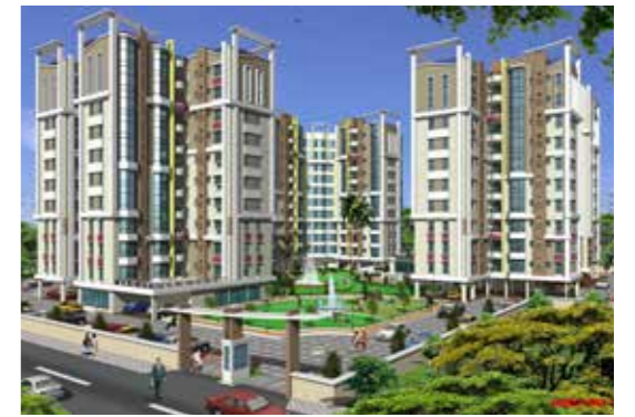
Orbit Sky View, BT Road