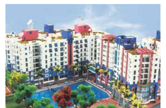
Orbit City, Jadavpur