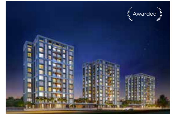
Orbit Ashwa, Alipore