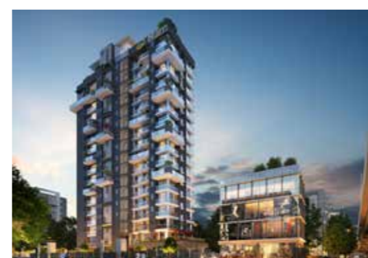
Orbit Ekam, Minto Park