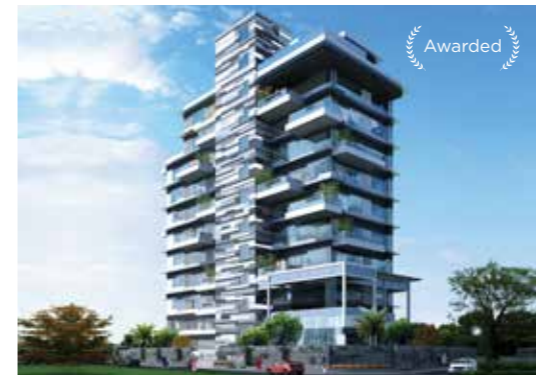
Orbit Royale, Alipore