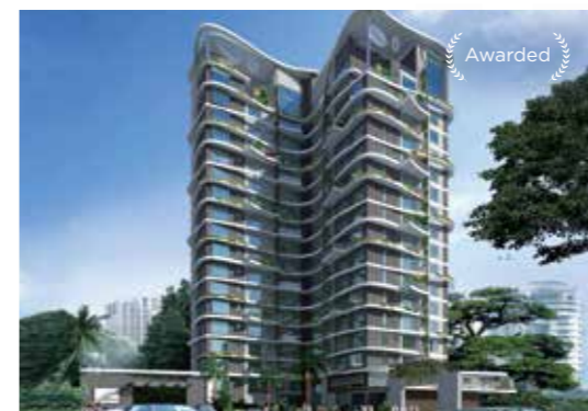
Orbit Sky Garden, Ballygunge