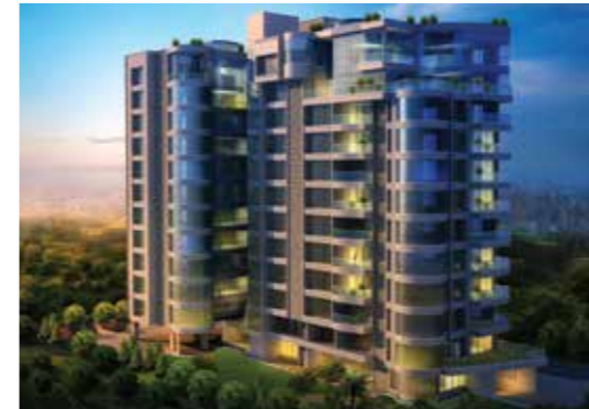
Orbit Crystal, Alipore