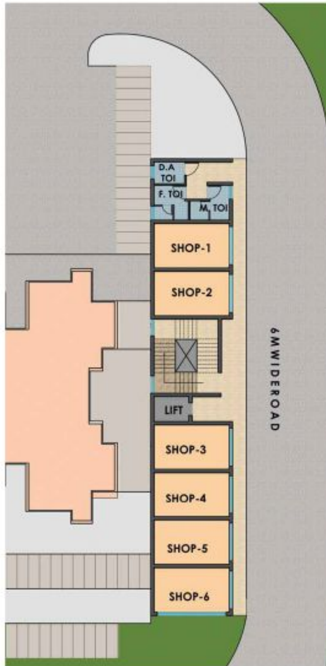
COMMERCIAL BLOCK-3, GROUND FLOOR PLAN