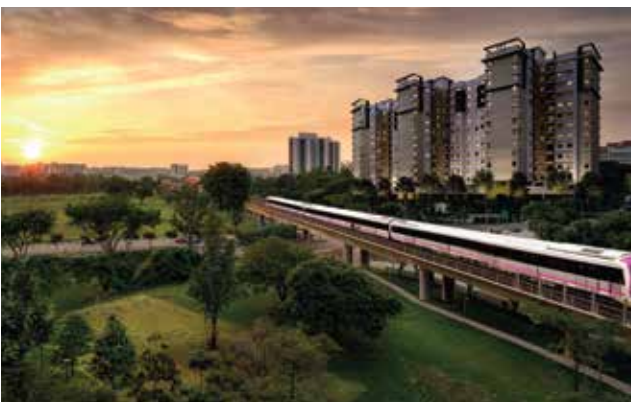
#MYHOMEMYLIFE NEAR MYSORE ROAD - NICE JUNCTION, BENGALURU 2 & 3 BHK Apartments