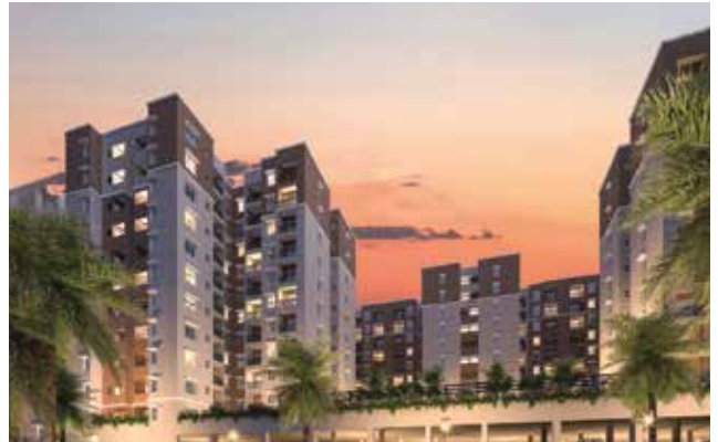
PROVIDENT CAPELLA WHITEFIELD, BENGALURU Pods, 1, 2 & 3 BHK Apartments