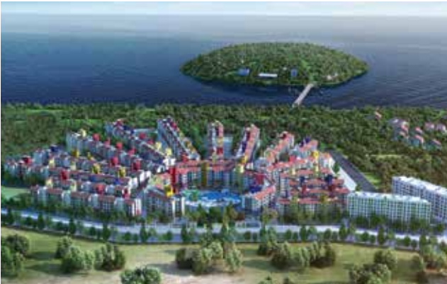
PROVIDENT AROHA GOA DABOLIM @ CENTRAL GOA 1, 2 & 3 BHK Apartments