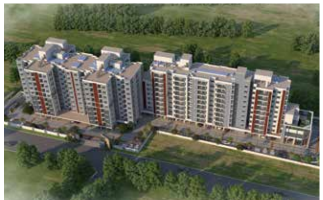
#TOOGOODHOMES NEAR MANYATA TECH PARK, BENGALURU 2 BHK Apartments