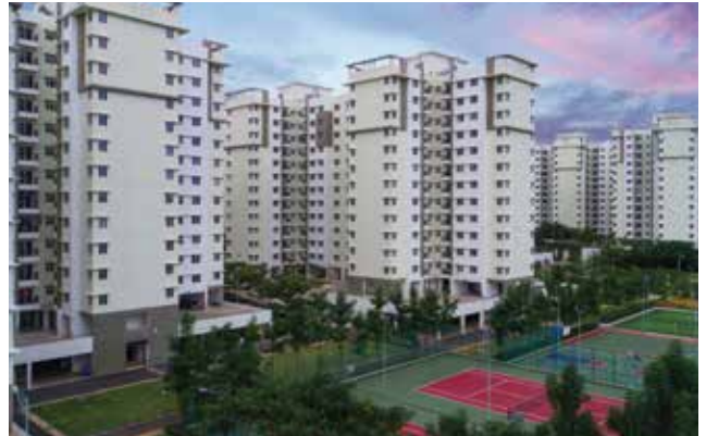
PROVIDENT SUNDECK OFF MYSORE ROAD, BENGALURU 2 & 3 BHK Apartments