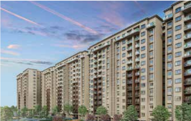
PROVIDENT PARK SQUARE KANAKAPURA ROAD, BENGALURU 1, 2 & 3 BHK Apartments