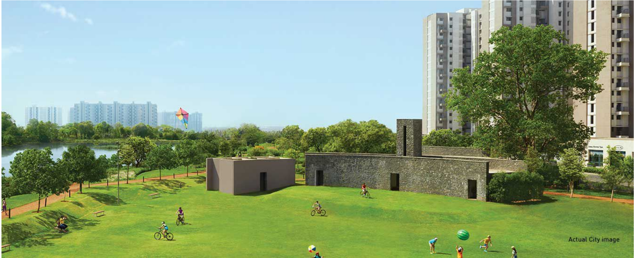
Actual City image