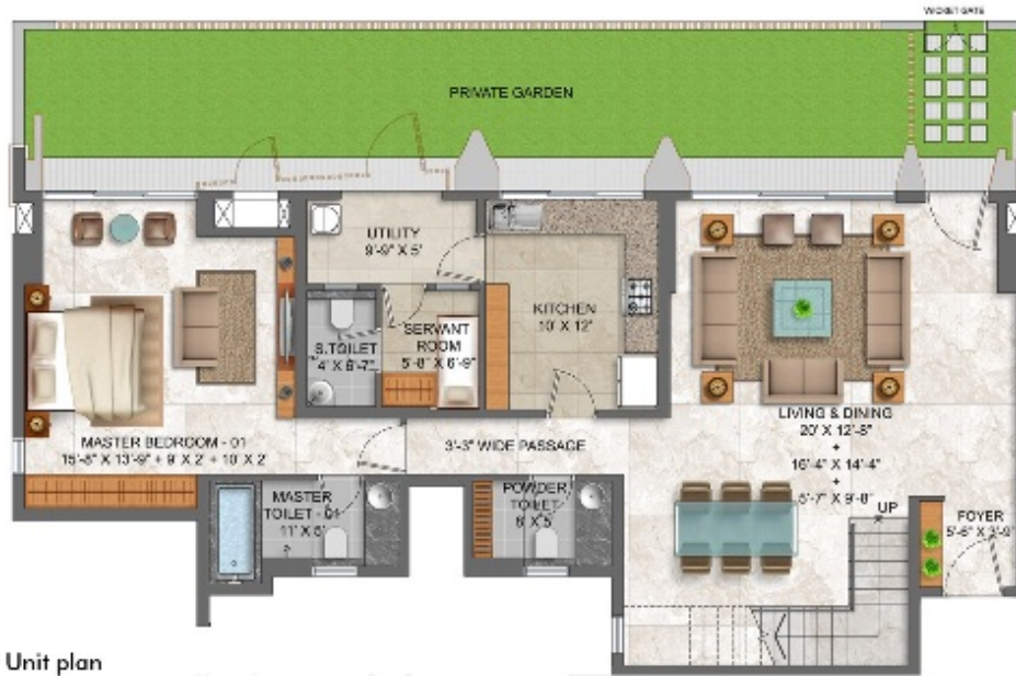
Duplex-ground floor Unit plan