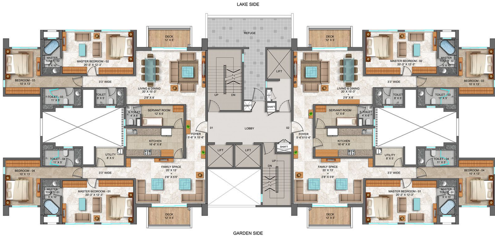
20 (REFUGE) FLOOR