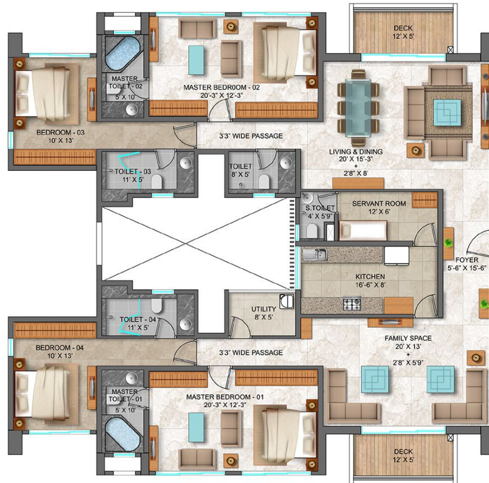
Penthouse Unit plan