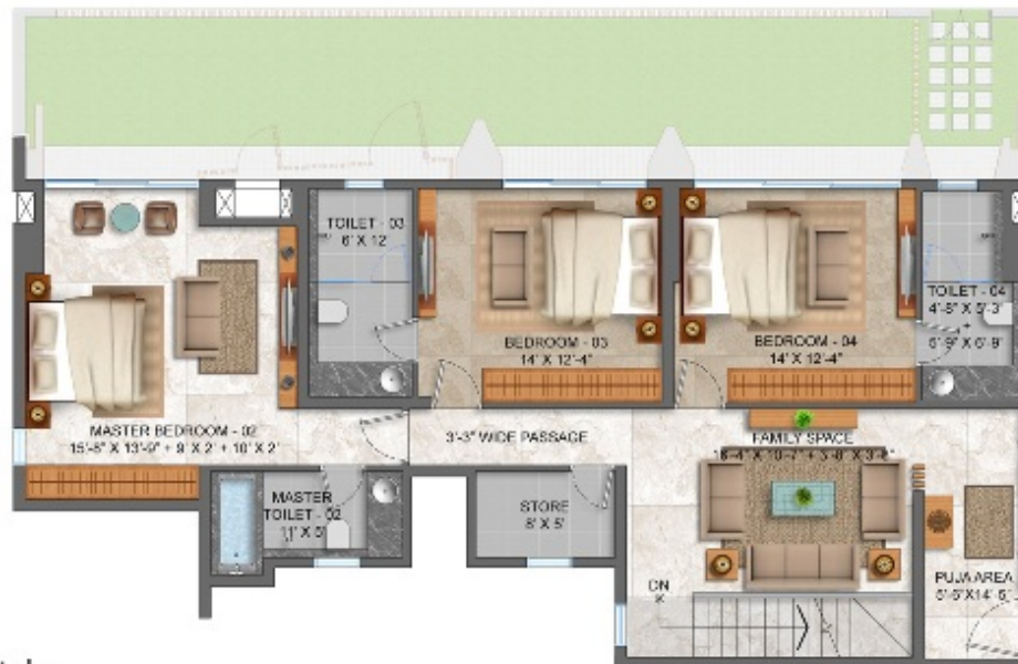
Duplex-first floor Unit plan