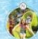
Children's play Area A