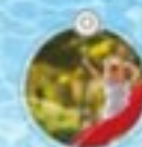
Children's play Area B