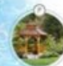
Sit Out & Gazebo