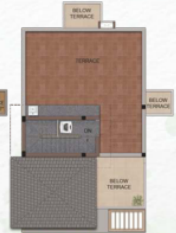
TERRACE FLOOR PLAN