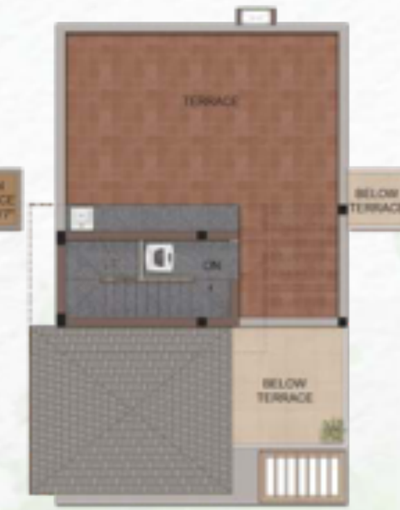
TERRACE FLOOR PLAN