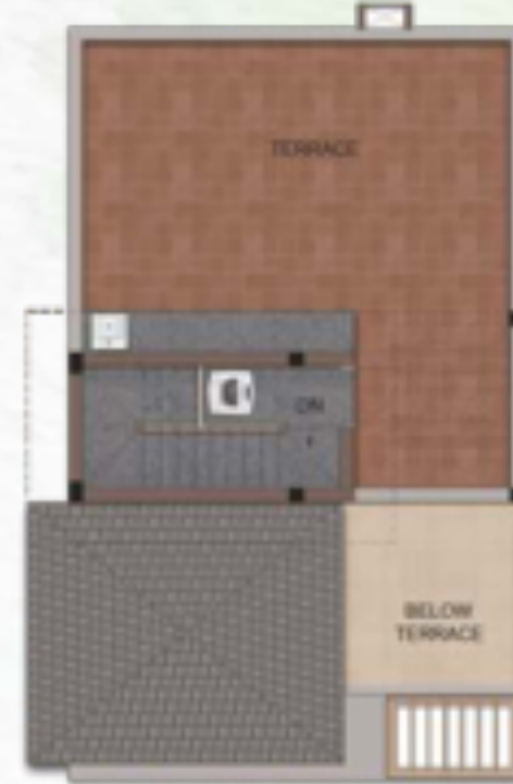
TERRACE FLOOR PLAN