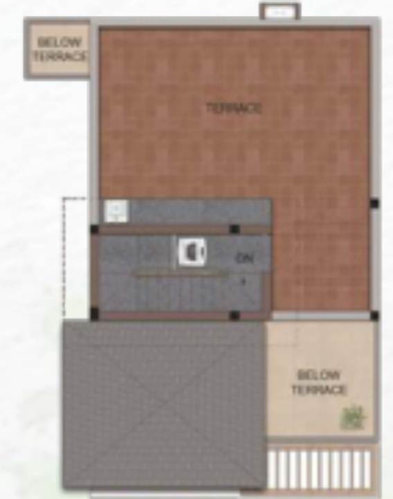
TERRACE FLOOR PLAN