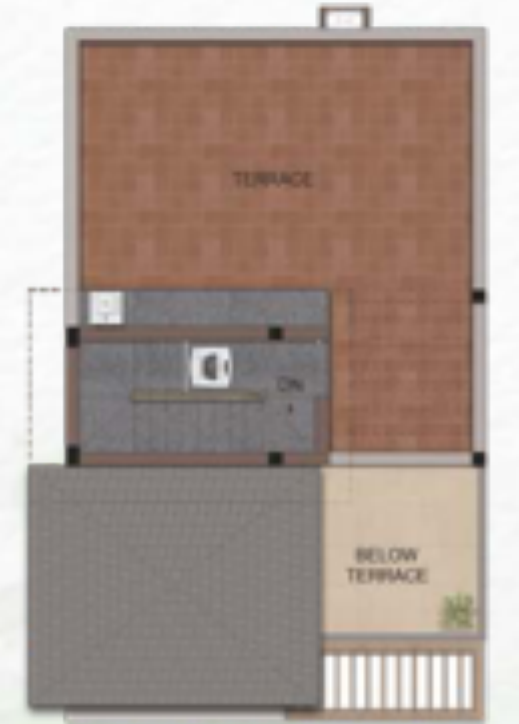
TERRACE FLOOR PLAN