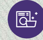
PROVISION FOR LAUNDRY FACILITY