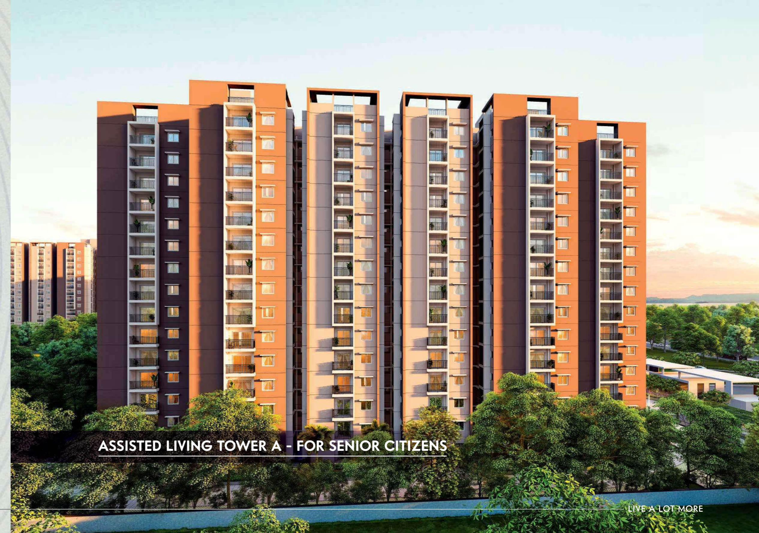
ASSISTED LIVING TOWER A - FOR SENIOR CITIZENS