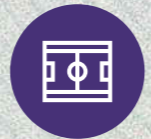
MINI SOCCER / PLAY LAWN