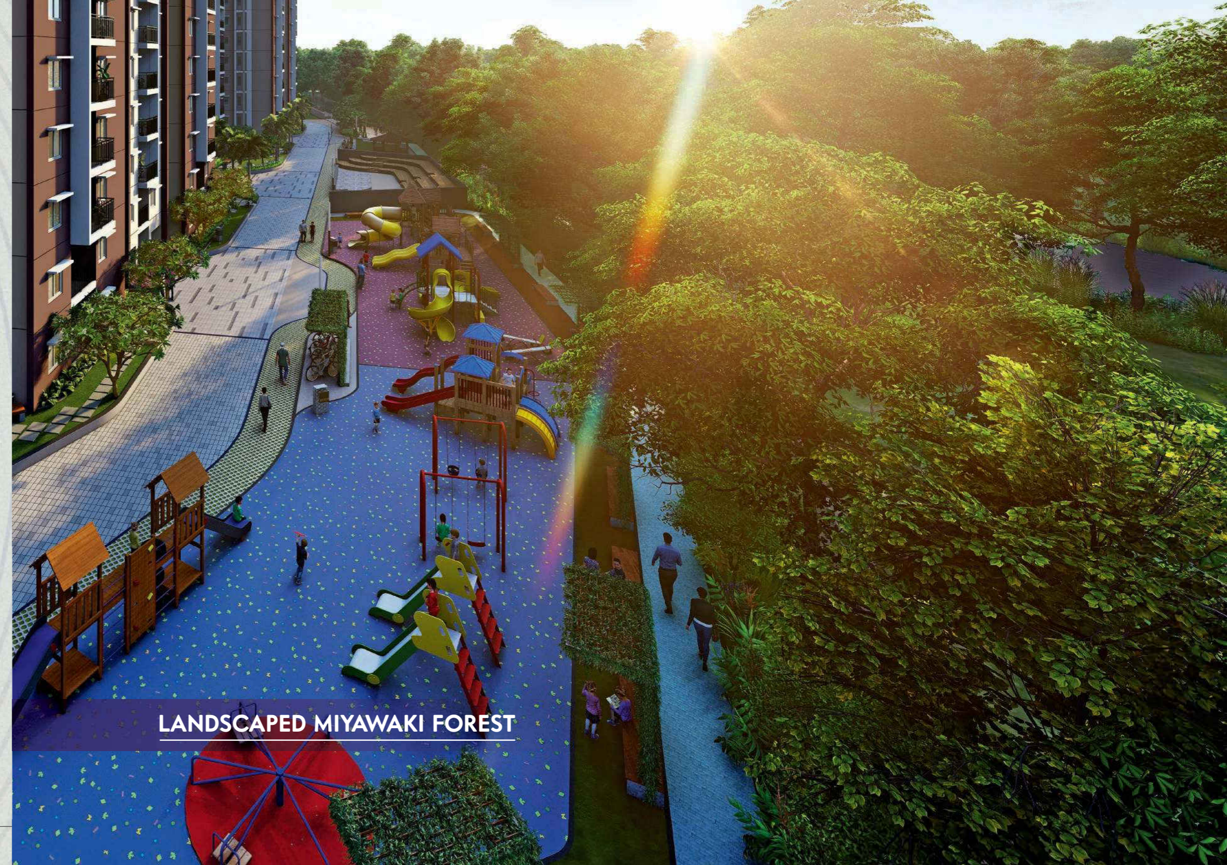
LANDSCAPED MIYAWAKI FOREST

One the most unique features of Symphony is the Miyawaki Forest that is part of our property. Miyawaki Forests are a Japanese method of creating dense vegetation in an area. It's like an urban forest of sorts. By creating this, we're ensuring that the residents of Ramky One Symphony always get the fresh air they deserve.