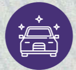
PROVISION FOR CAR WASH