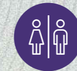
DRIVERS AND MAIDS TOILETS