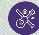
ACTIVITY ZONES IN ENTRANCE LOBBIES