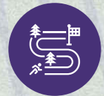
WALKING & JOGGING TRACK