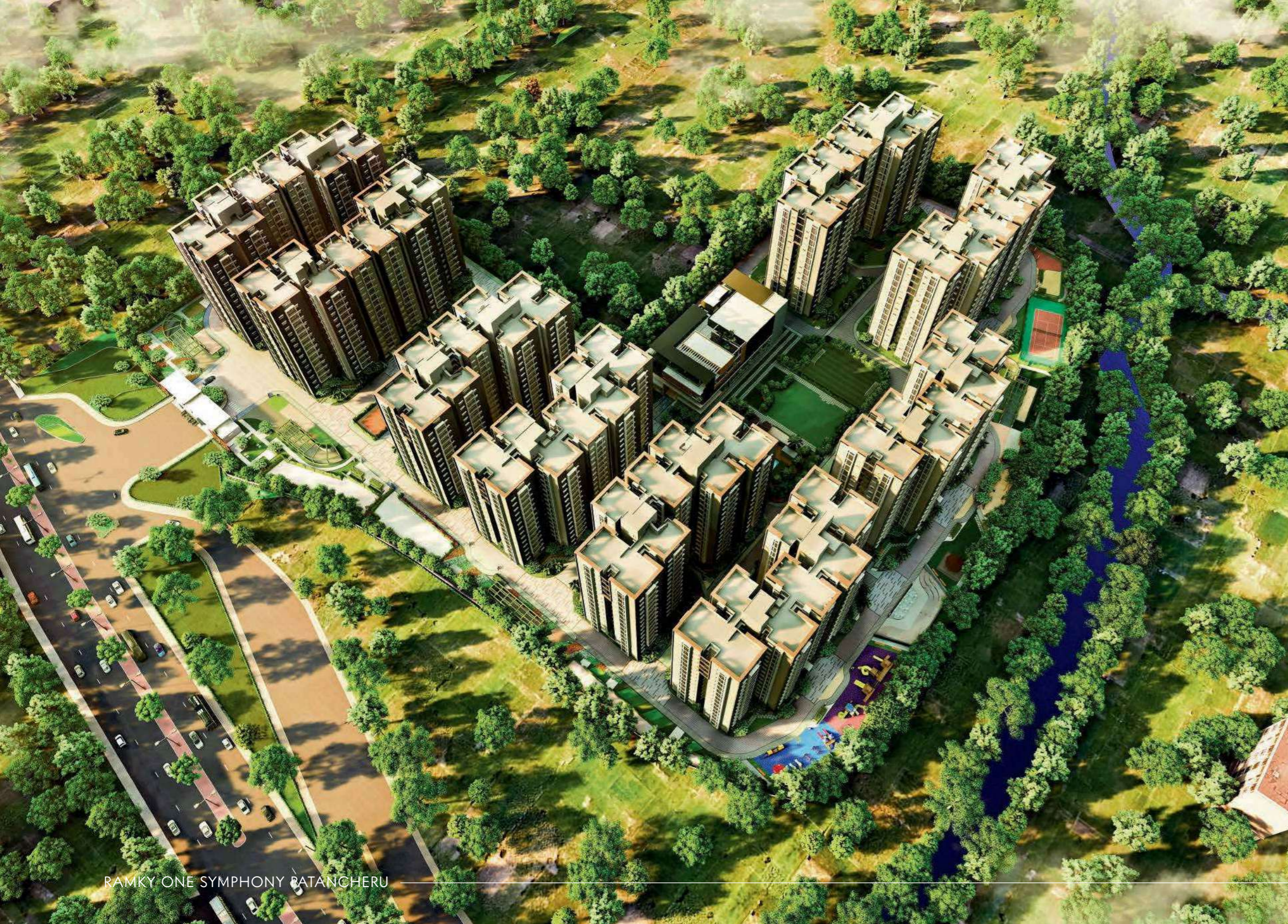
RAMKY ONE SYMPHONY RATANCHERU