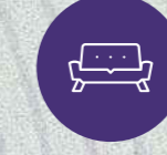
SENIOR CITIZEN SEATING ZONE