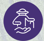
SENIOR CITIZEN ACTIVITY ZONE