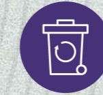
GARBAGE COLLECTION THROUGH GARBAGE CHUTES