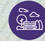
INFORMAL SEATING AREA