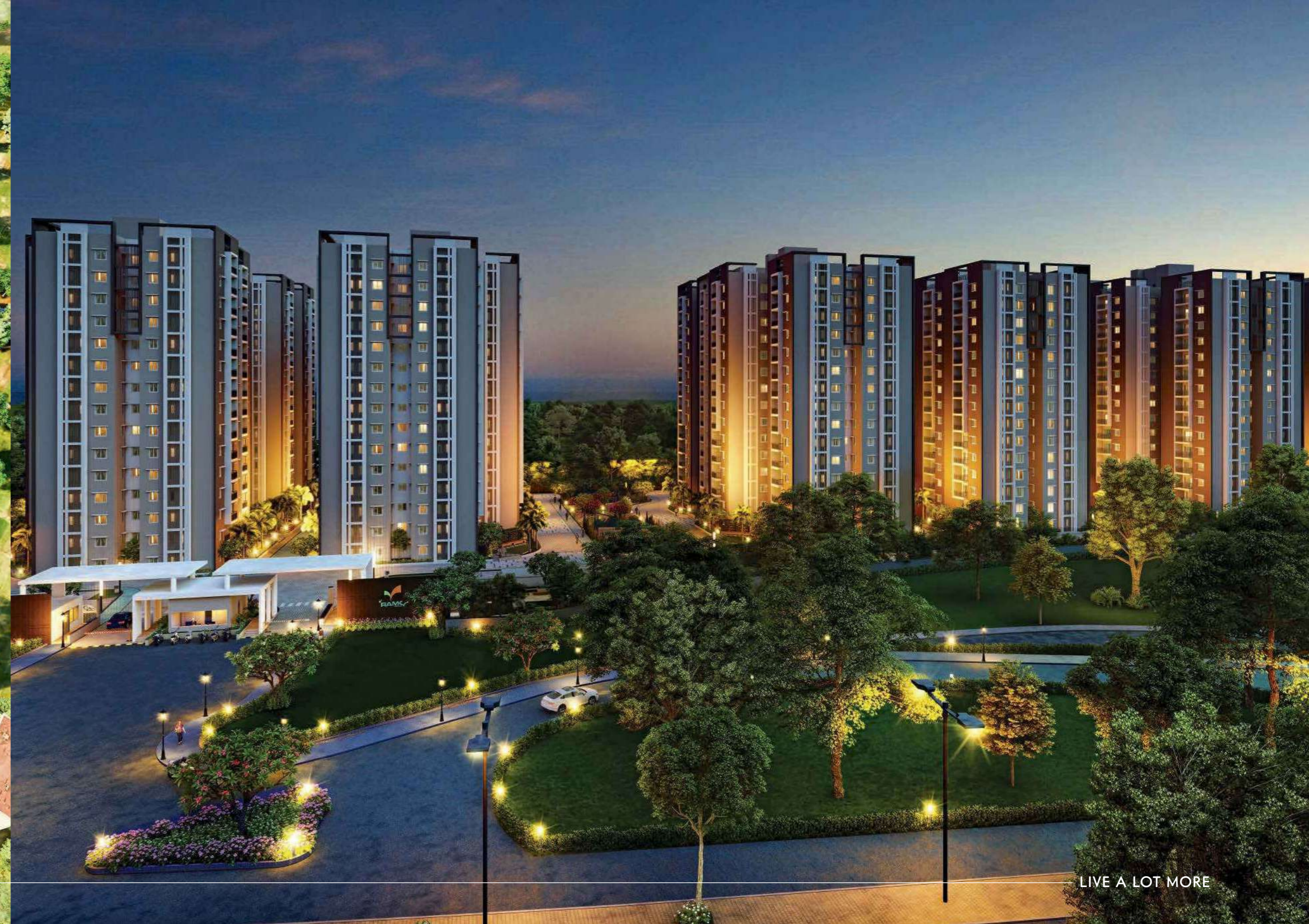
LIVE A LOT MORE