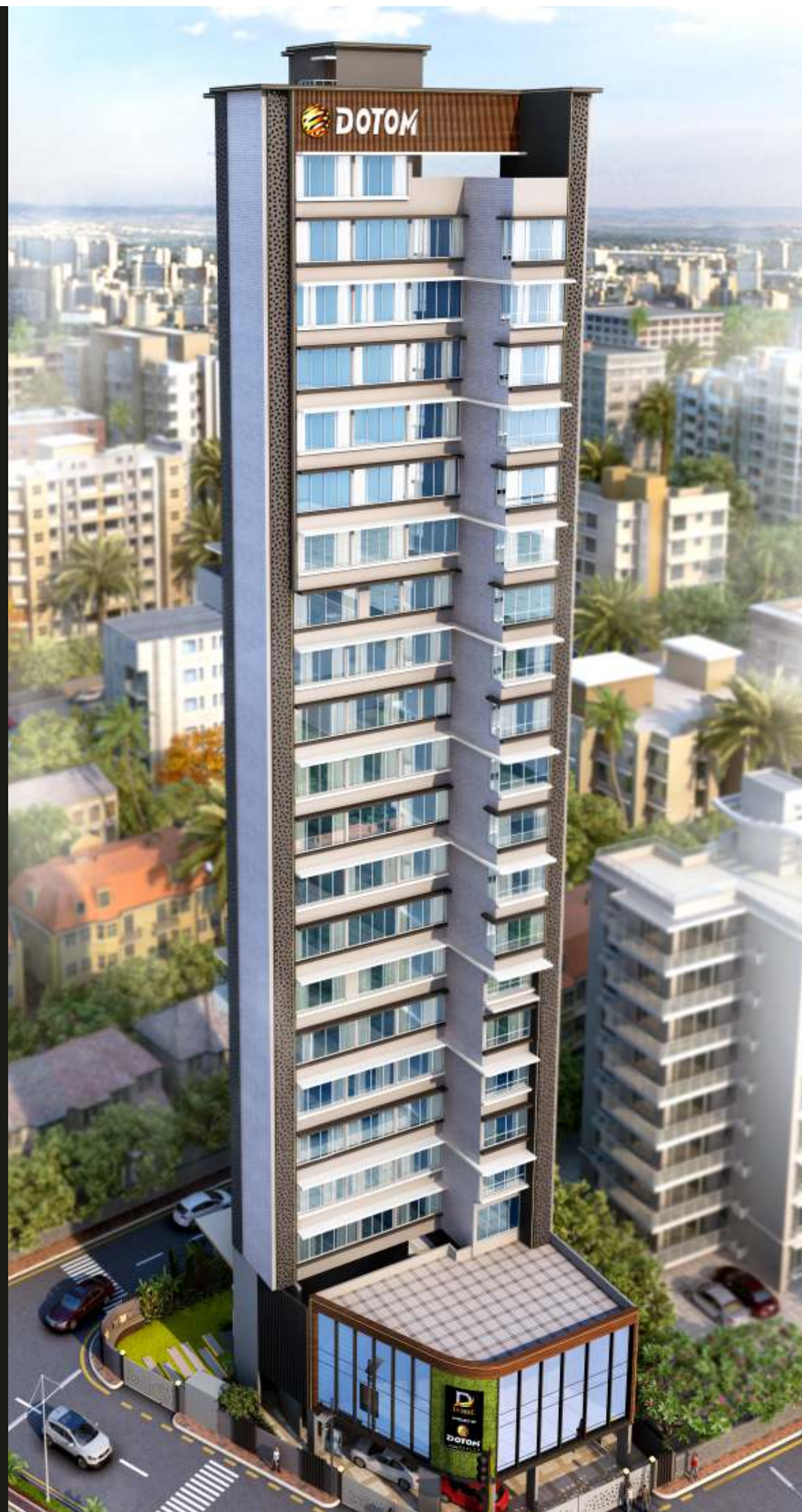
Magnificent By Day