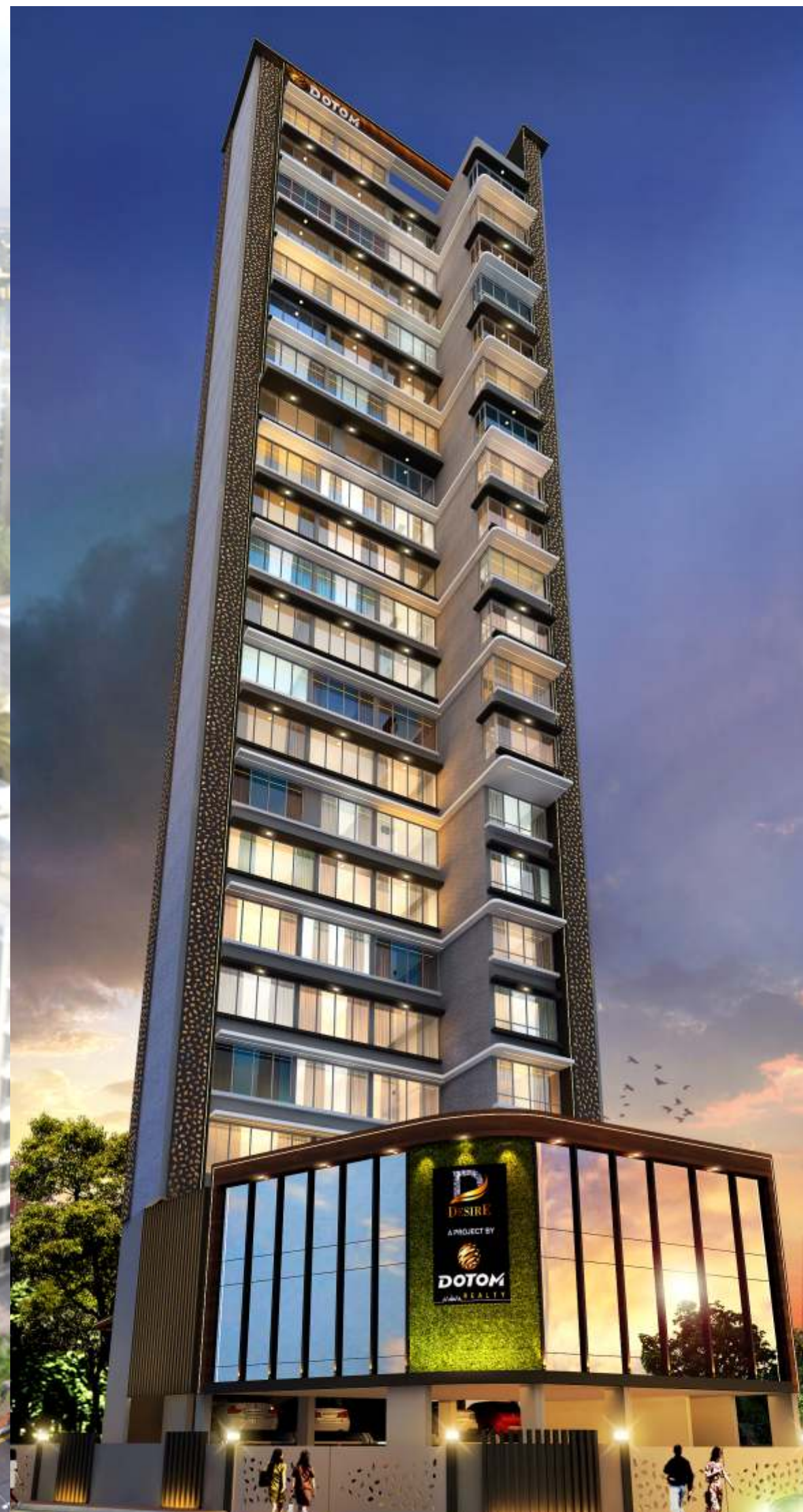
Dazzling By Night