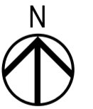
2nd to 17th, 19th to 27th, 29th to 32nd Floors