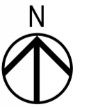
2nd to 17th, 19th to 27th, 29th to 32nd Floors