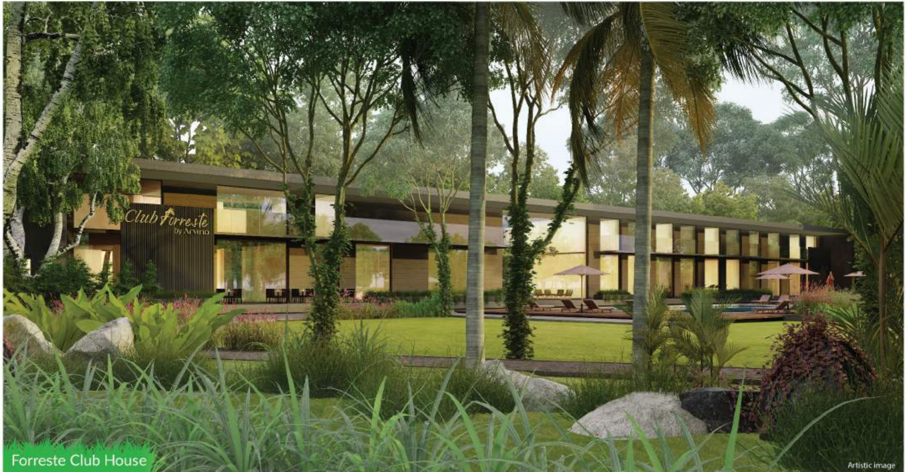
Forrester Club House

The clubhouse at Forrester is a complete experience in itself. Family activities or solo relaxation, this centerpiece of life at Forrester has been designed to suit all your needs.