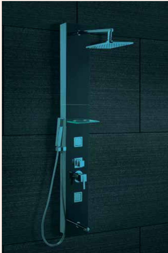
3-FIXTURE SHOWER PANEL