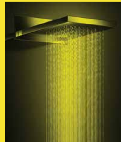
Rain Shower in Master Bath