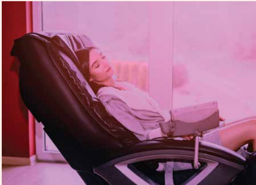
NECK TO FEET MASSAGE LOUNGER