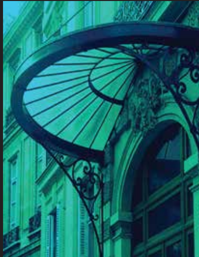
Portuguese Styled Canopy