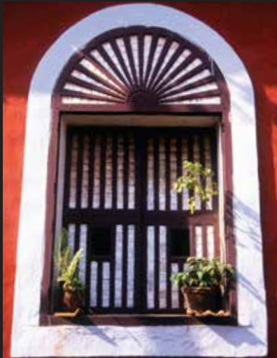
Portuguese Styled Window

The entire elevation and landscape of Balinese Residences stems from the idea of fusion. You'll find the true spirit of Goa, that's vintage yet modern in outlook. The bright coloured facade, the Piazza, Baroque statues, hand painted tiles and such other thoughtful fixtures will evoke the grandeur of bygone Portuguese era, while the ultra-modern amenities, precisely finished interiors and fixtures like rain shower in the en-suite bathroom and digital locks at the entrance are a reflection of modern living.